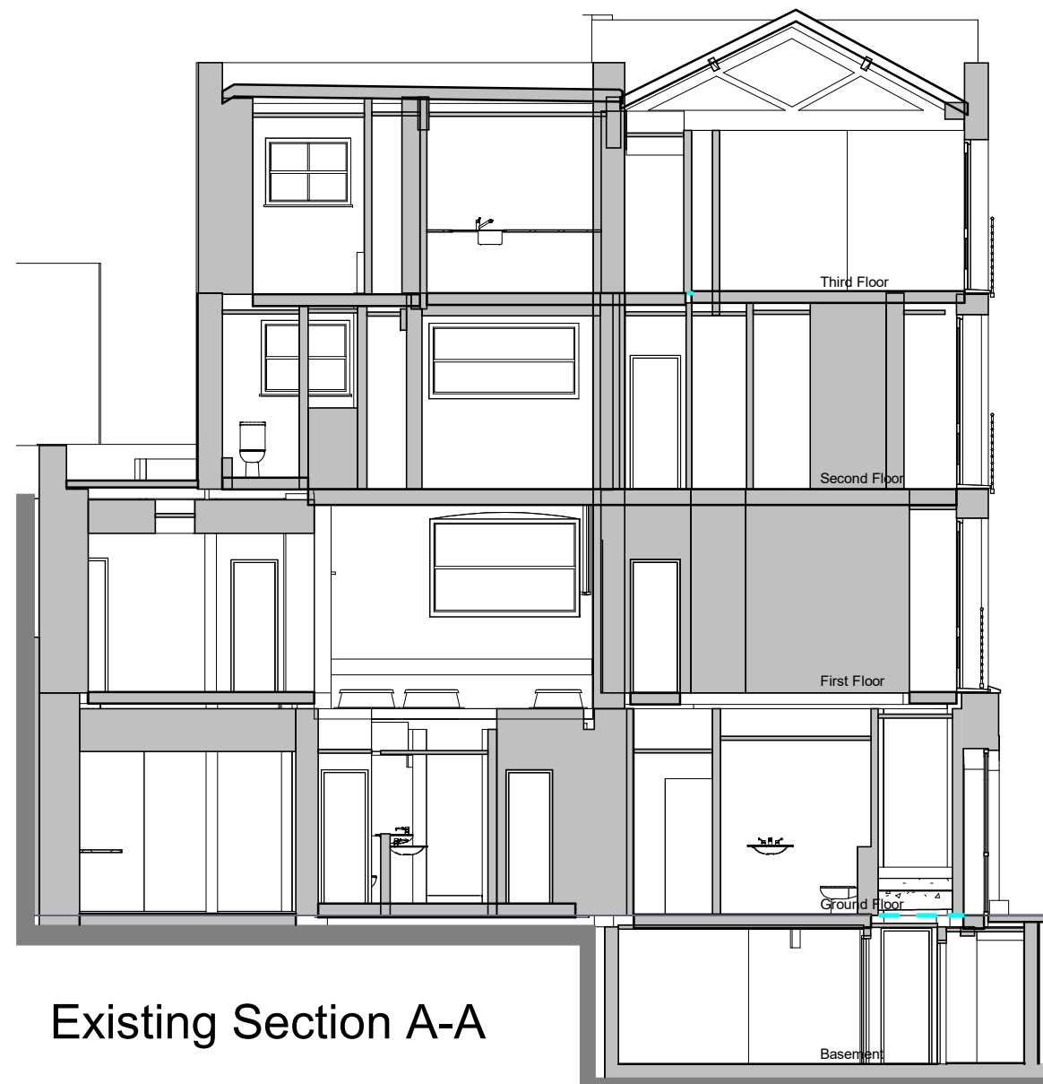
Existing Section A-A