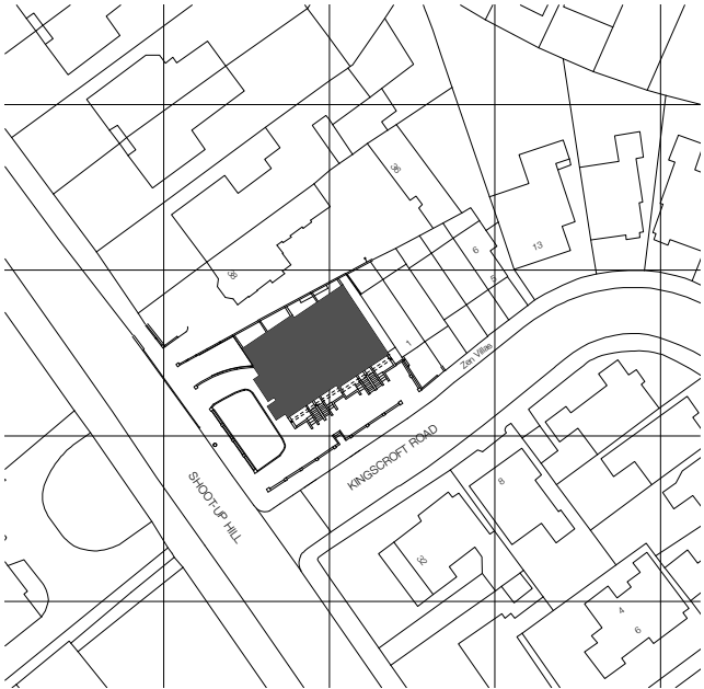
Site location plan 1:1250