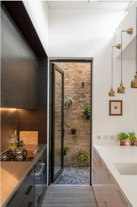
Lightwell precedent 2