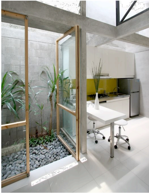
Lightwell precedent 1