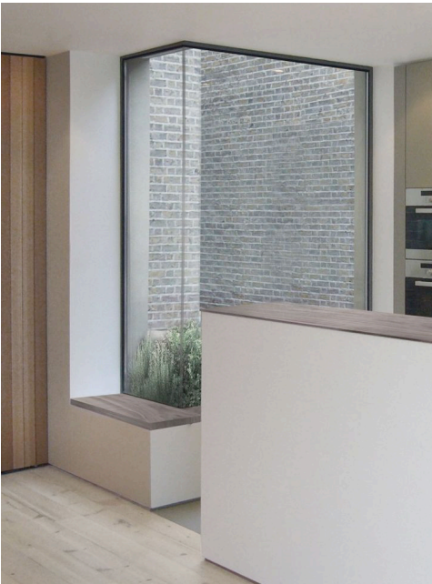
Lightwell precedent 4