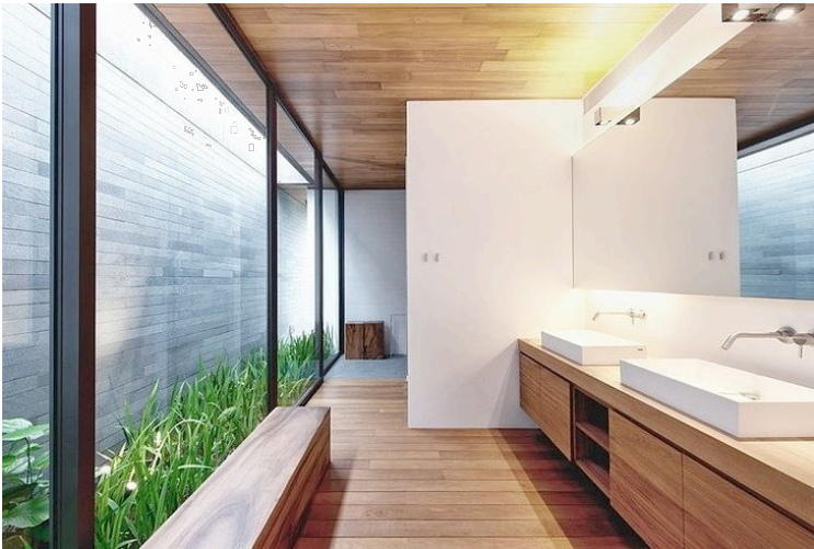
Lightwell precedent 3