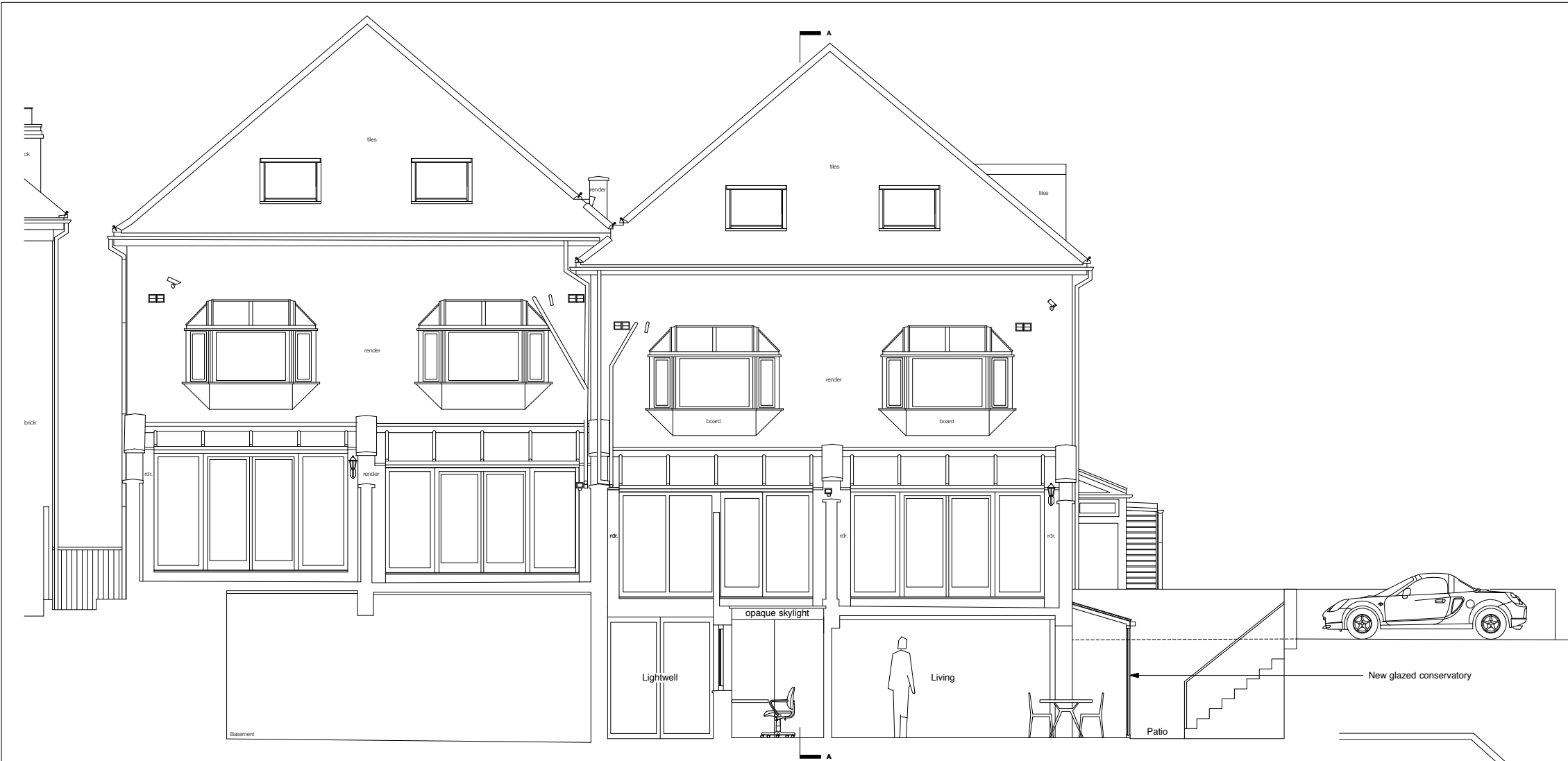
Proposed rear / north elevation