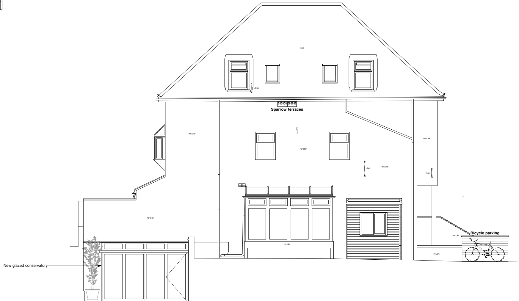
Proposed side / west elevation