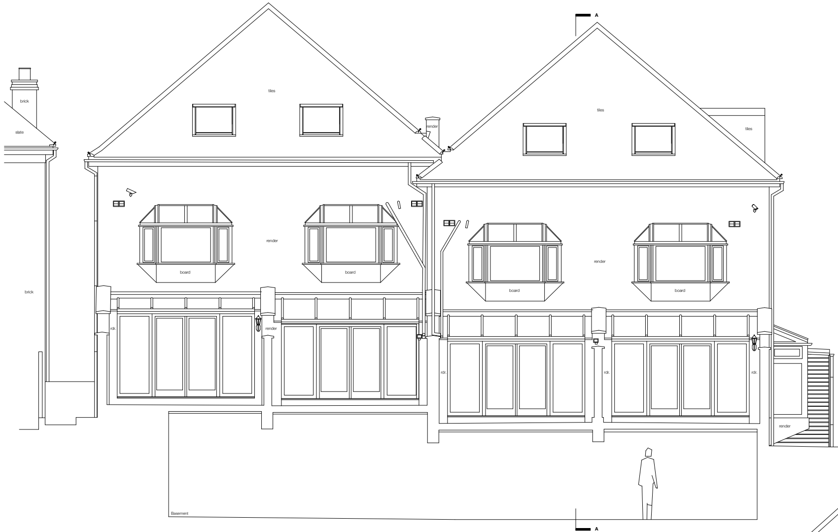
Existing rear / north elevation