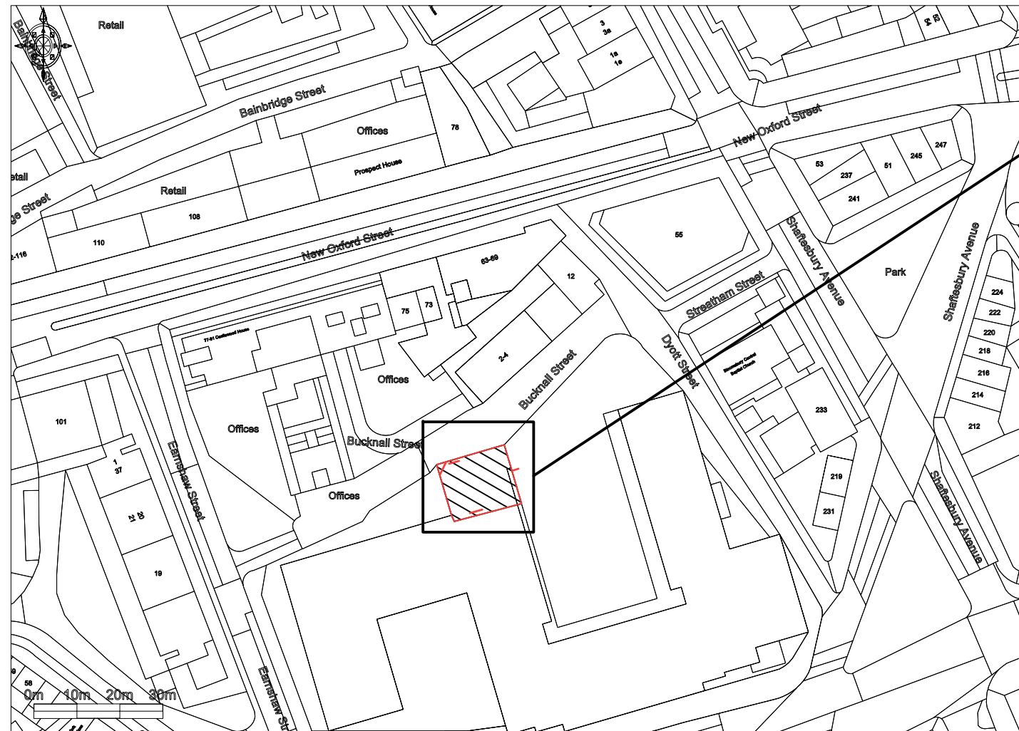
Site Plan Scale 1:1250