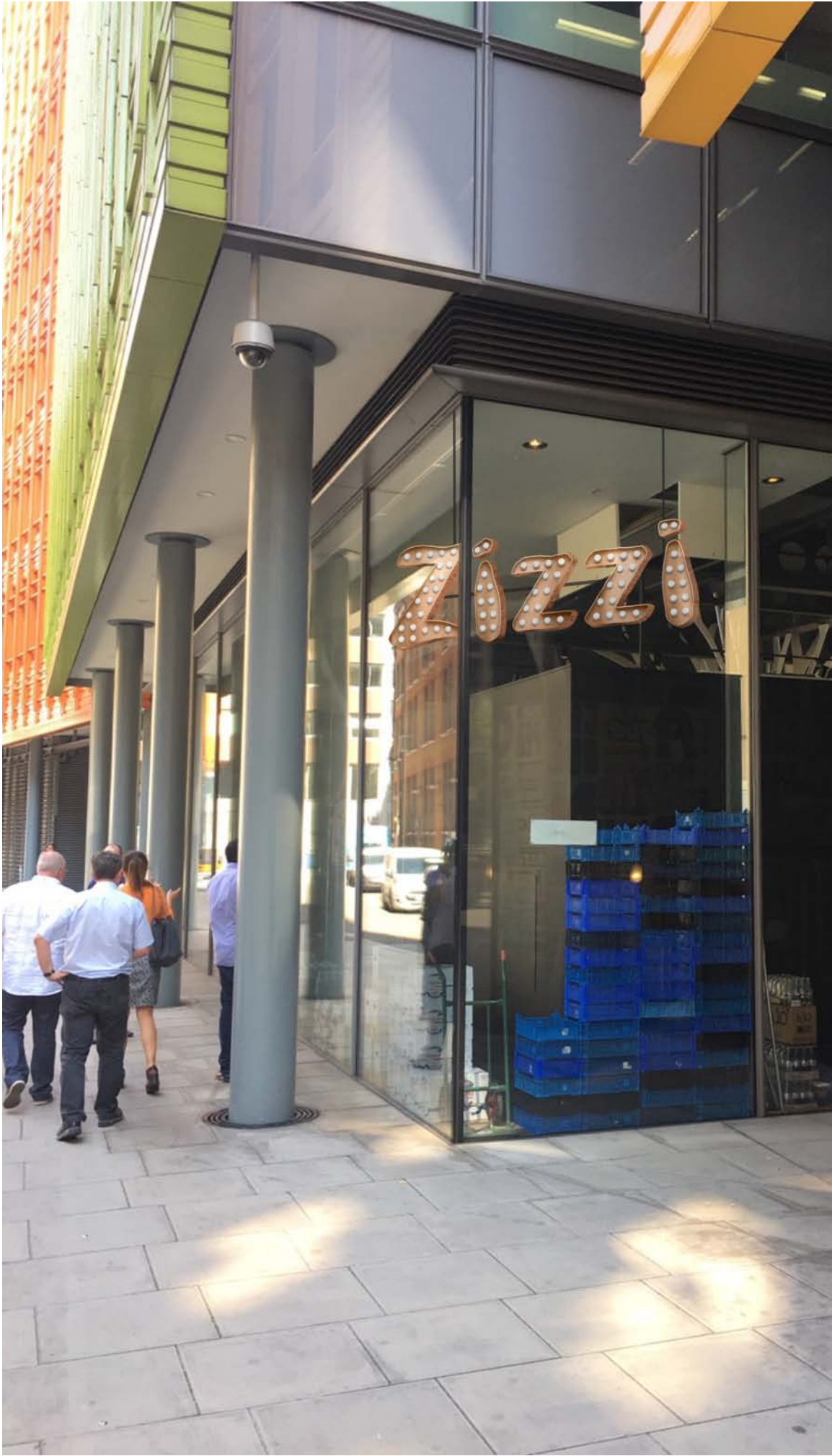
Proposed: Open trough letters with polished copper faces and aged copper returns with illuminated bulbs suspended from ceiling.