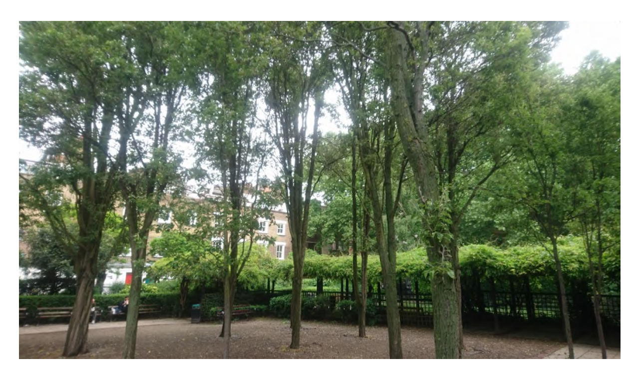
Above: The site seen from Crabtree Fields