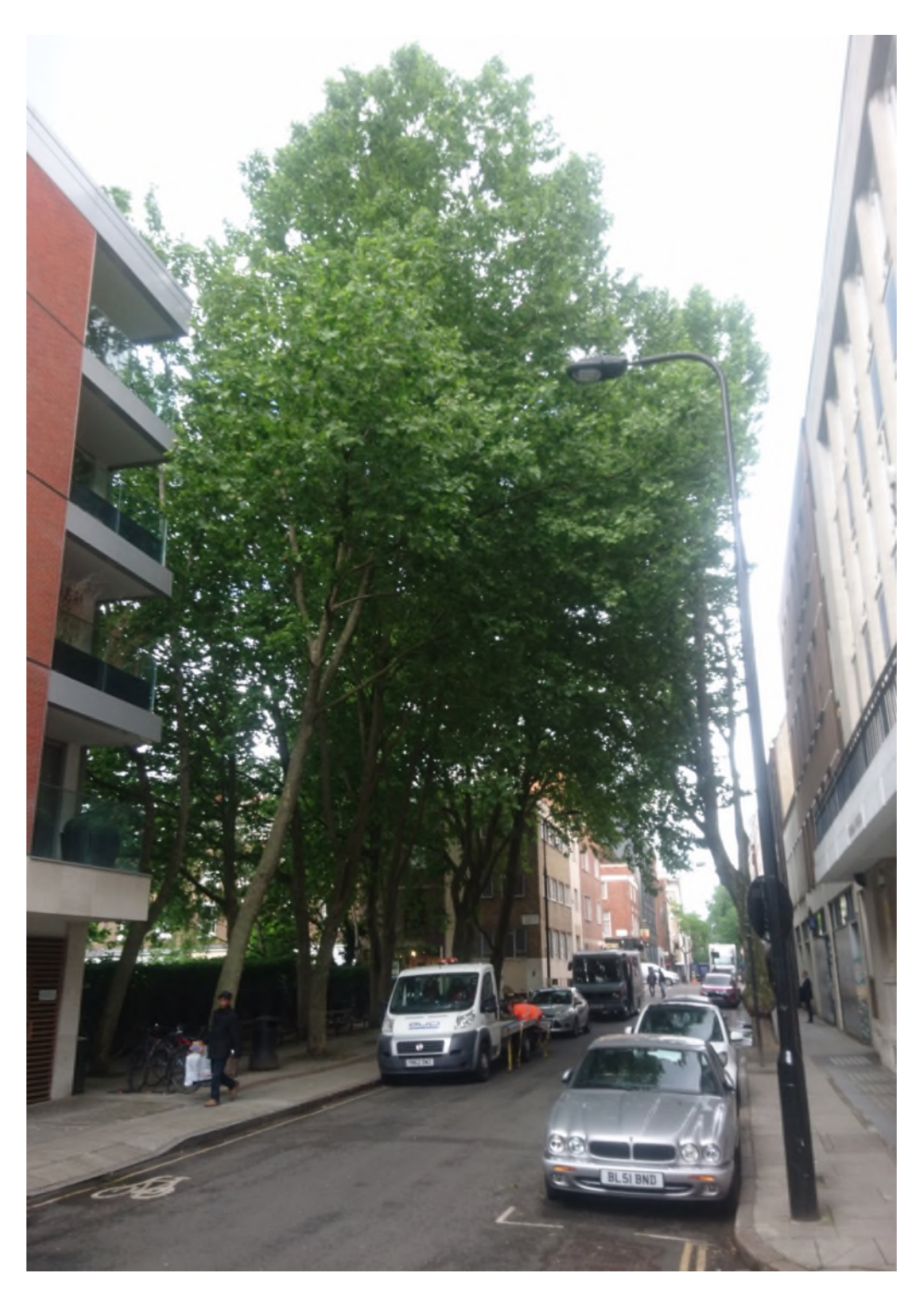
Above: The long view from Whitfield Street (objectors' View 4)