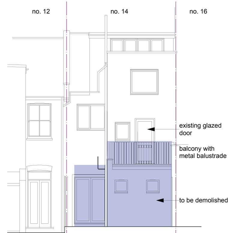
GARDEN ELEVATION - WEST