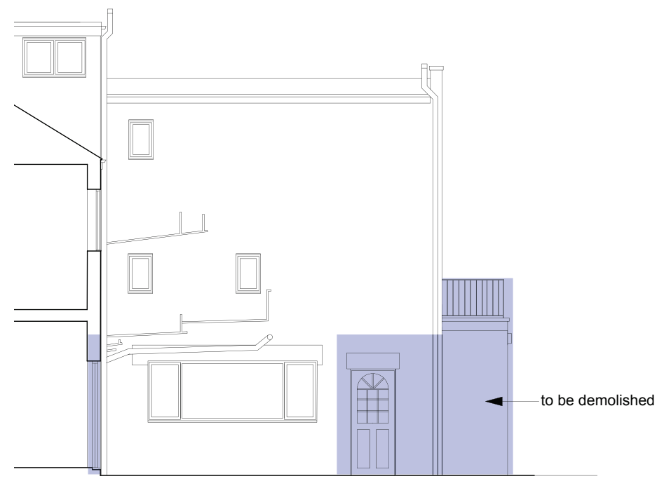
SECTION / ELEVATION BB - NORTH