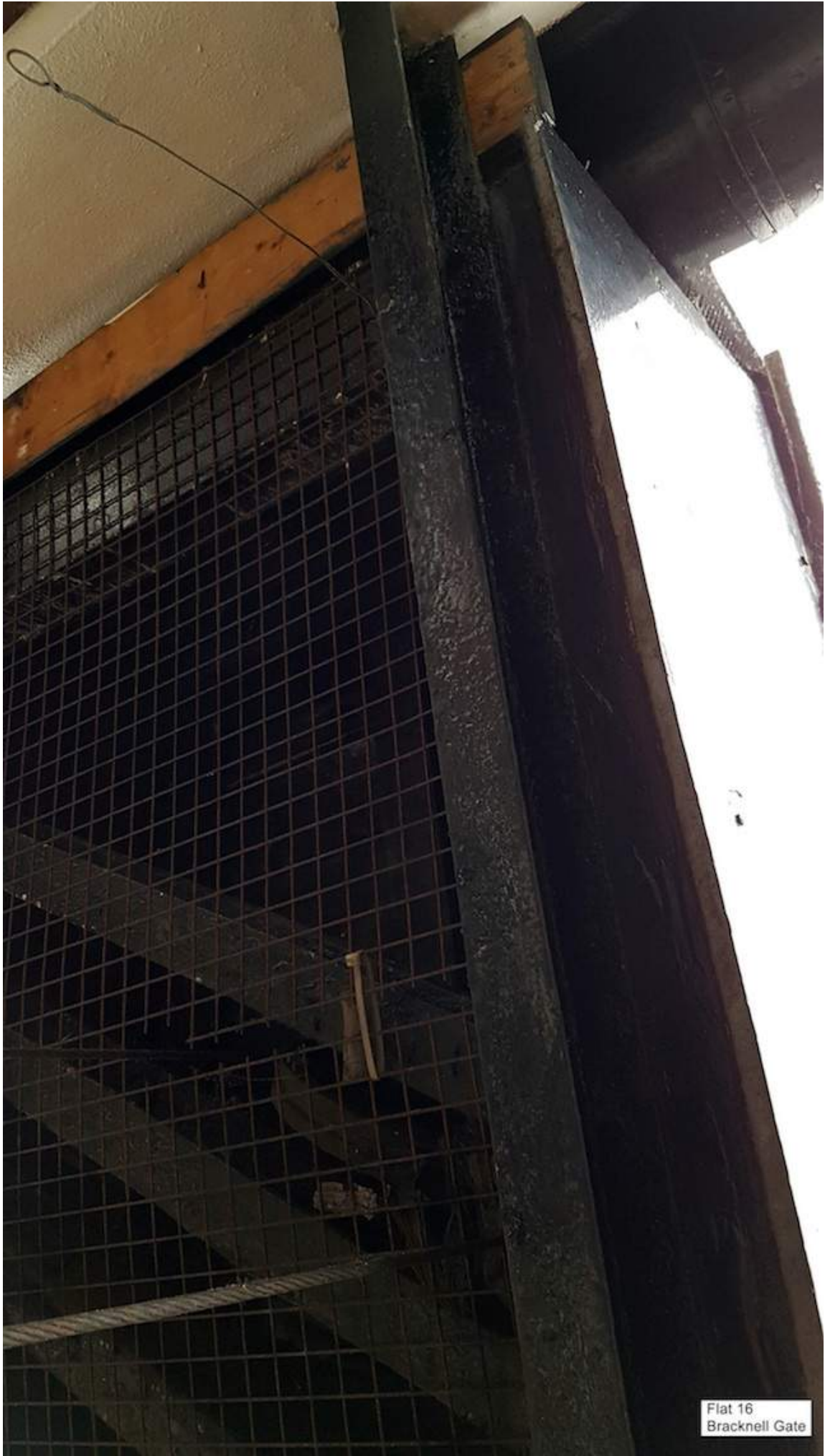
Flat 16 Bracknell Gate