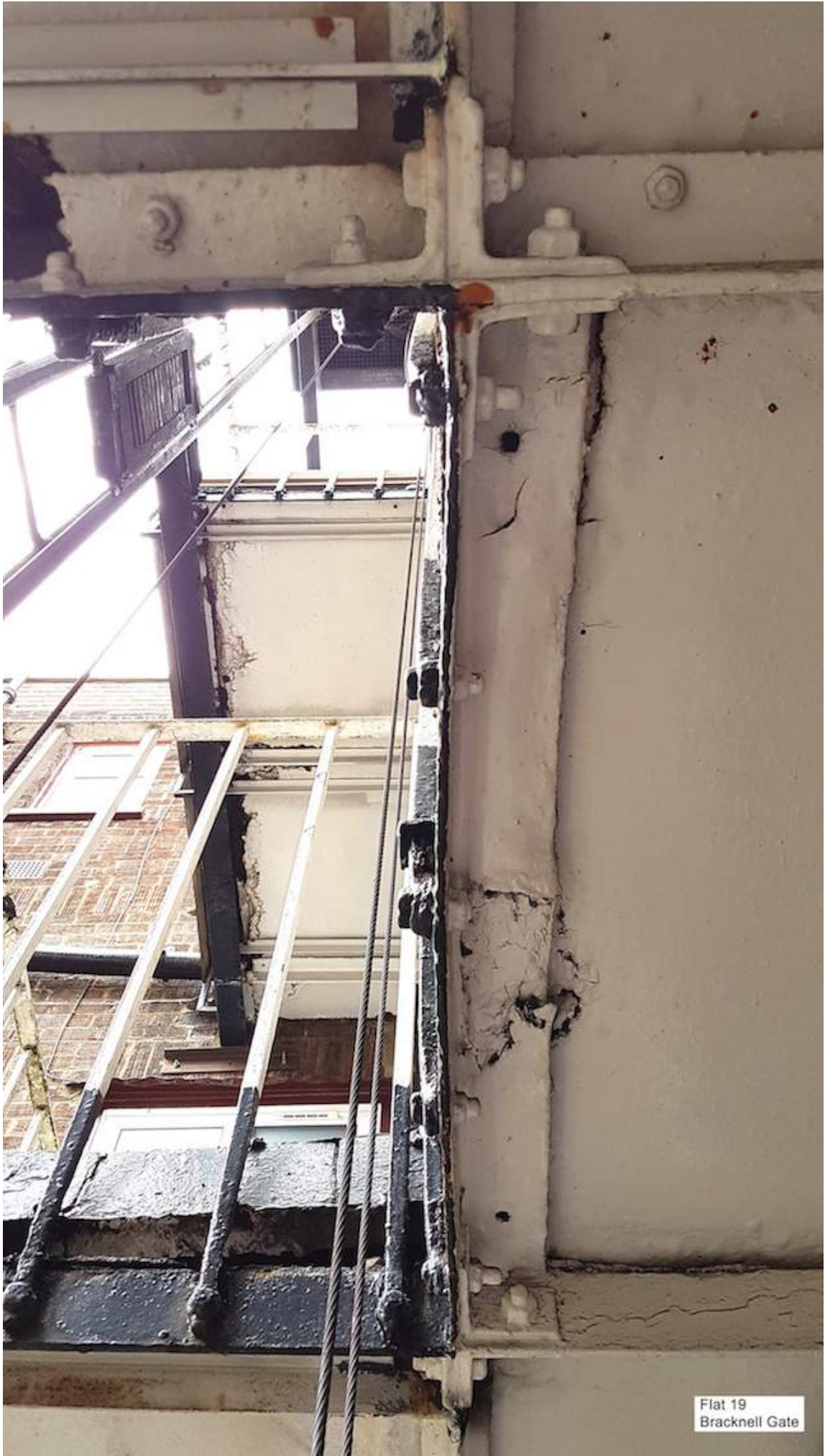
Flat 19 Bracknell Gate