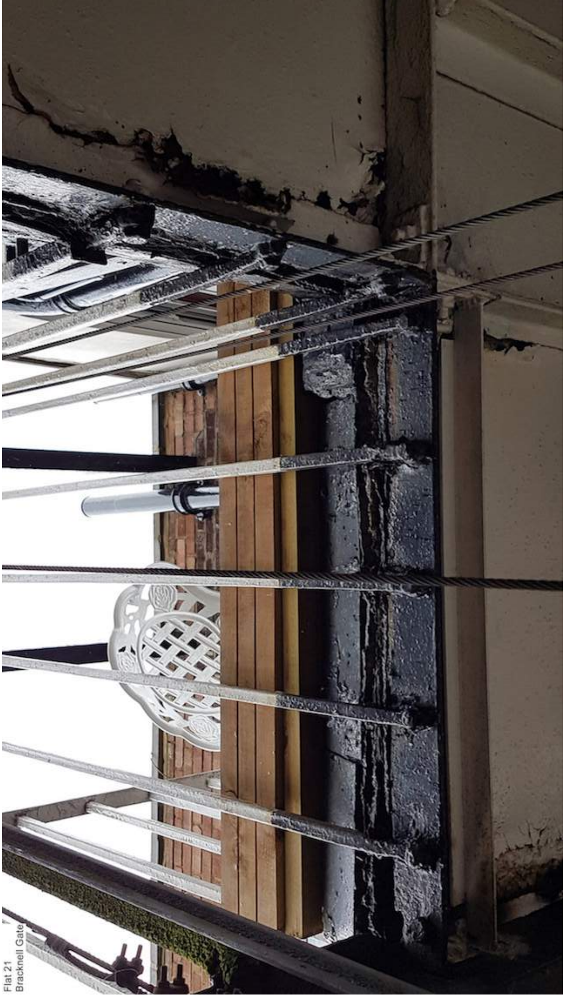
Flat 21 Bracknell Gate