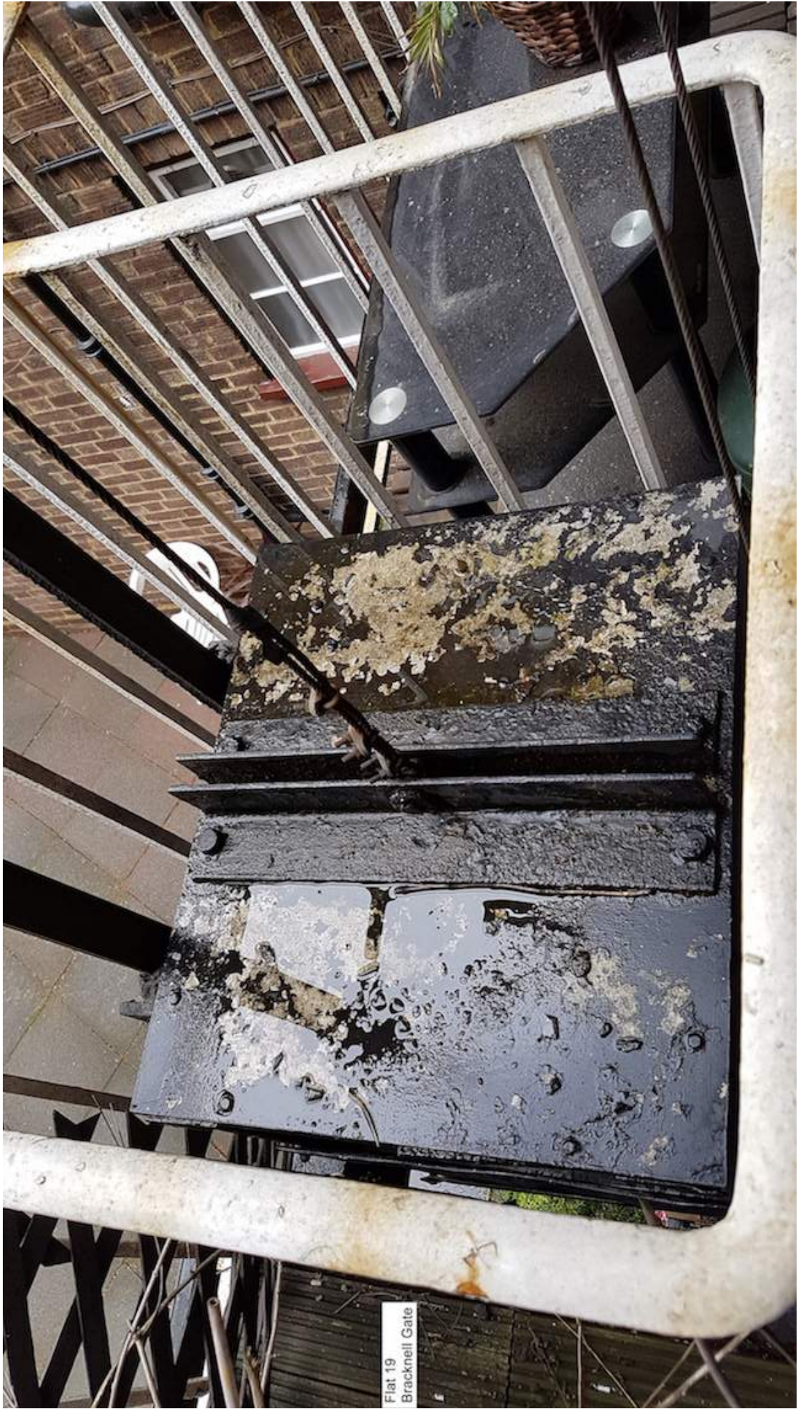
Flat 19 Bracknell Gate