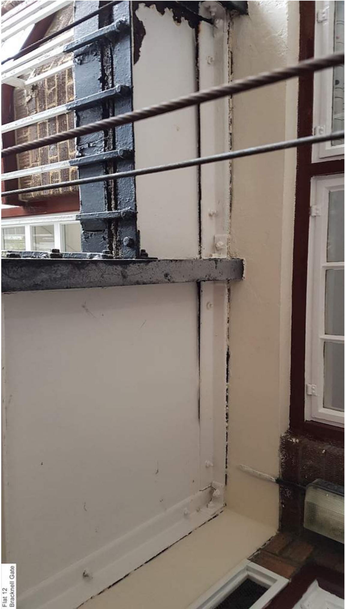
Flat 12 Bracknell Gate