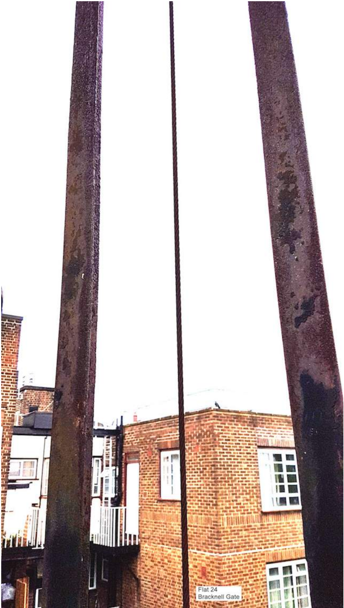
Flat 24 Bracknell Gate