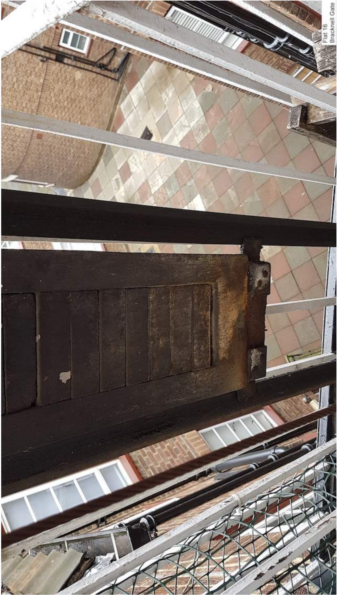
Flat 16 Bracknell Gate