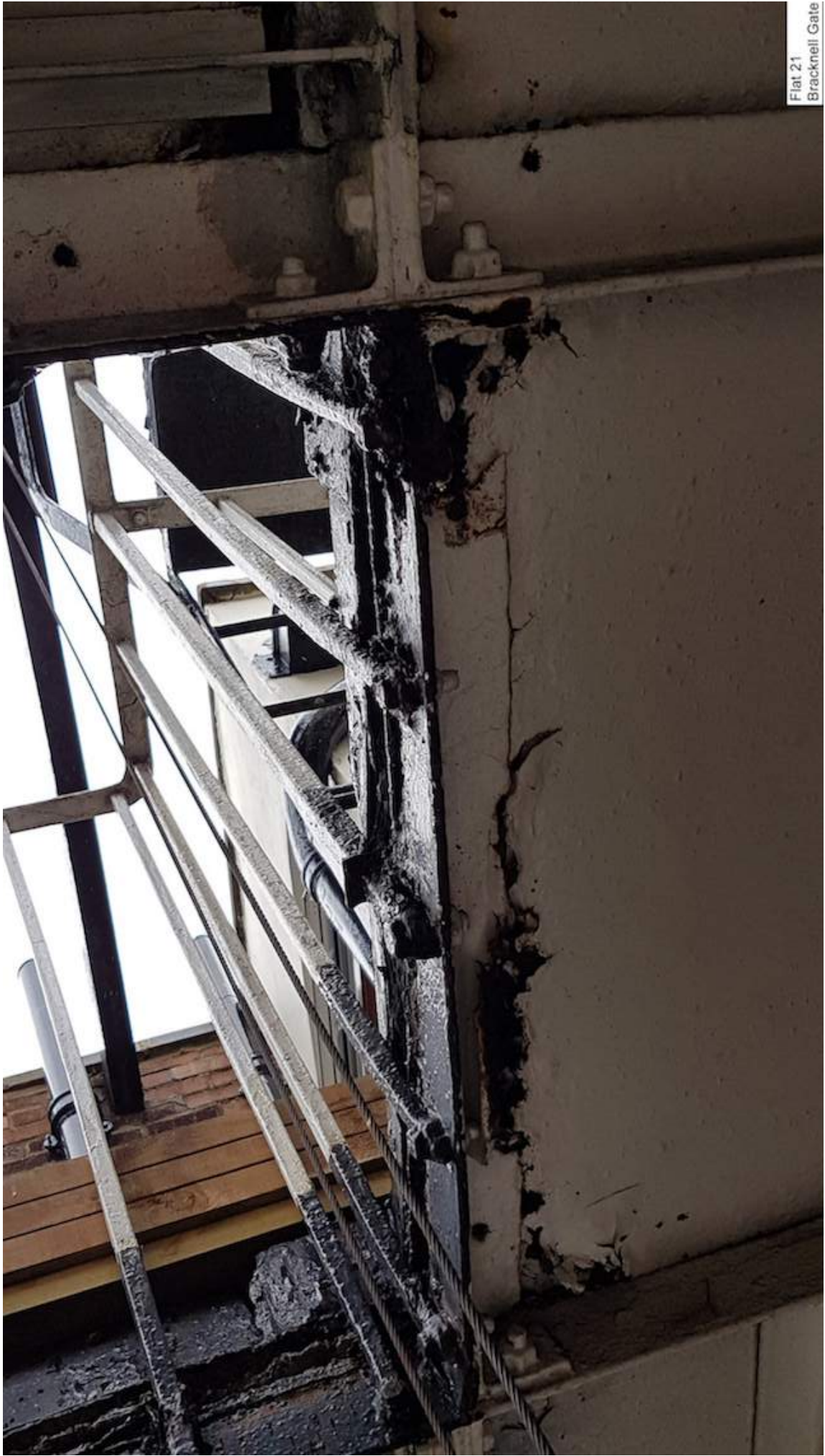
Flat 21 Bracknell Gate