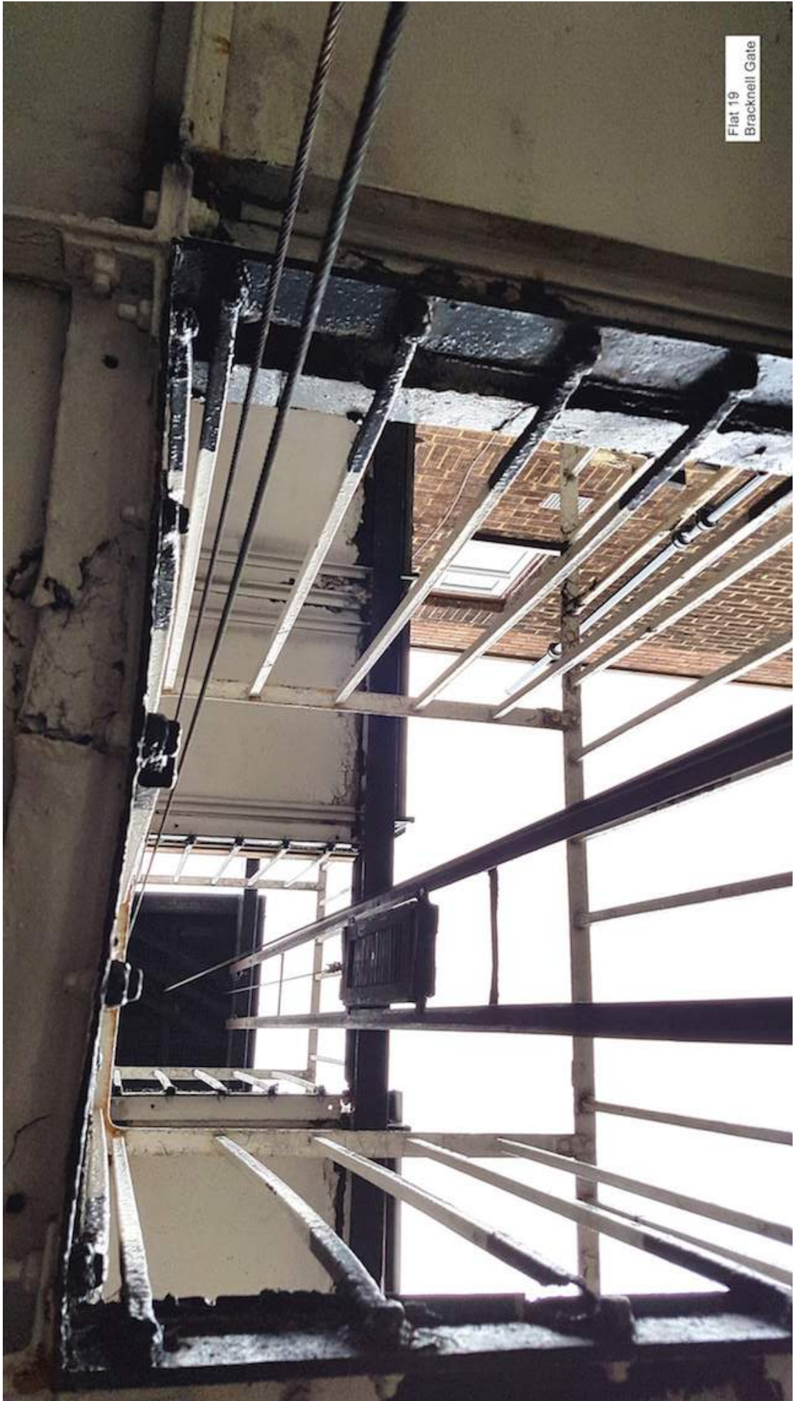
Flat 19 Bracknell Gate