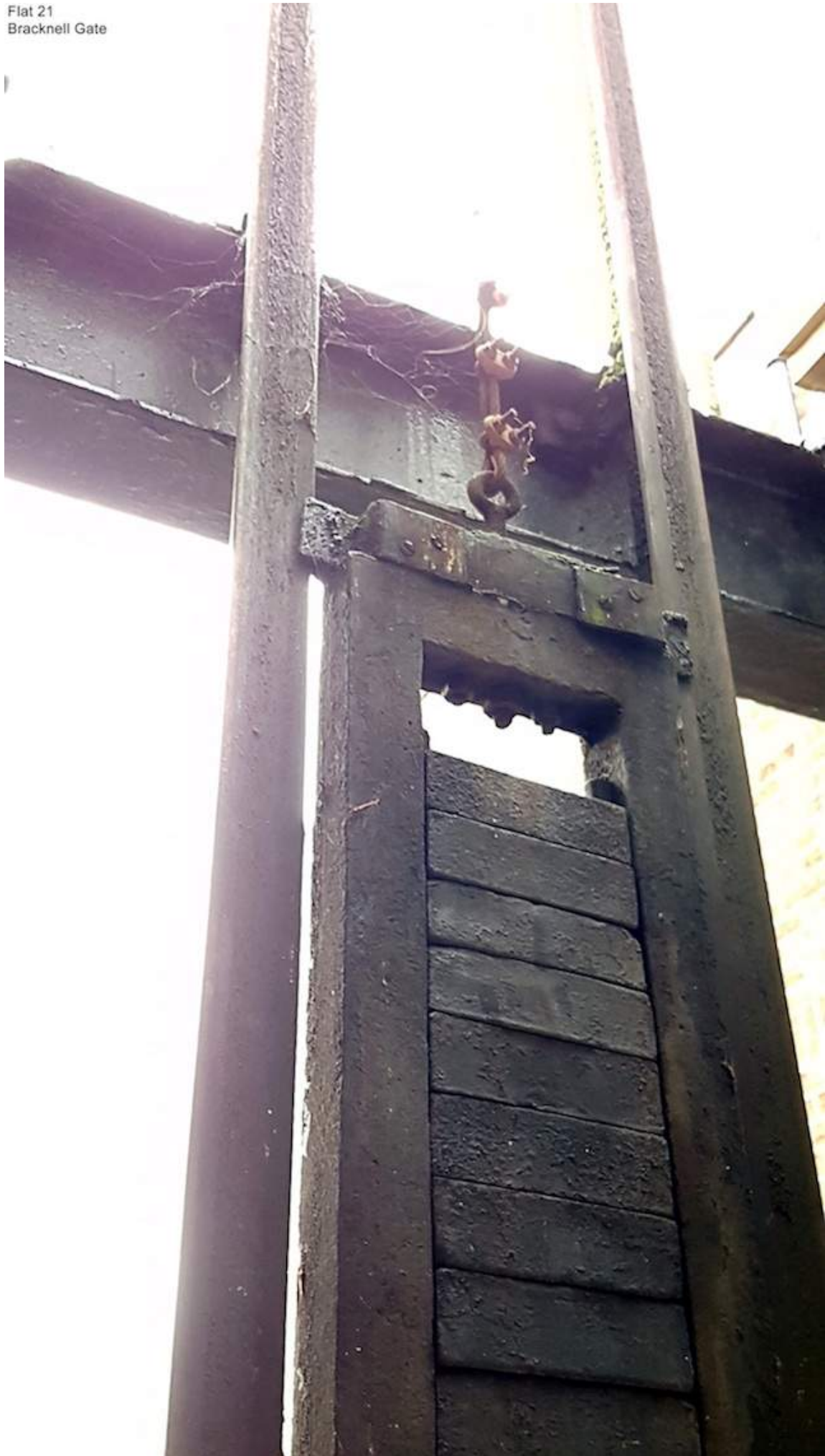
Flat 21 Bracknell Gate