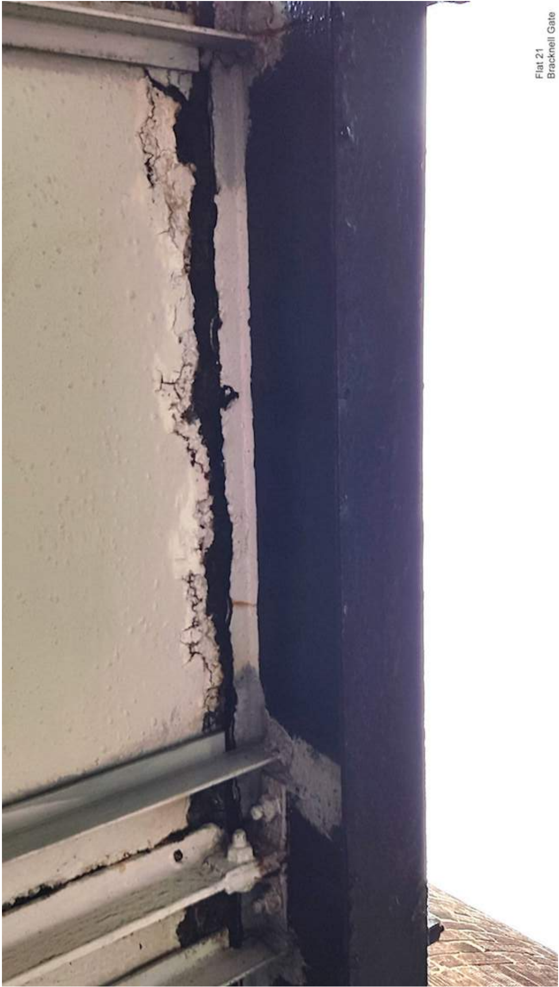
Flat 21 Bracknell Gate