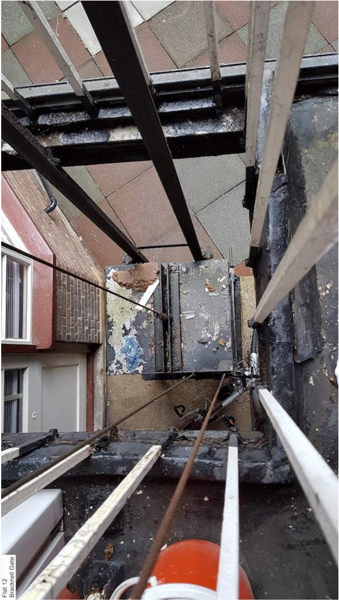
Flat 12 Bracknell Gate