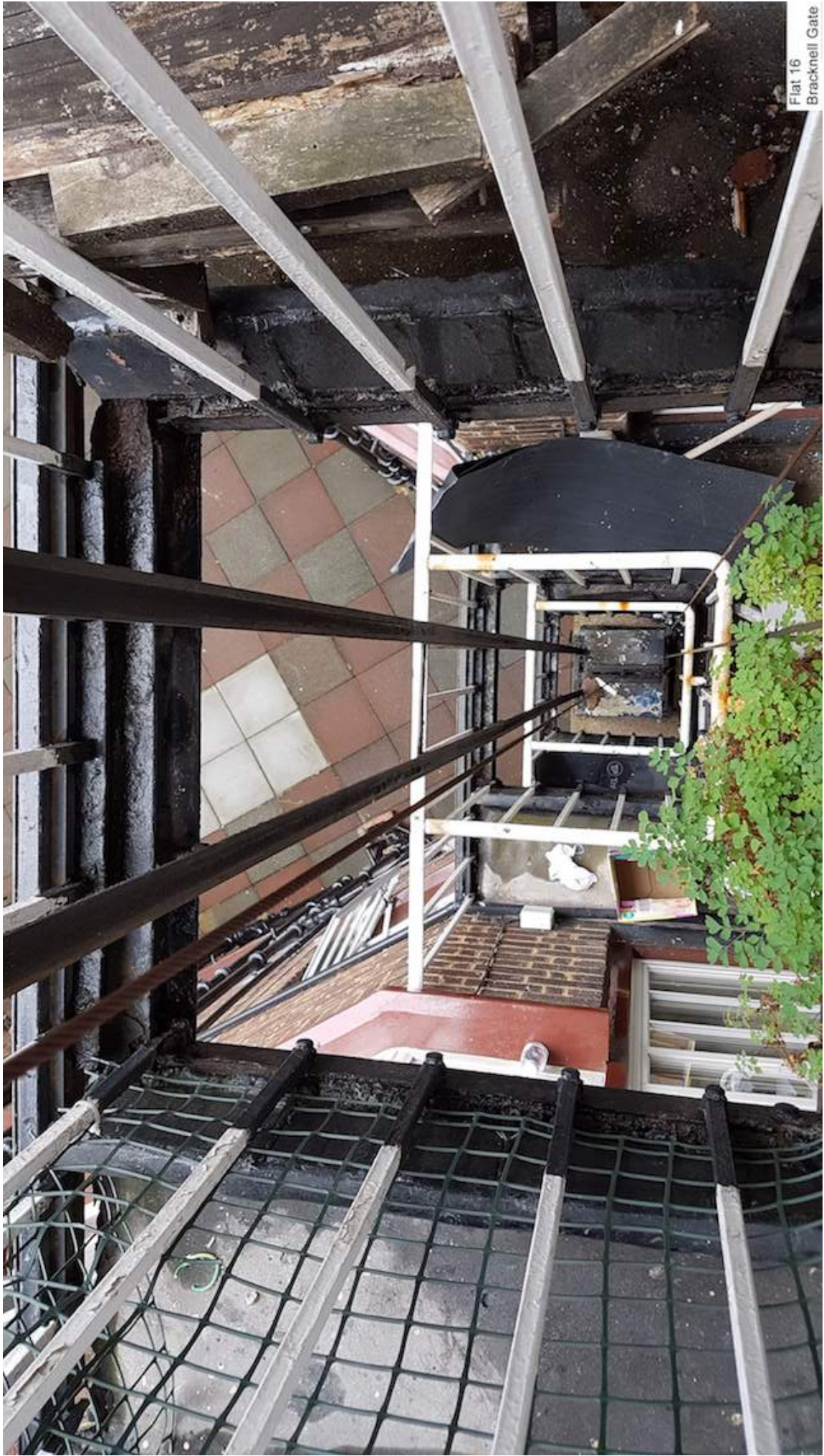
Flat 16 Bracknell Gate