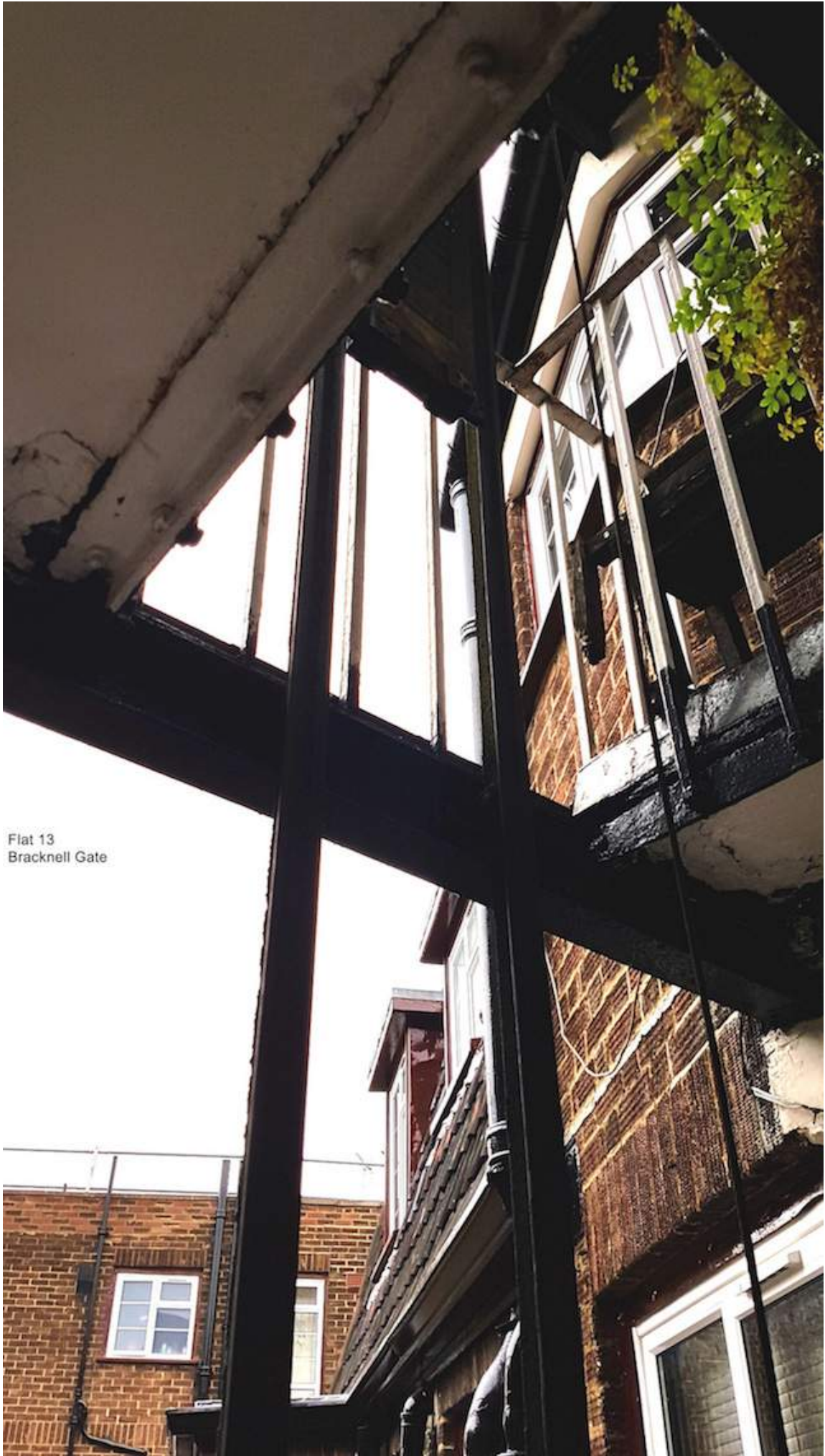
Flat 13 Bracknell Gate