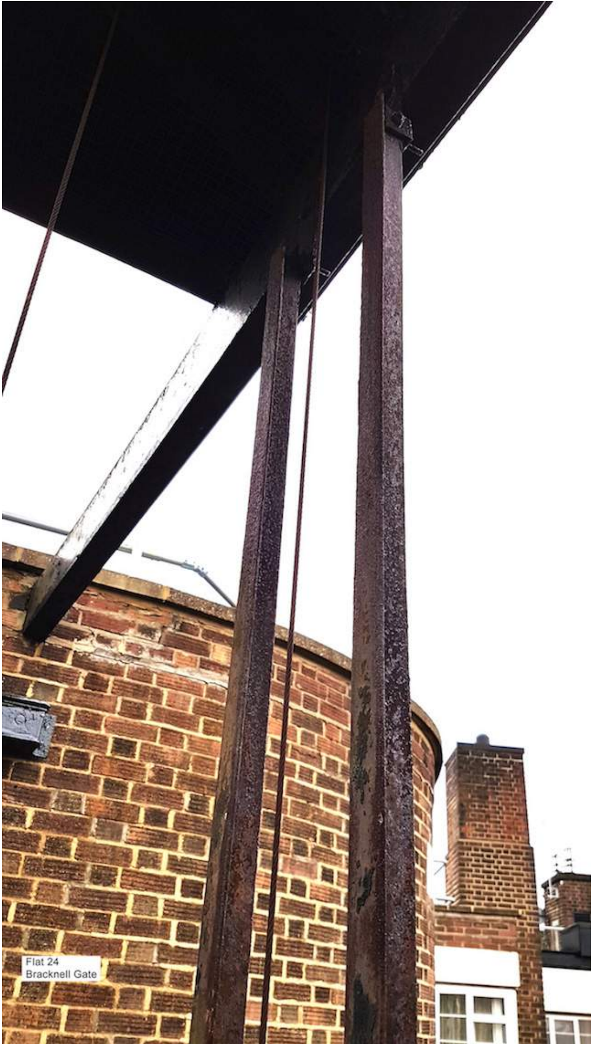
Flat 24 Bracknell Gate