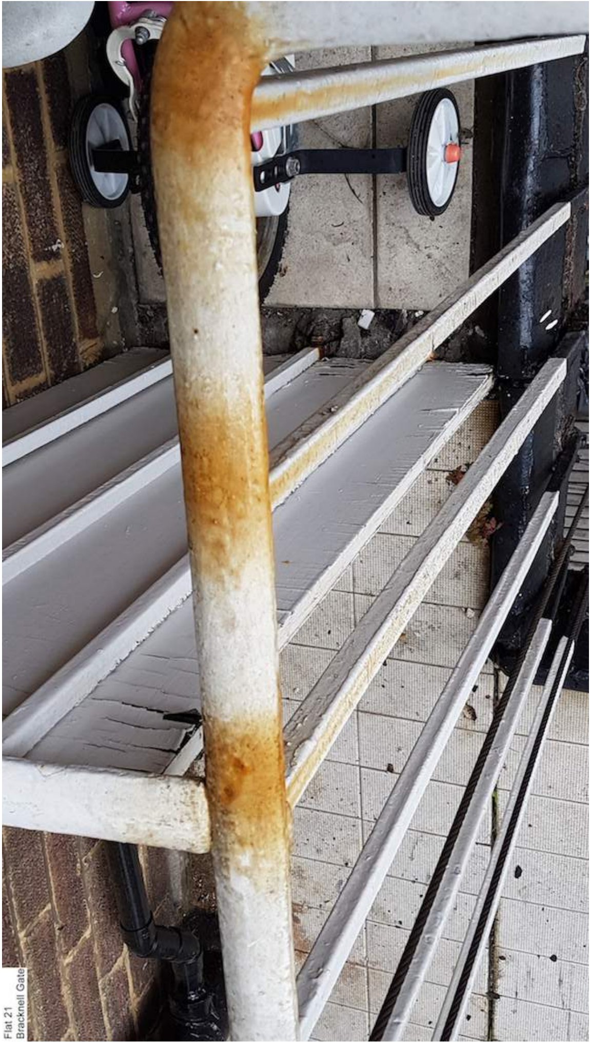
Flat 21 Bracknell Gate