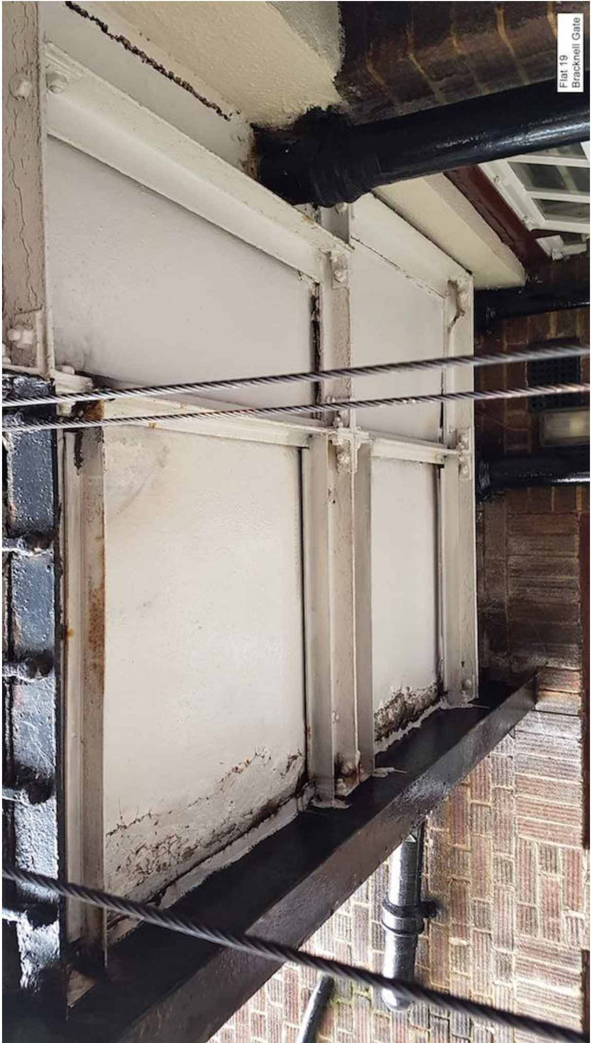
Flat 19 Bracknell Gate