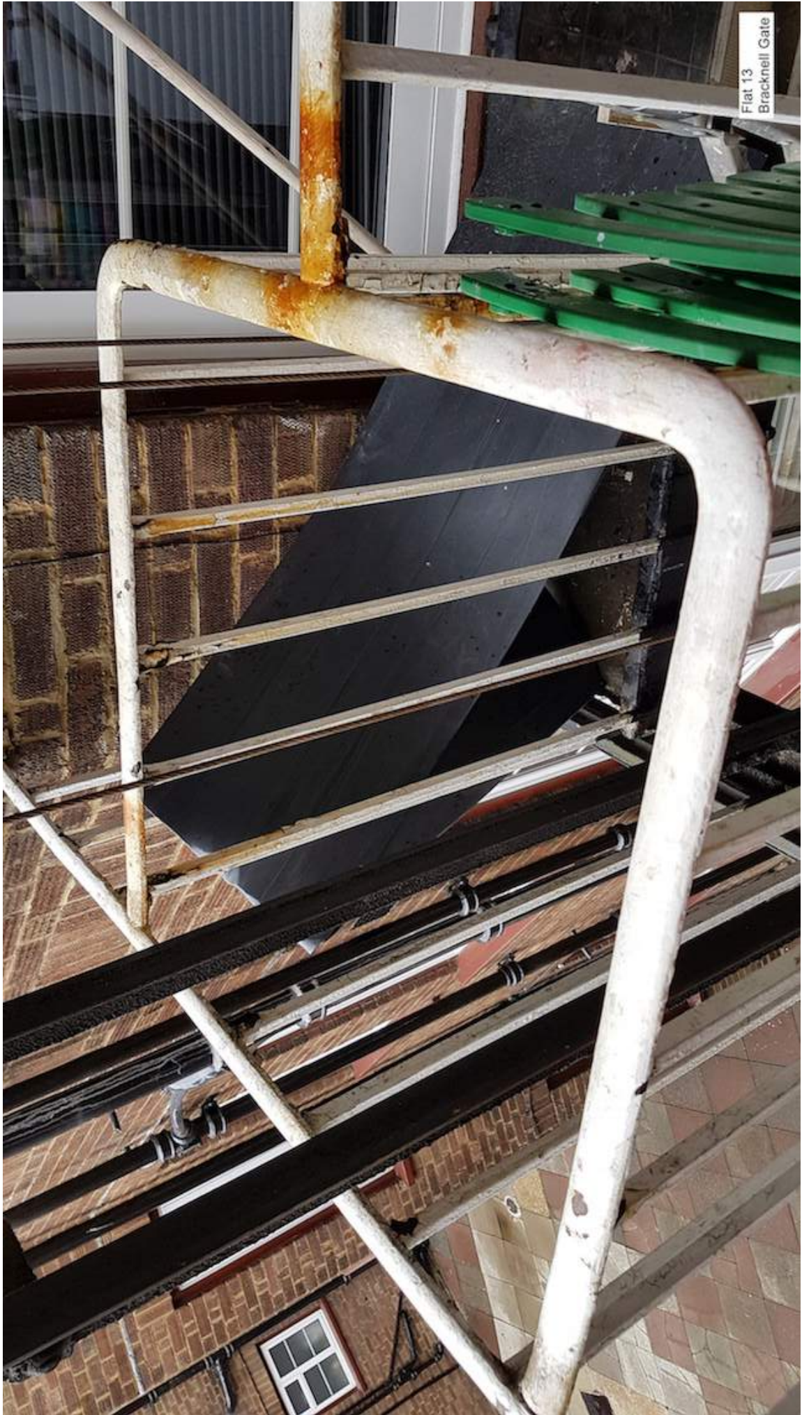
Flat 13 Bracknell Gate