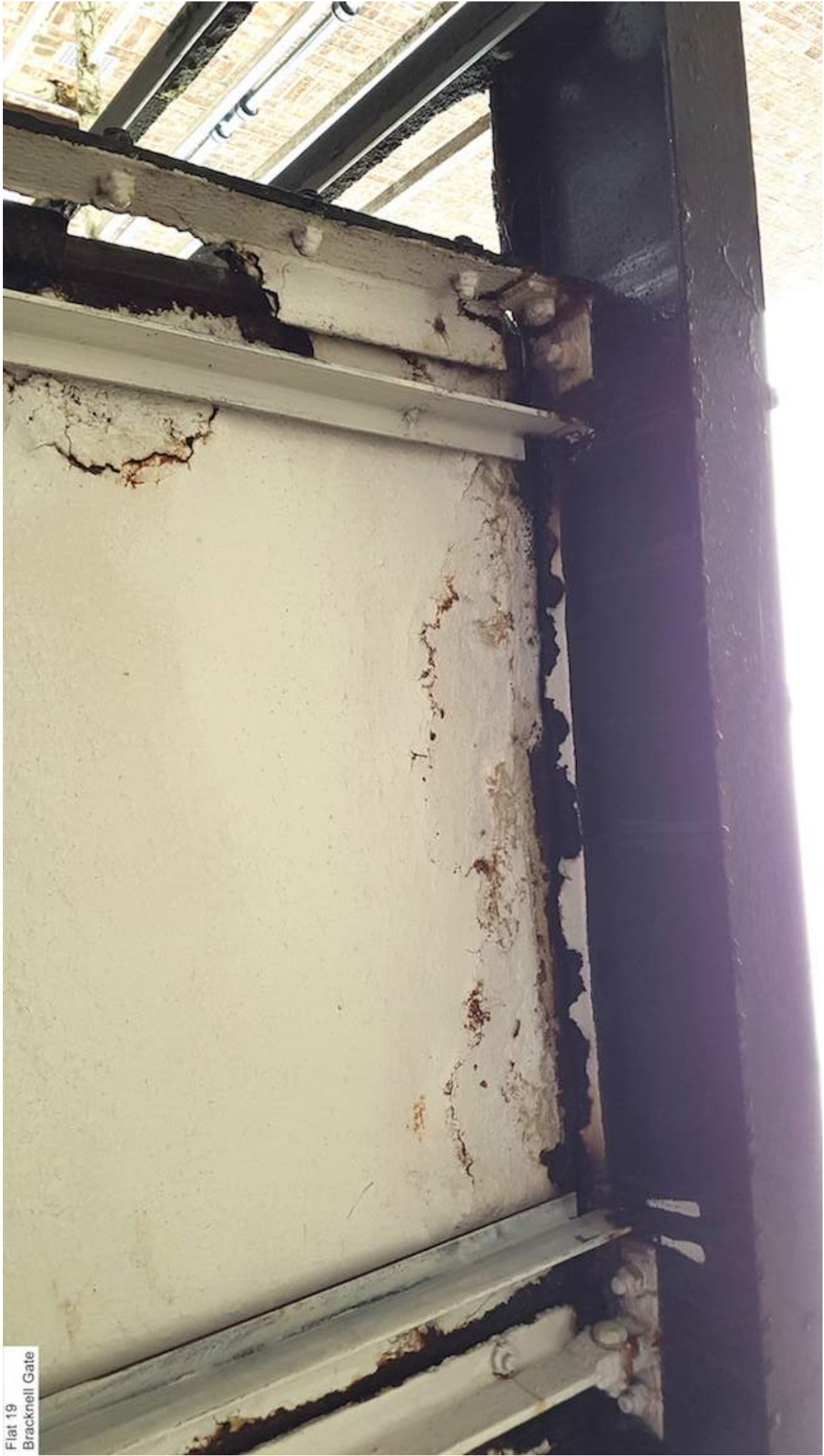
Flat 19 Bracknell Gate