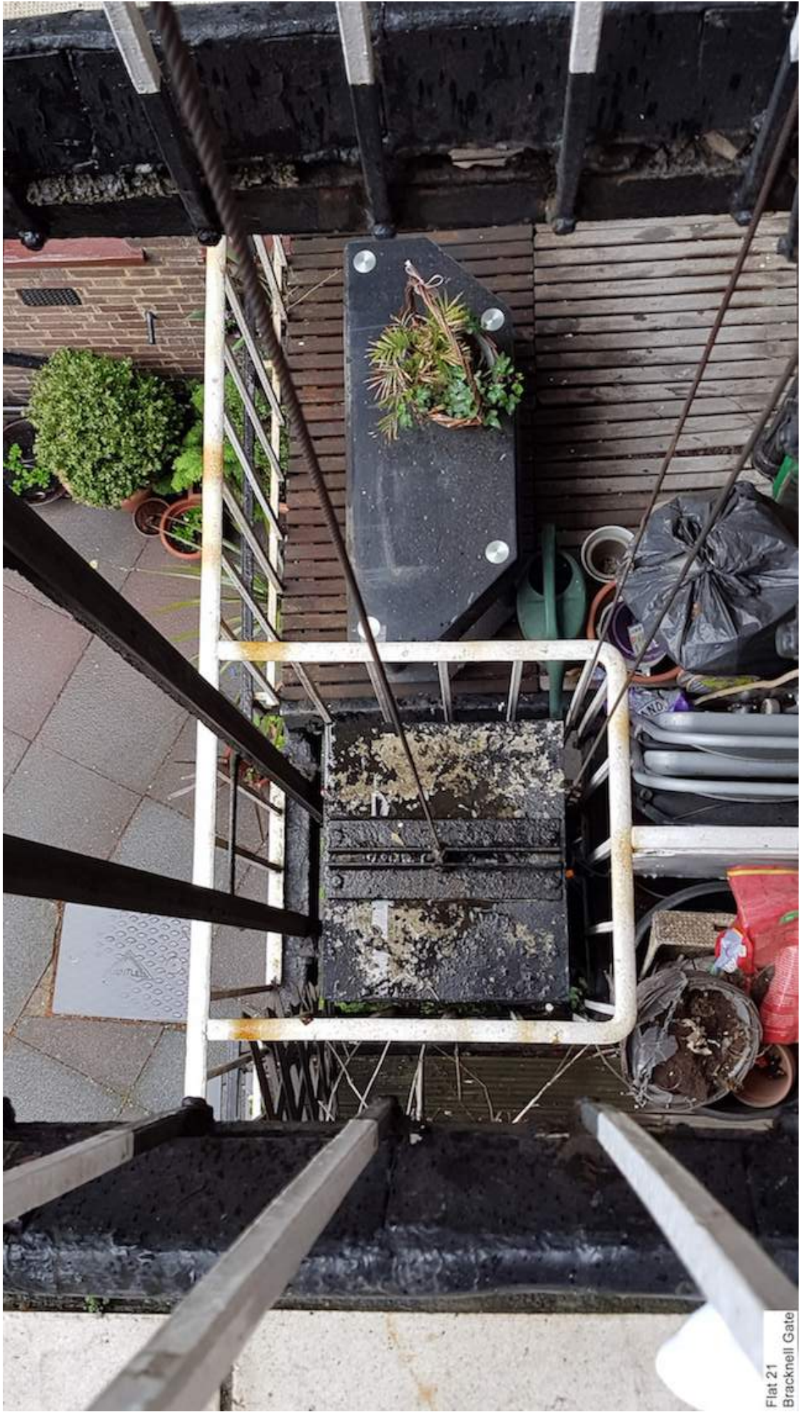
Flat 21 Bracknell Gate