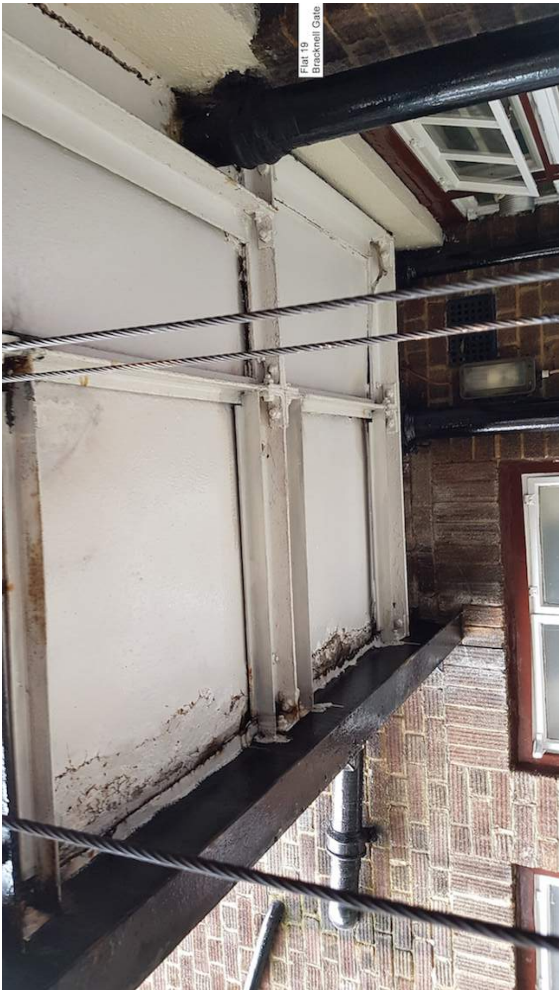
Flat 19 Bracknell Gate