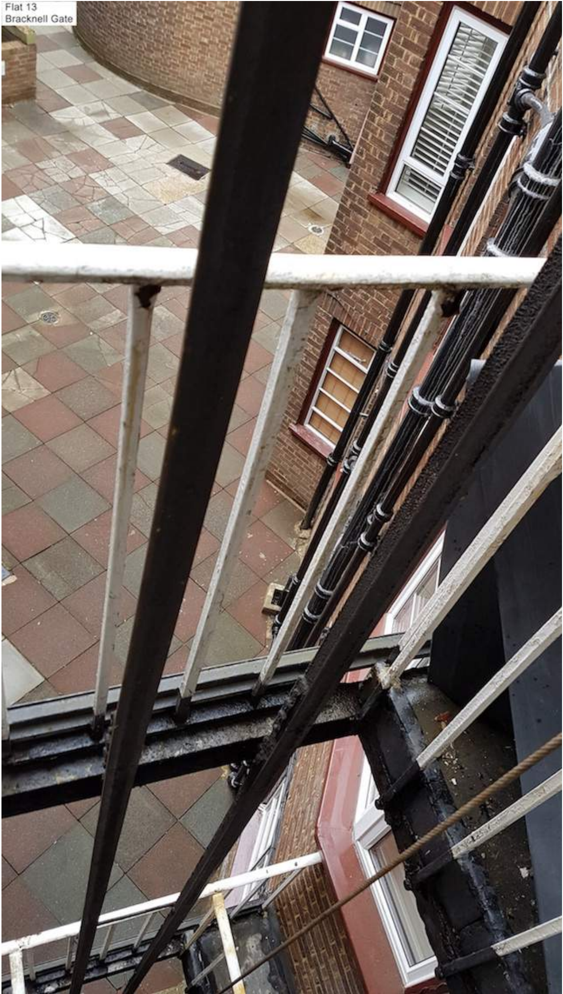
Flat 13 Bracknell Gate