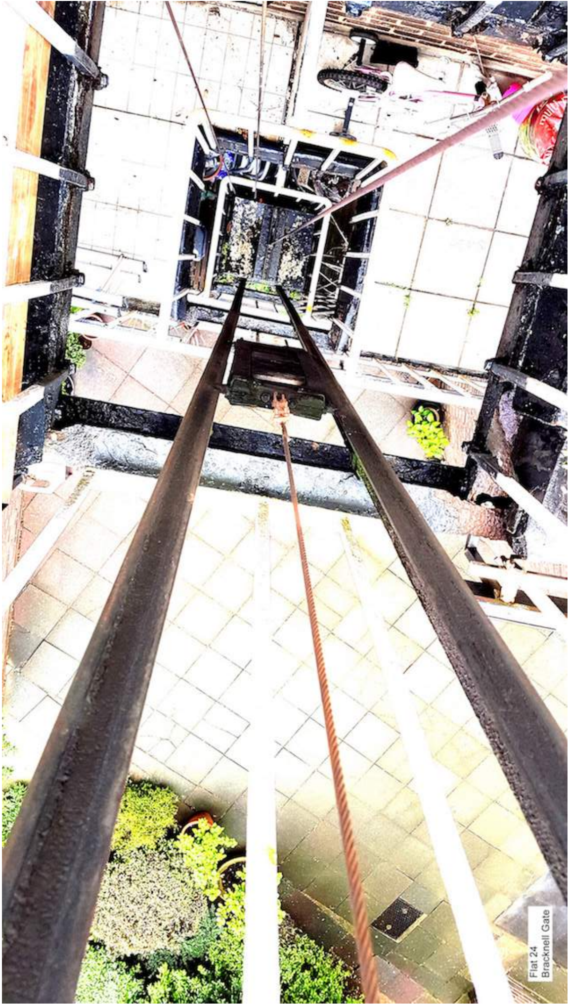
Flat 24 Bracknell Gate