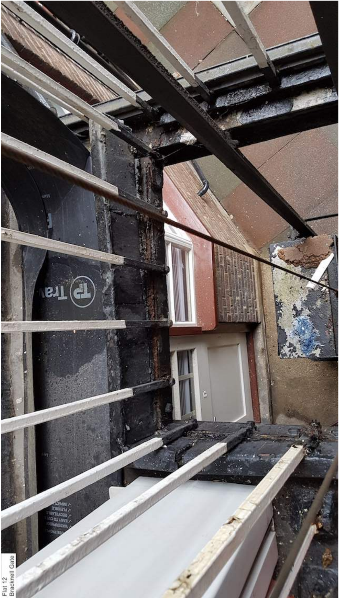
Flat 12 Bracknell Gate

USE PROTECTIVE SHEETING WATERPROOF READY TO OIL RECYCLABLE REMOVABLE IMPACT