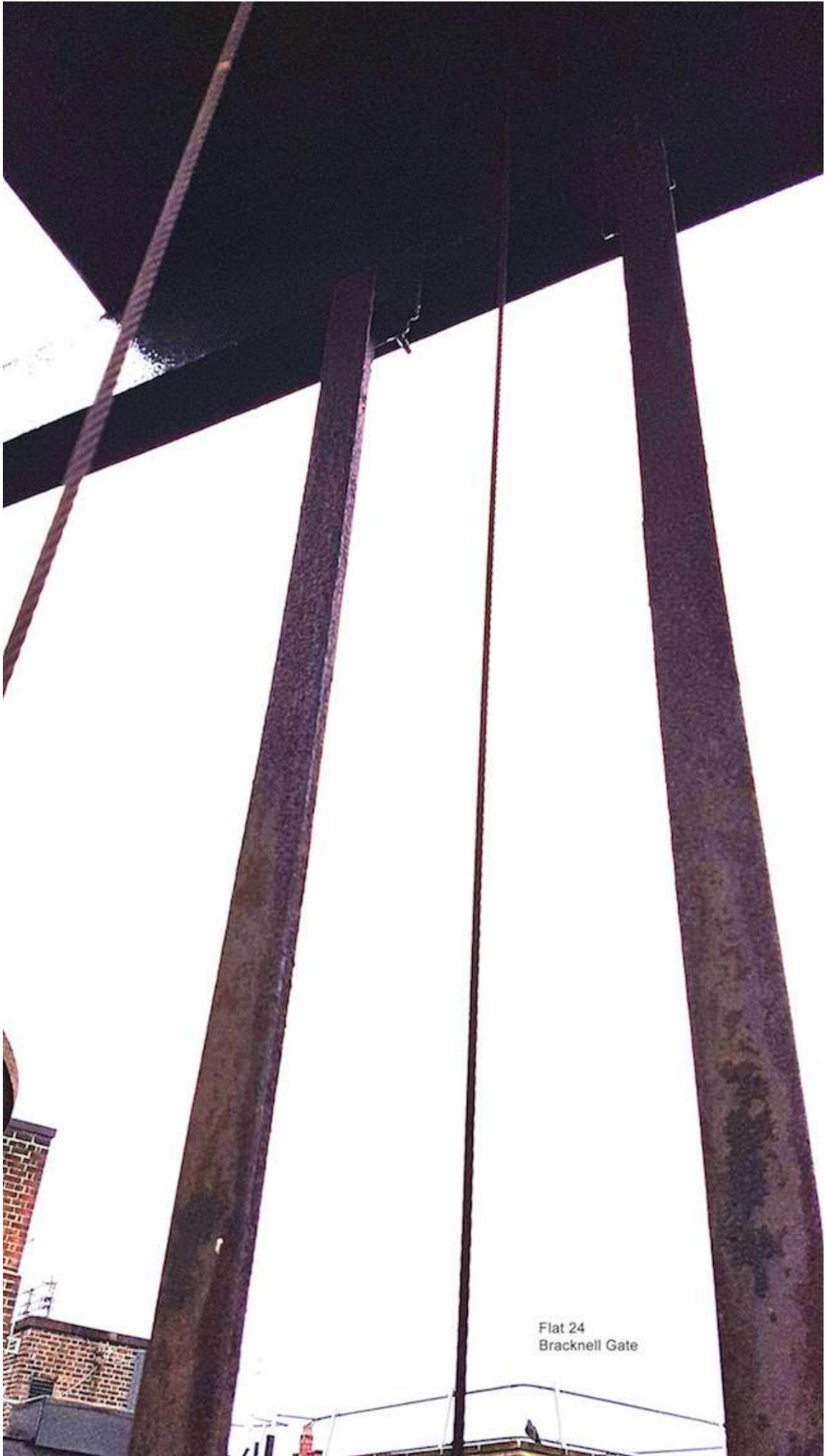
Flat 24 Bracknell Gate