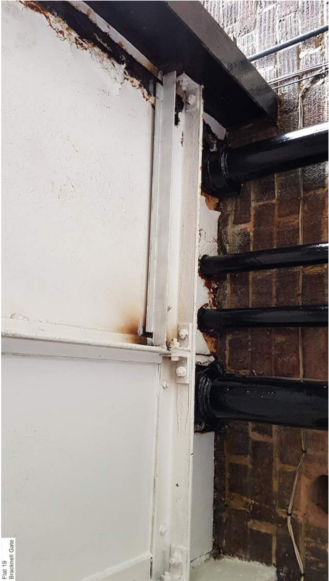
Flat 19 Bracknell Gate