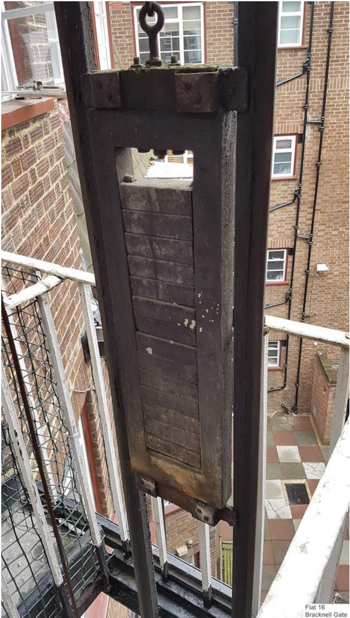
Flat 16 Bracknell Gate