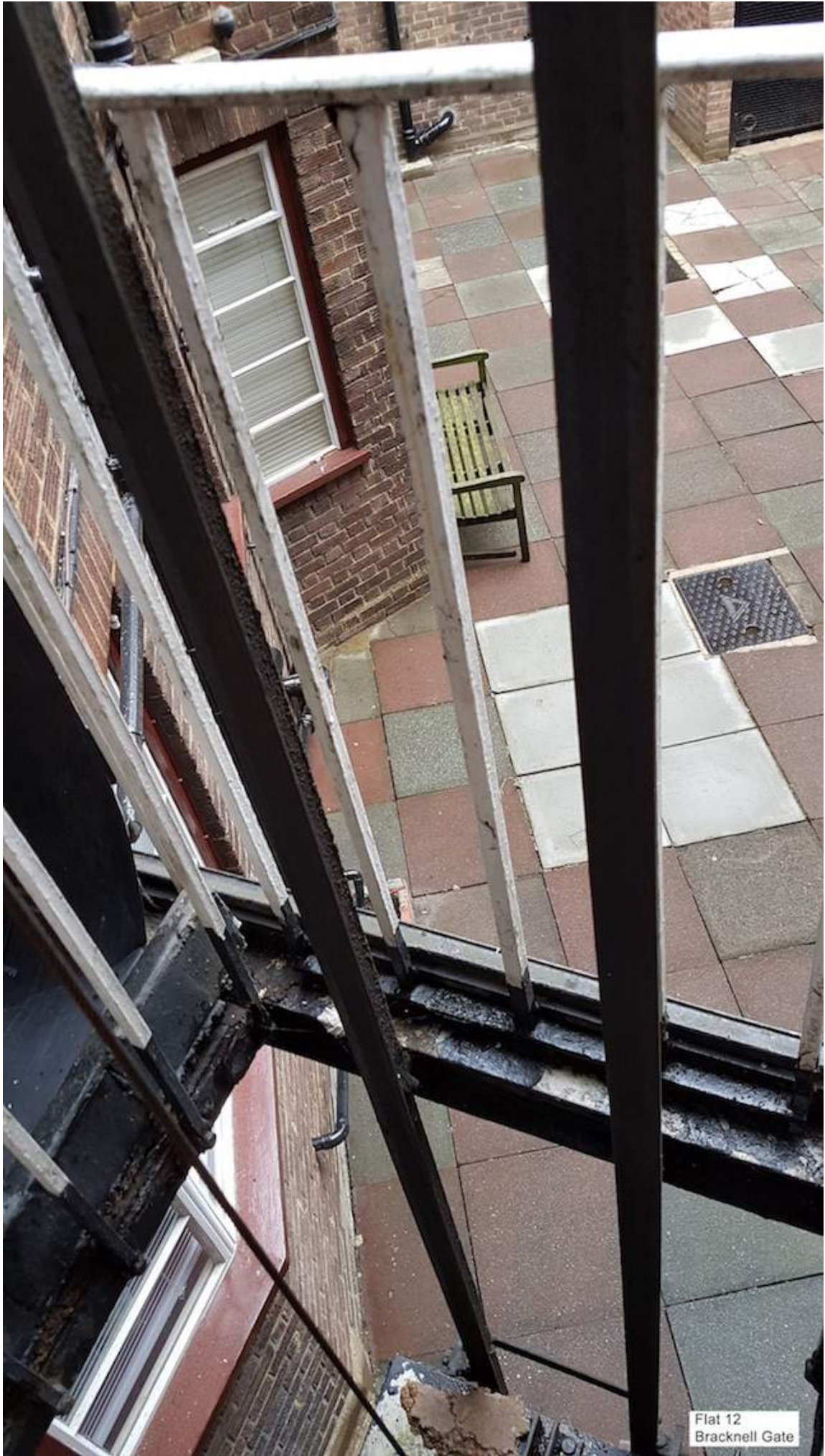
Flat 12 Bracknell Gate