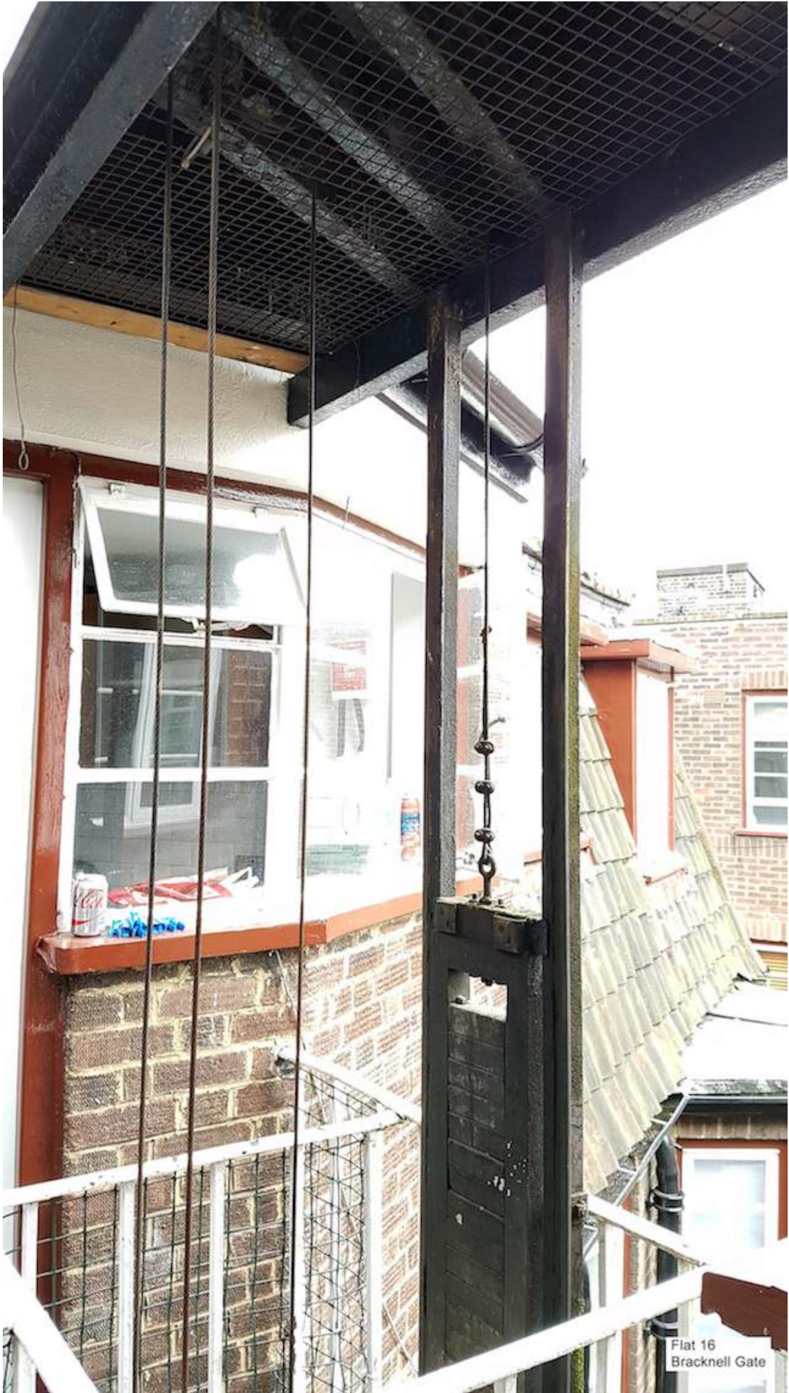
Flat 16 Bracknell Gate