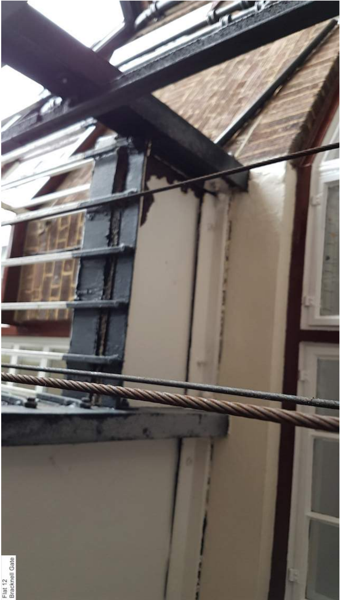
Flat 12 Bracknell Gate