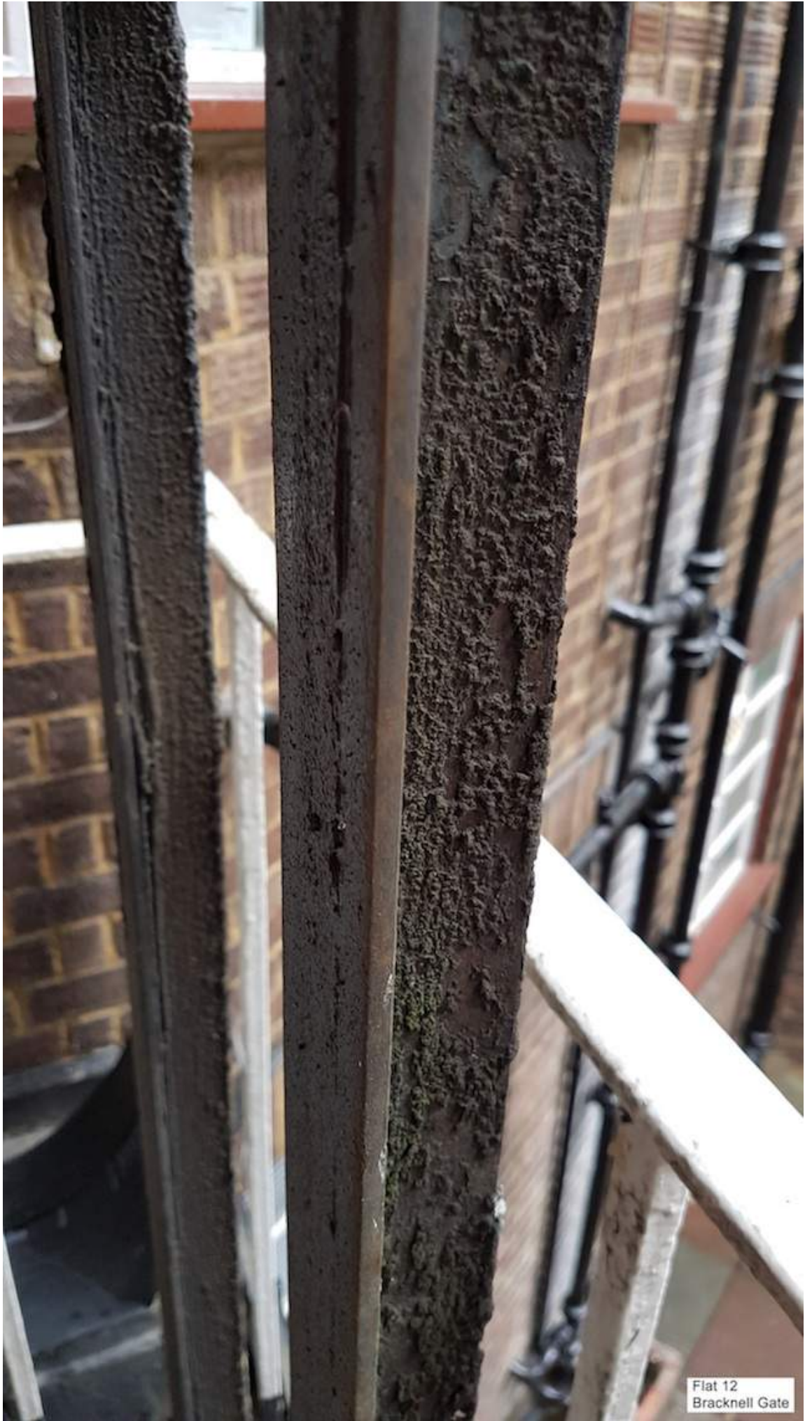
Flat 12 Bracknell Gate