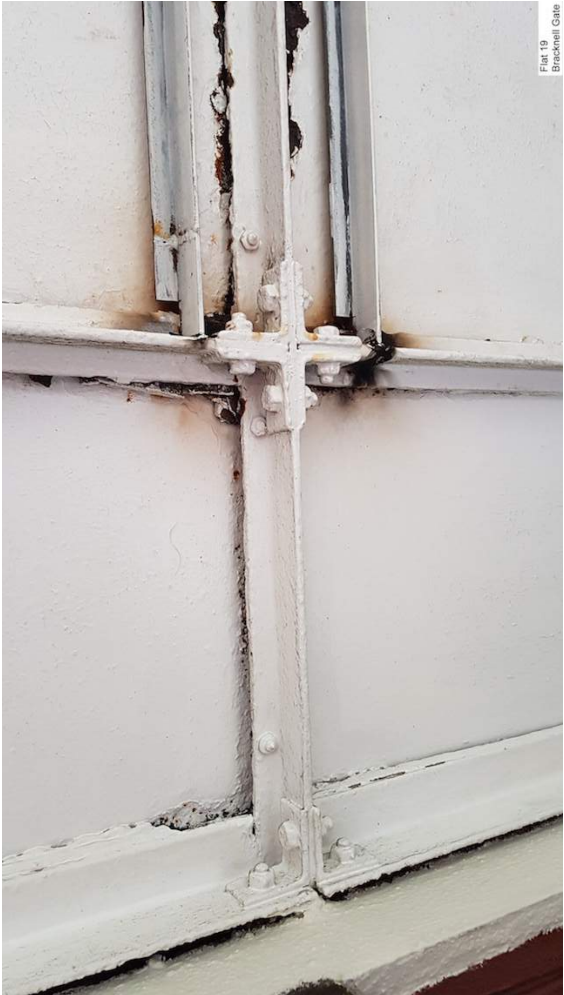
Flat 19 Bracknell Gate