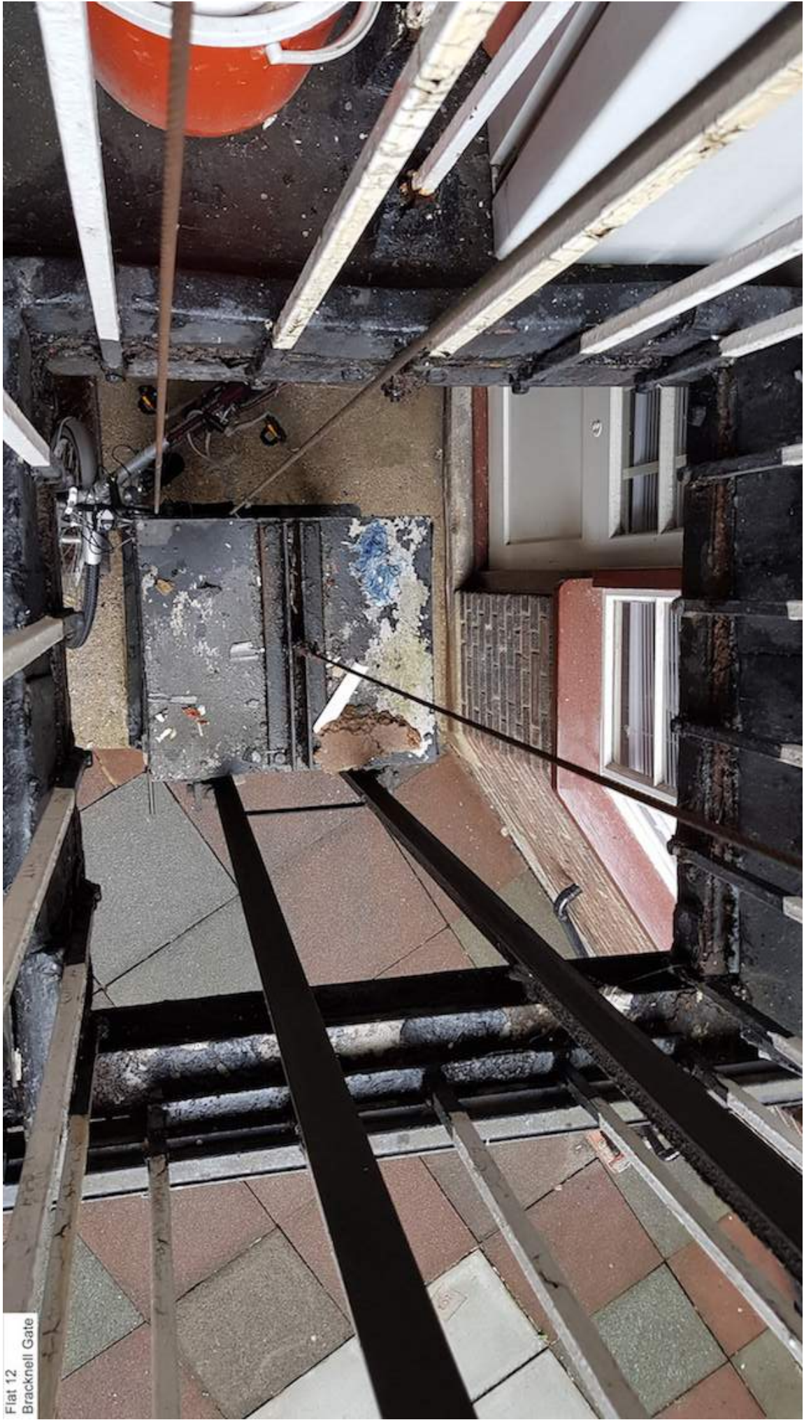
Flat 12 Bracknell Gate