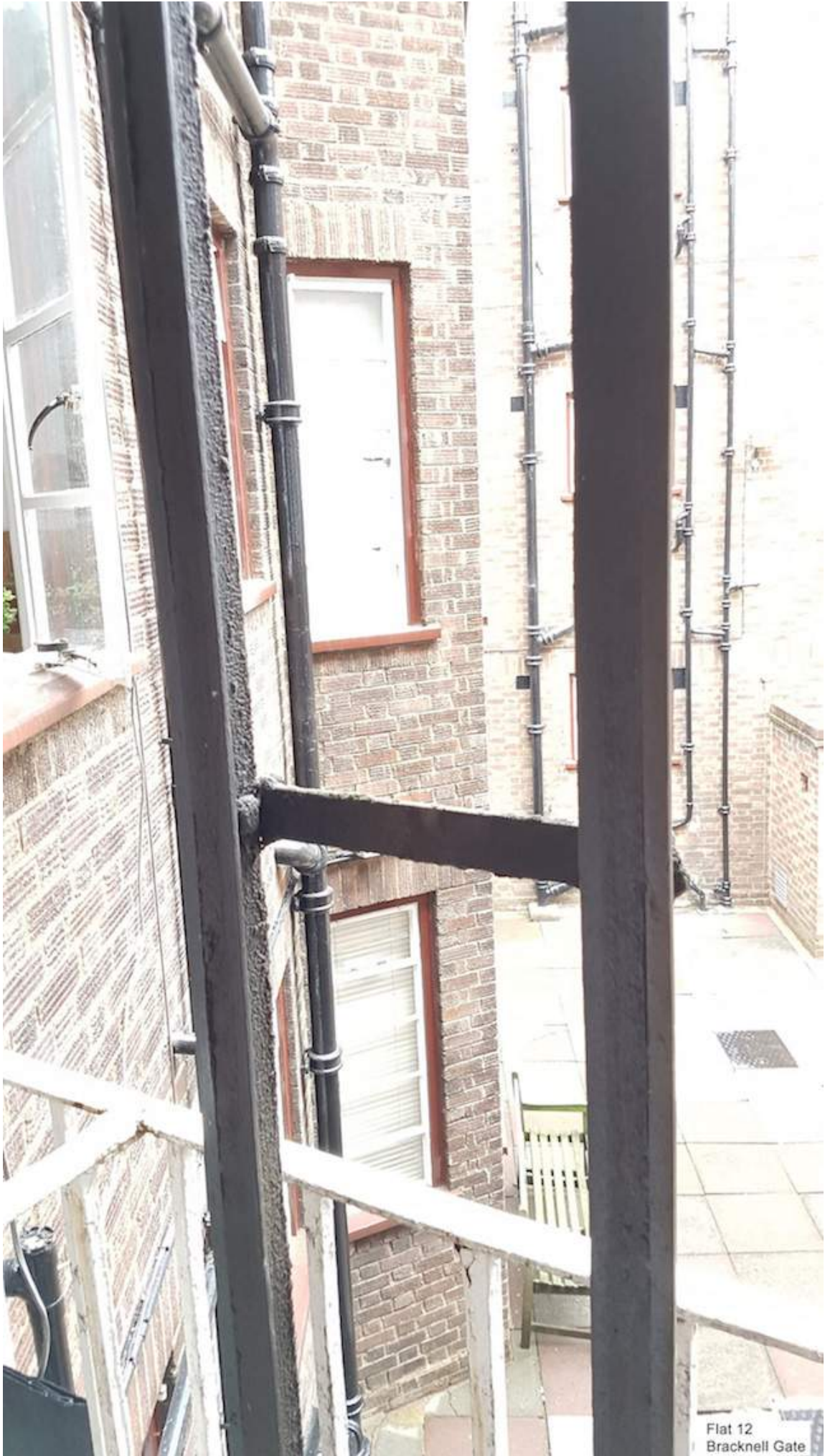
Flat 12 Bracknell Gate