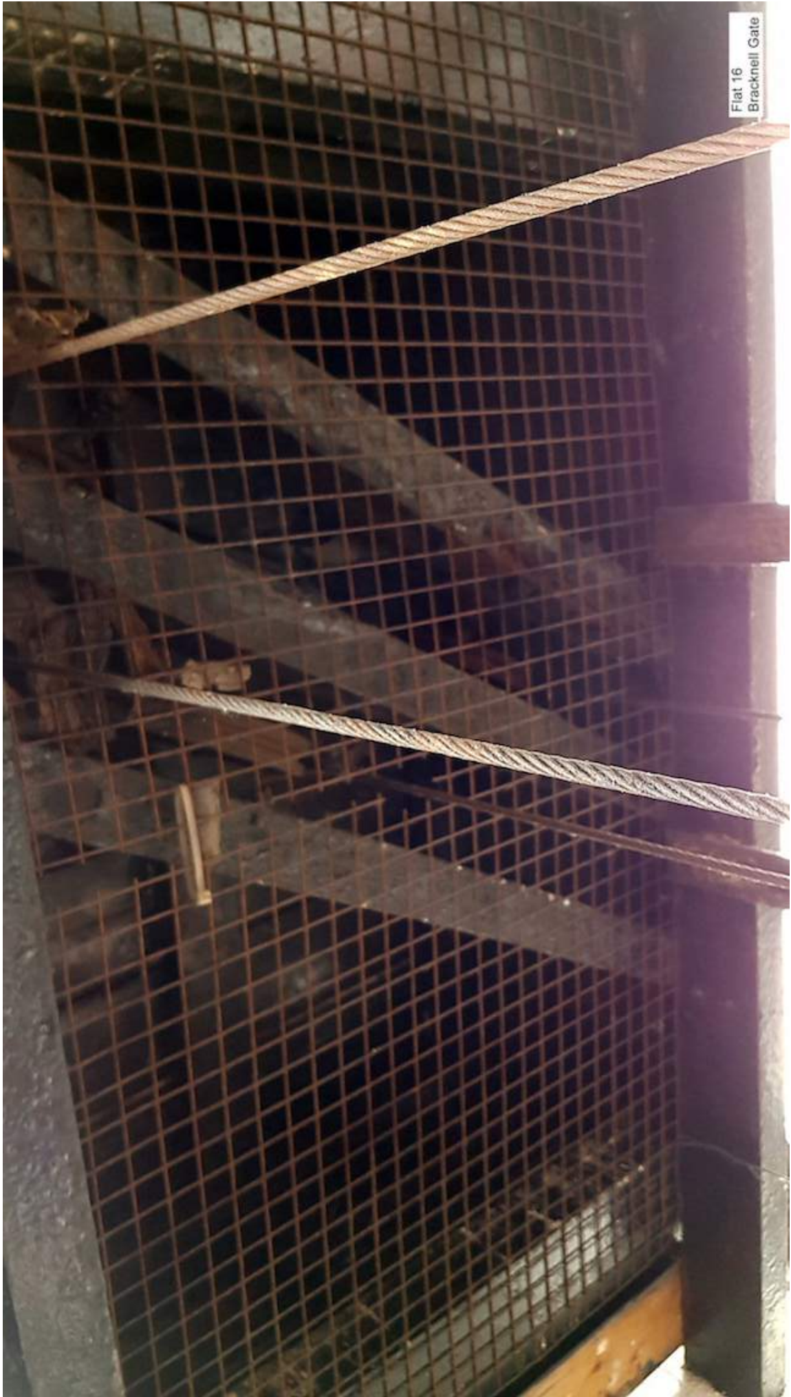
Flat 16 Bracknell Gate