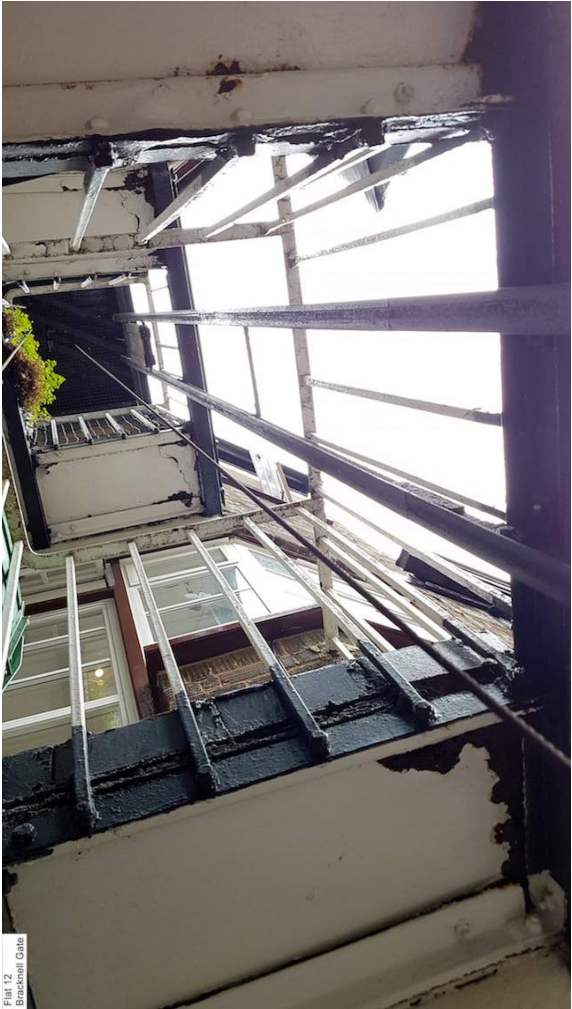
Flat 12 Bracknell Gate