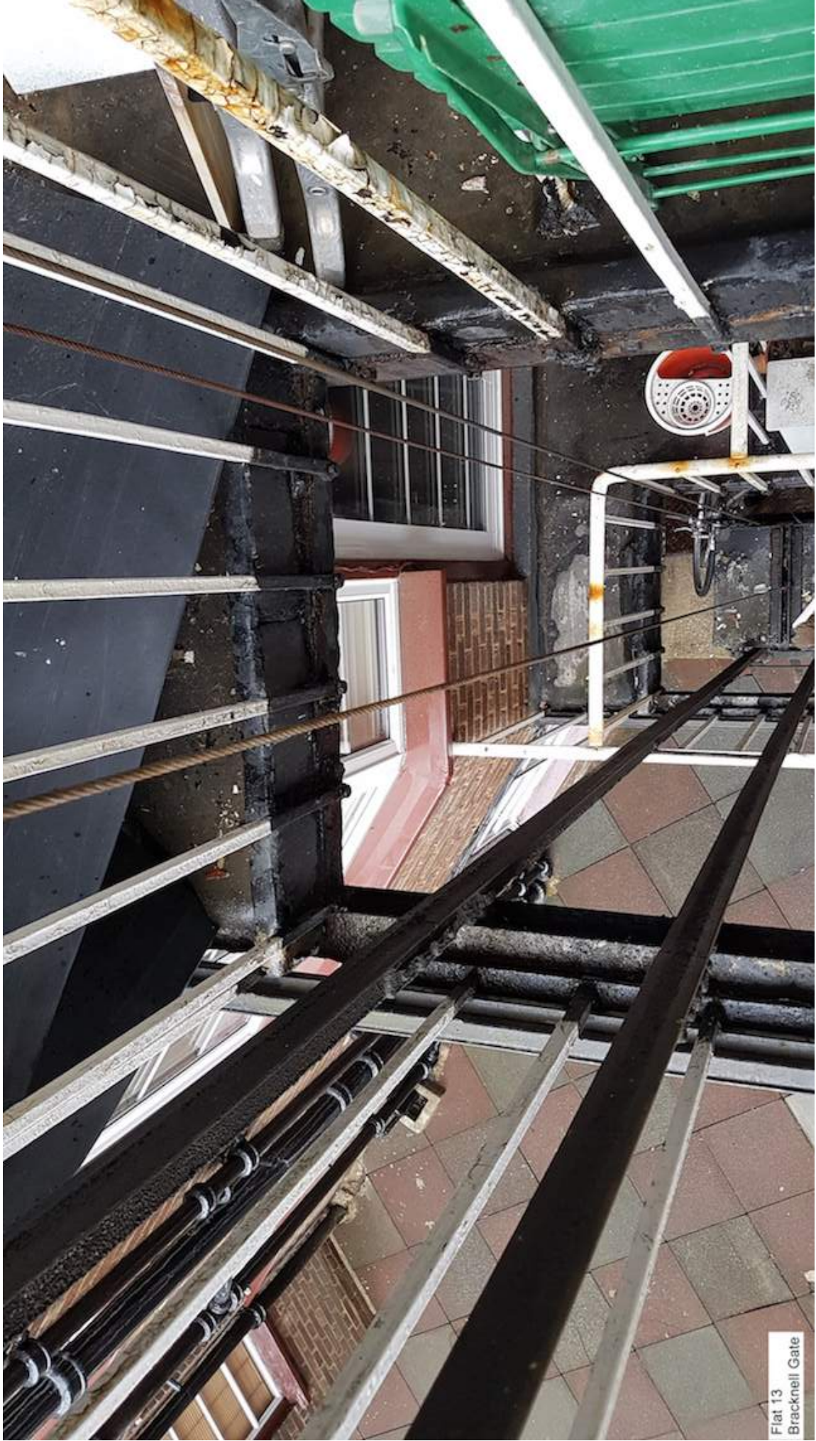
Flat 13 Bracknell Gate