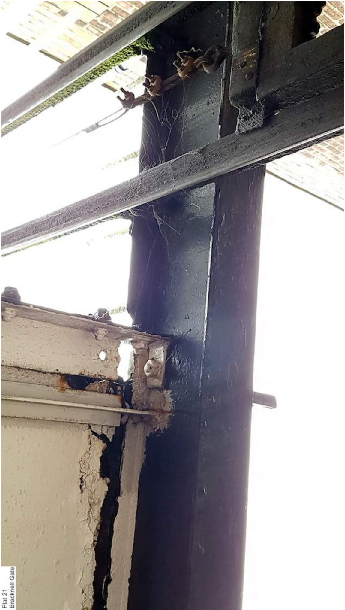
Flat 21 Bracknell Gate