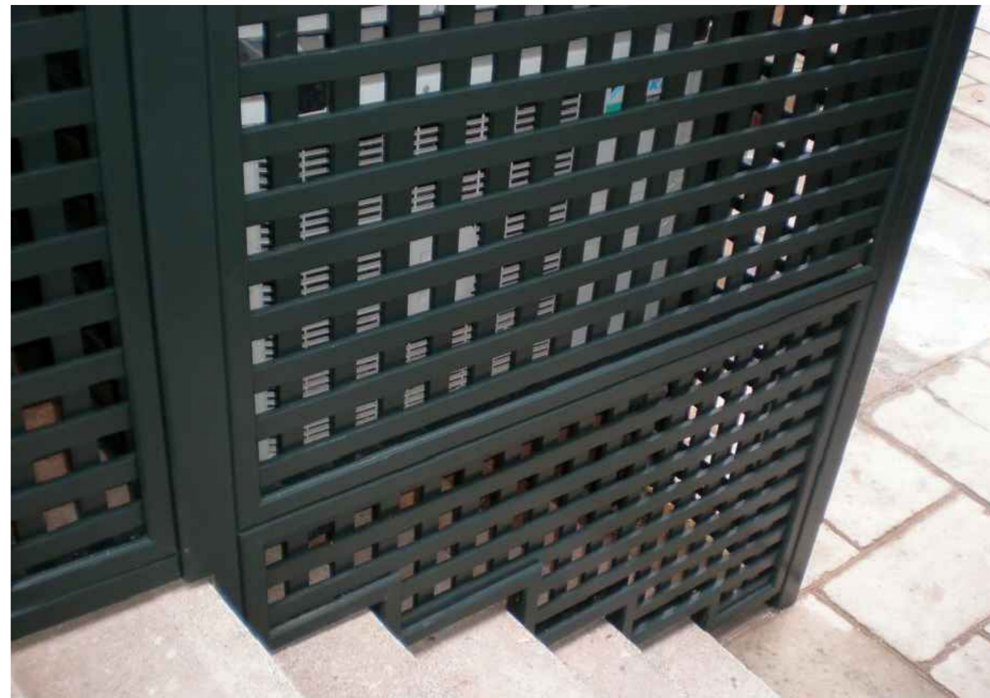
PRECEDENT IMAGE OF PROPOSED TRELLIS WORK

NOTE: 1 This drawing to be read in conjunction with all relevant architects and engineer's drawings and the specification. 2 Any discrepancies or details on or between these drawings must be drawn to the attention of the landscape architect (and to the architect or engineer as appropriate) in writing for clarification.