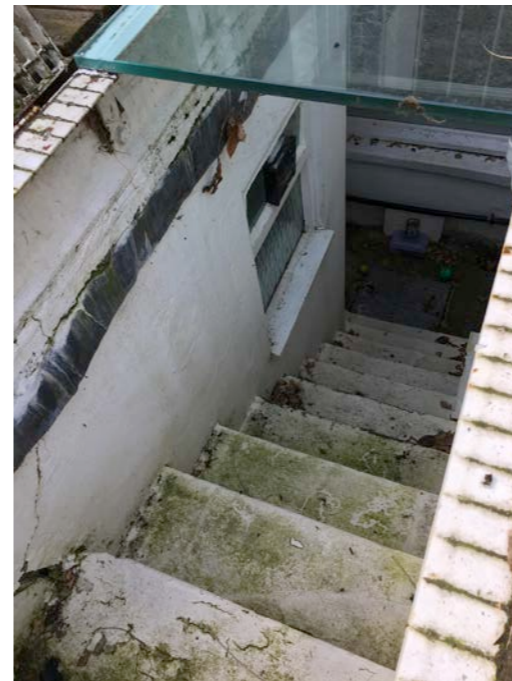
5 Light well