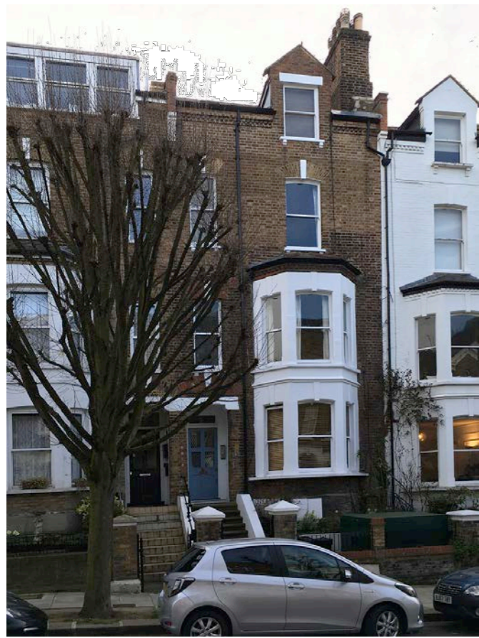
1 Front Elevation