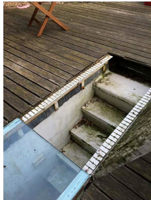
4 Stairs to light well