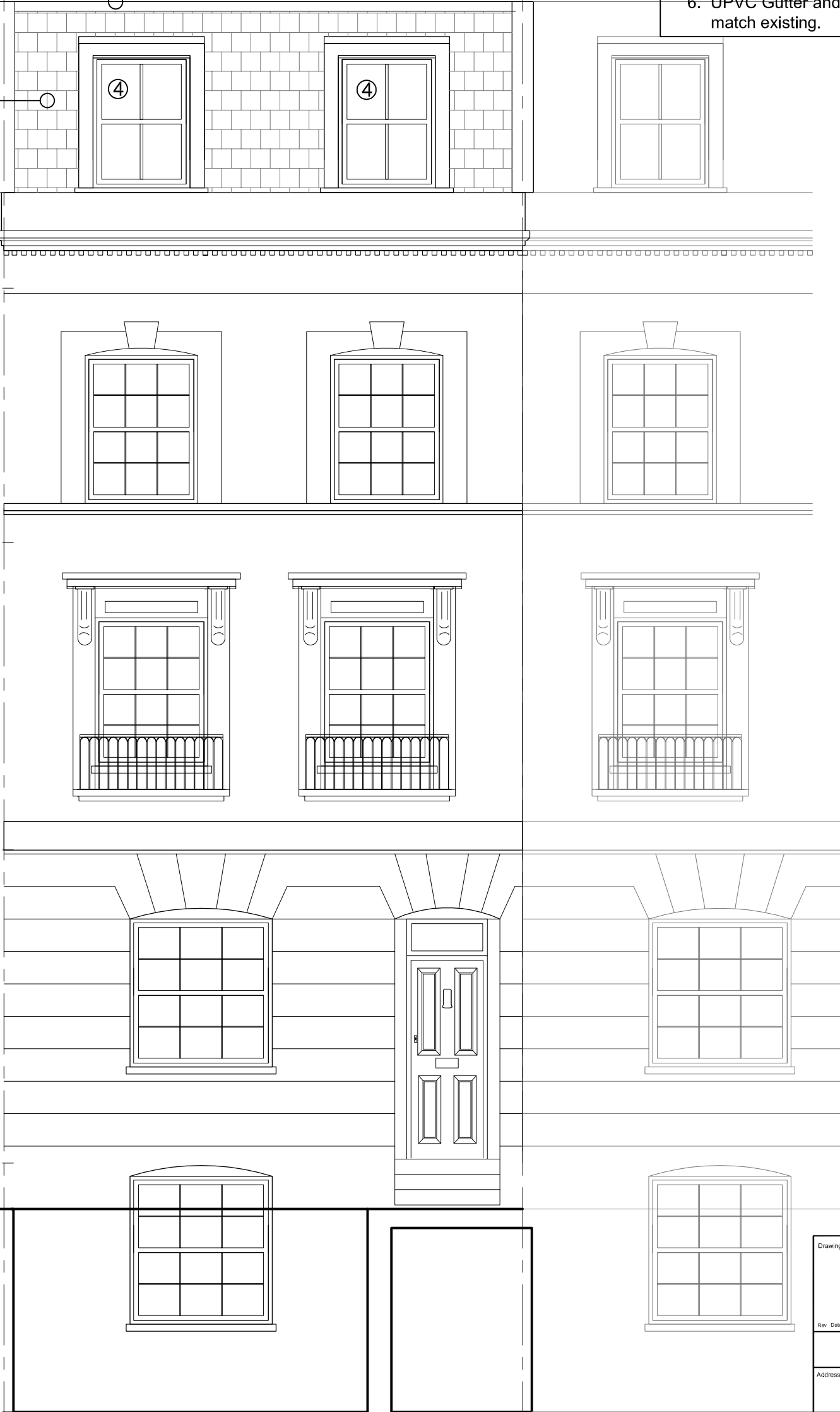
7A PROPOSED FRONT ELEVATION SCALE 1:50