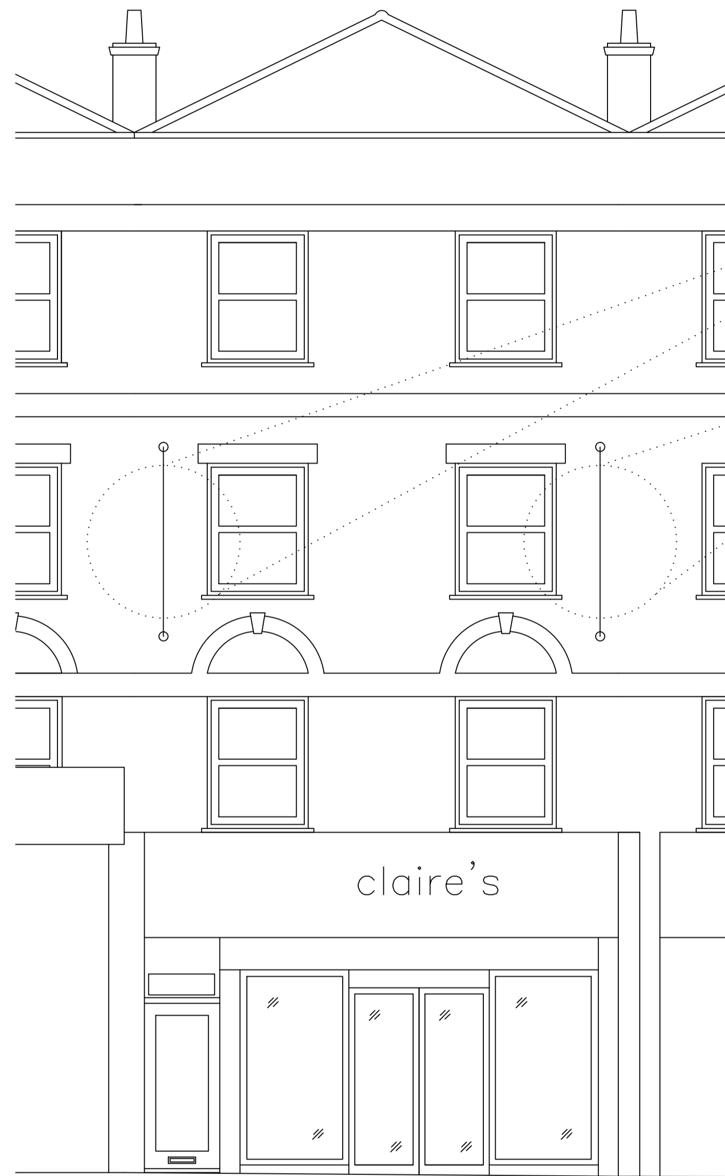
PROPOSED FRONT ELEVATION (1:50)