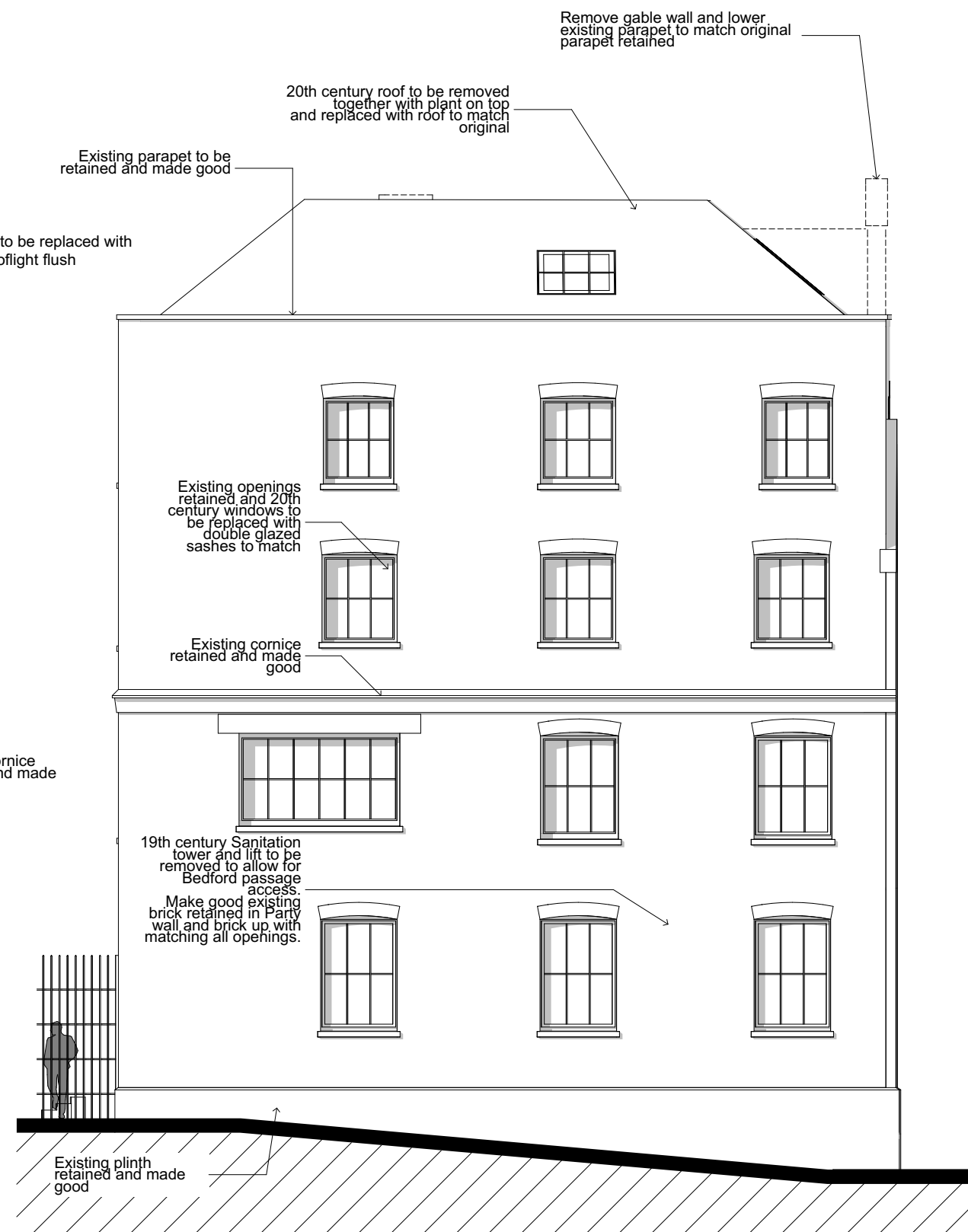
E-LB-04 Listed Building Proposed Elevation 04 1:100