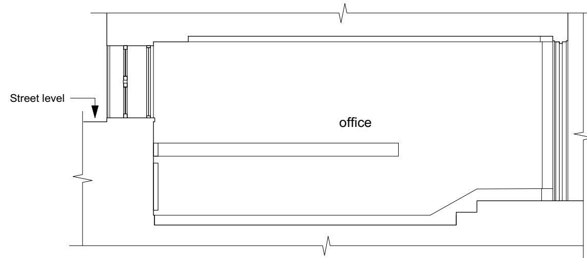
EXISTING SECTION A - A