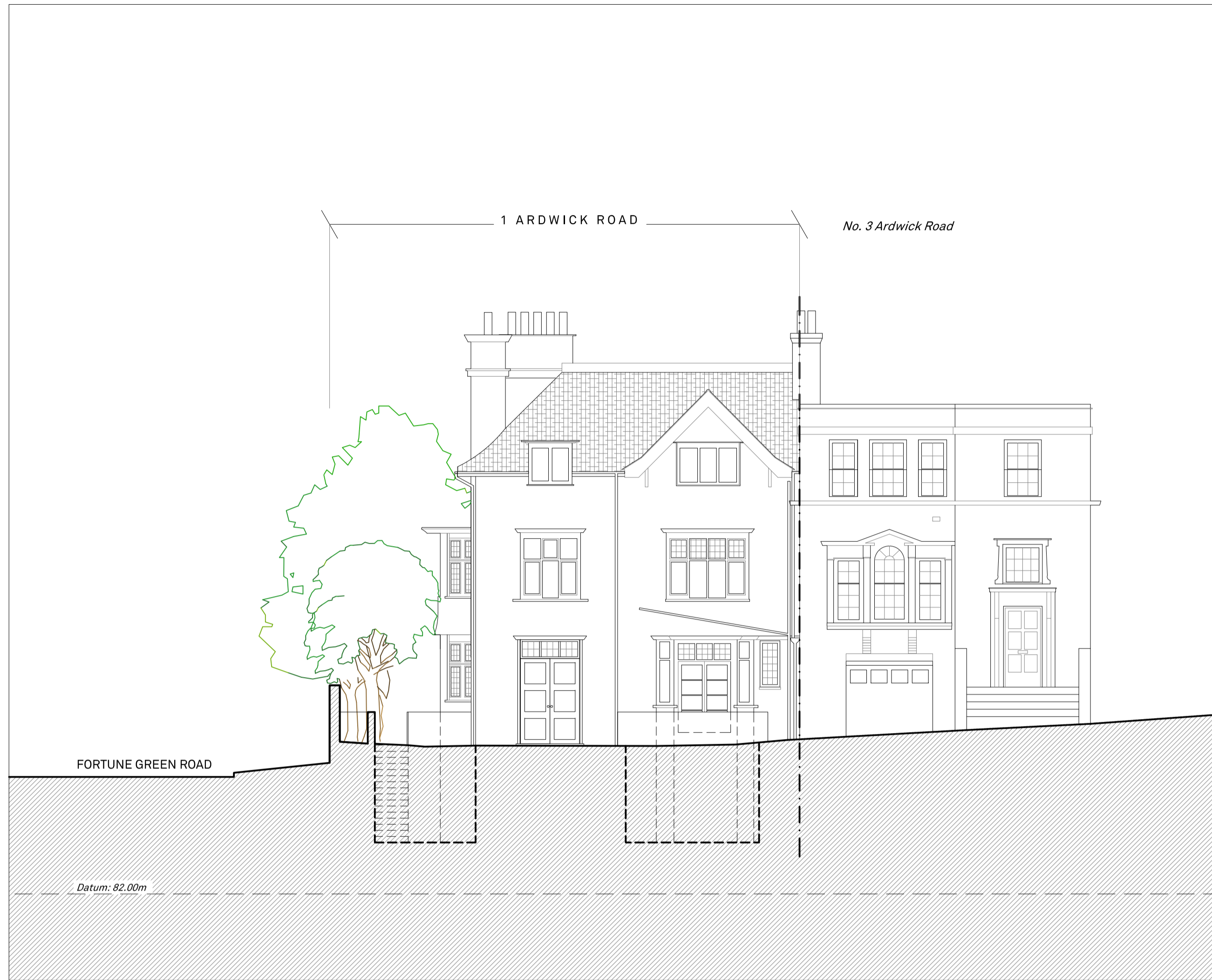
1 Approved North Elevation