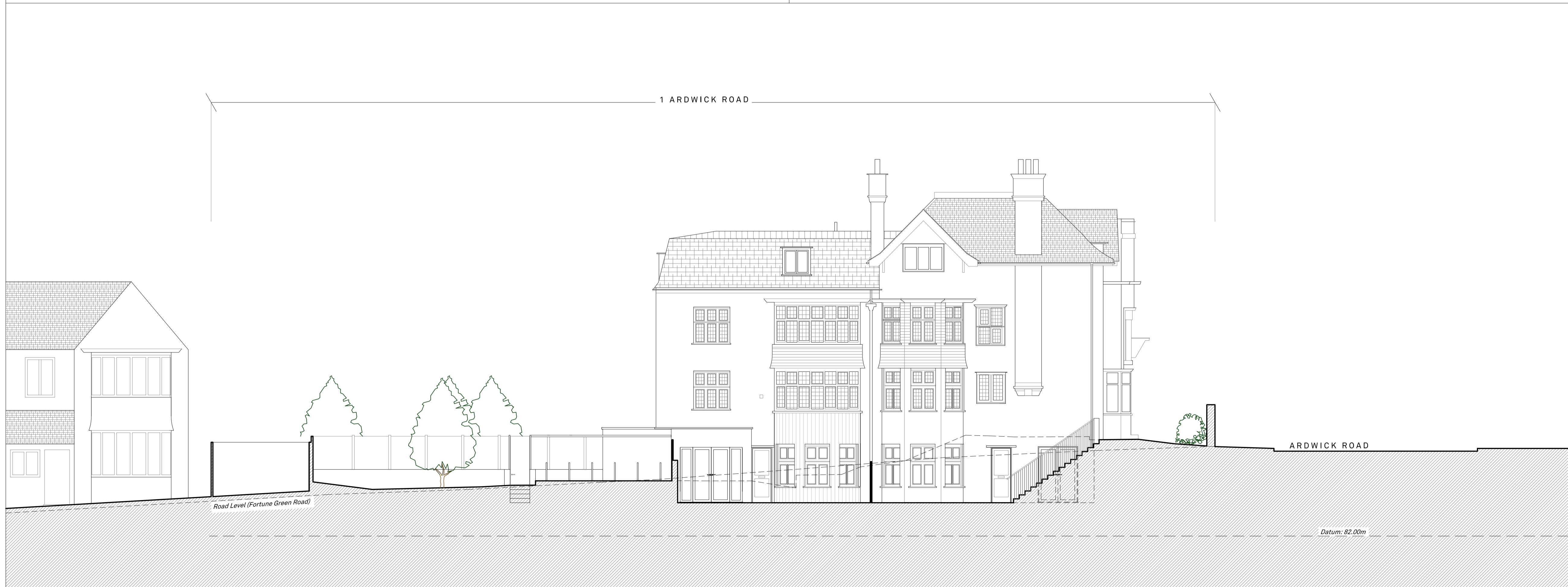
3 Approved East Elevation