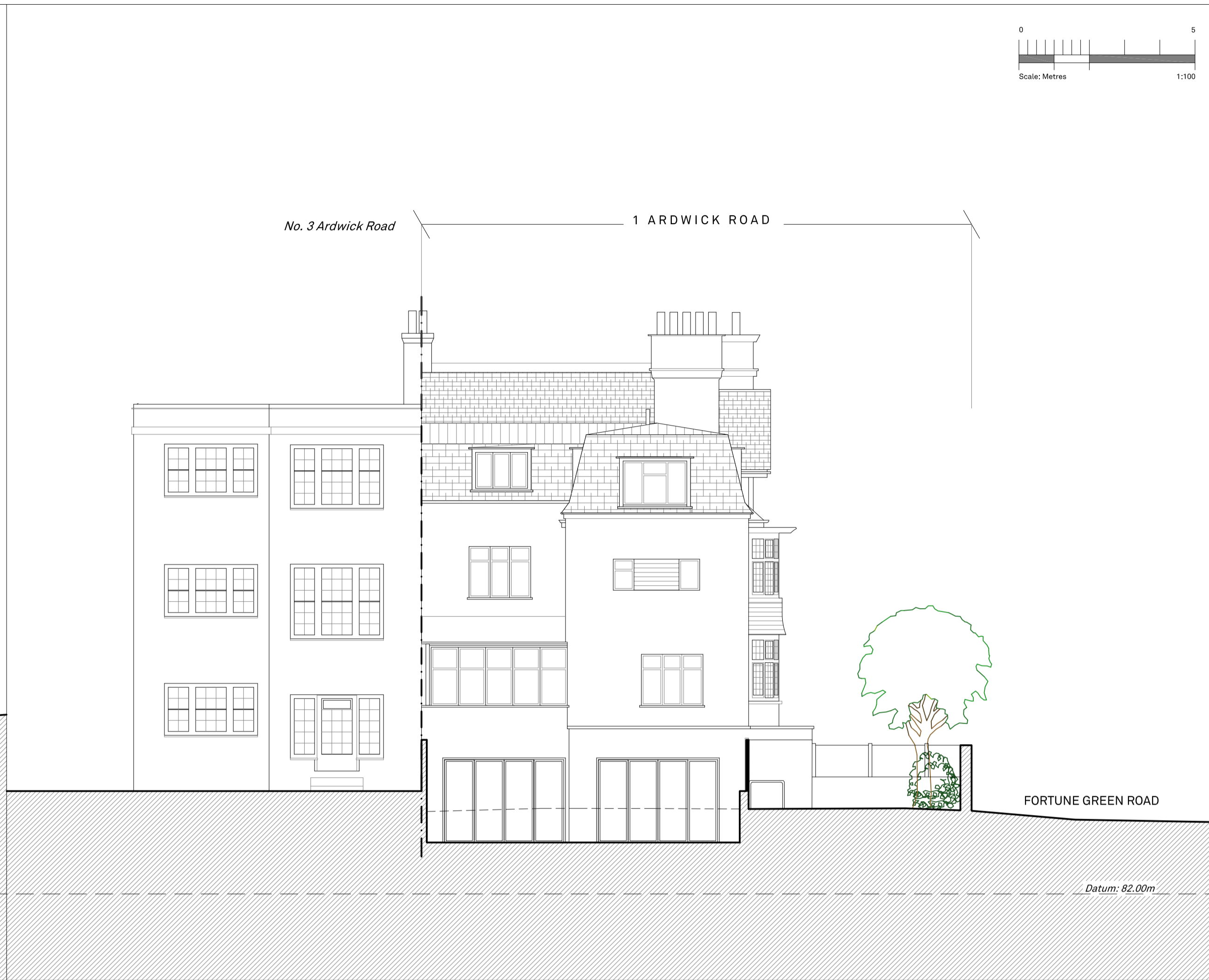
2 Approved South Elevation