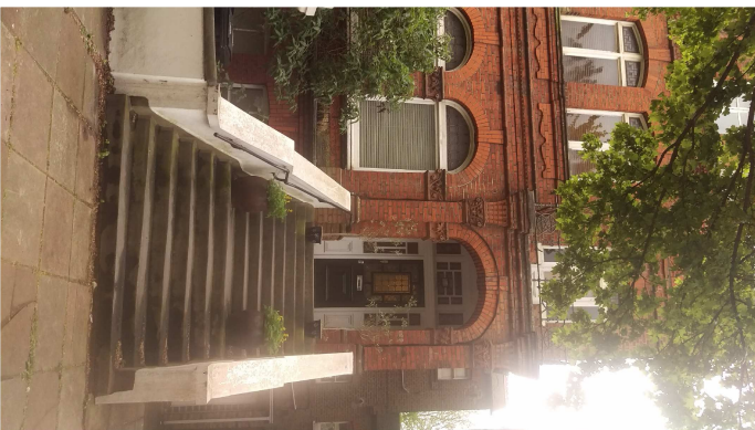
View of the building from outside