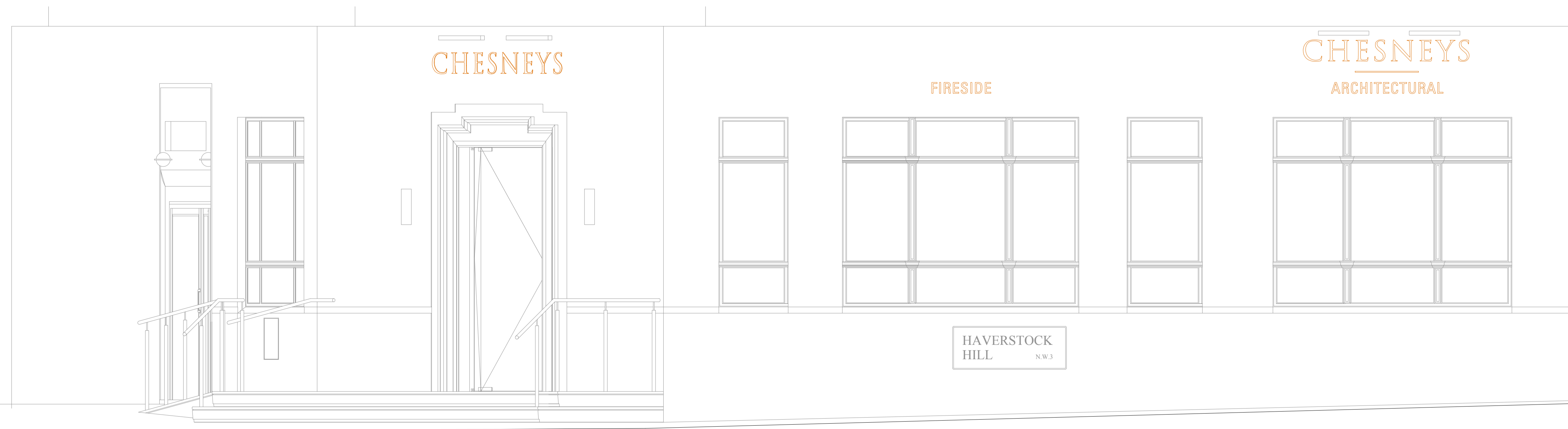
SECTION THROUGH AA'