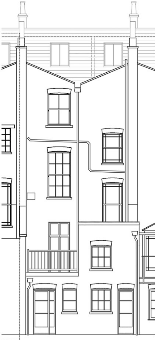
REAR ELEVATION - PROPOSED