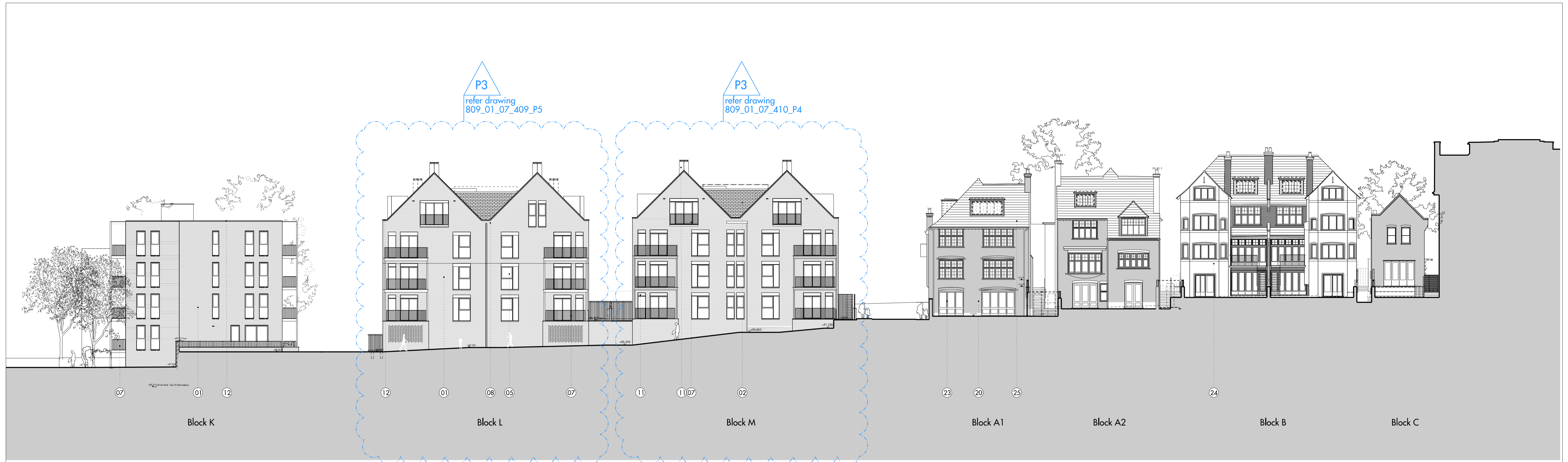
01 Courtyard Elevation NE