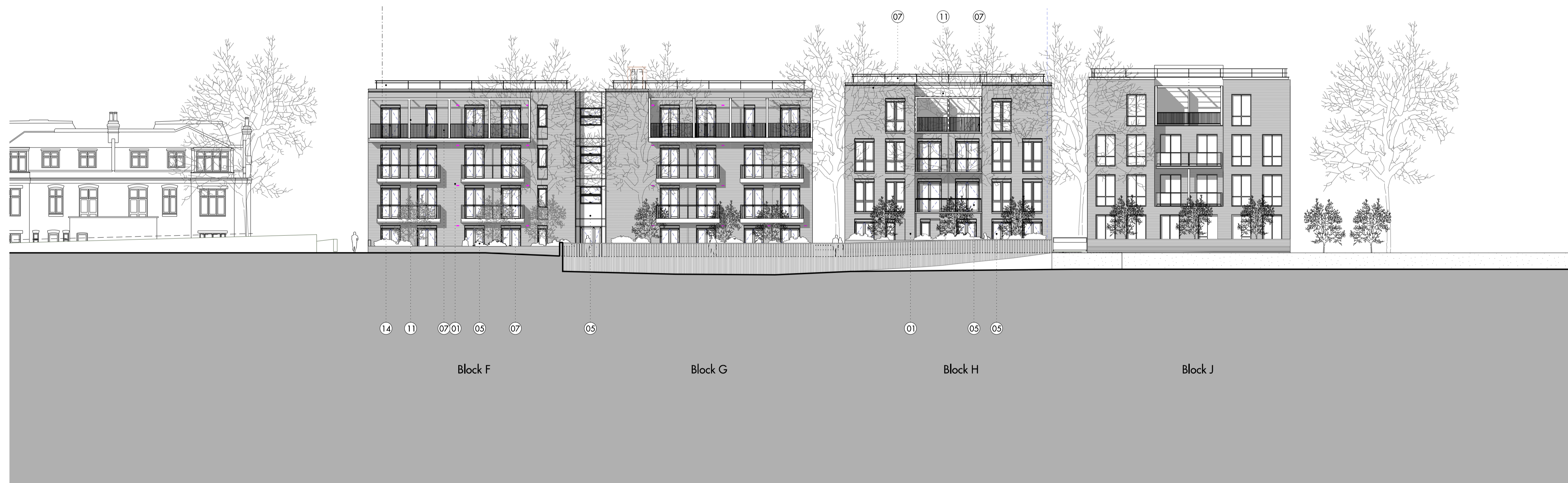
02 Courtyard Elevation SW