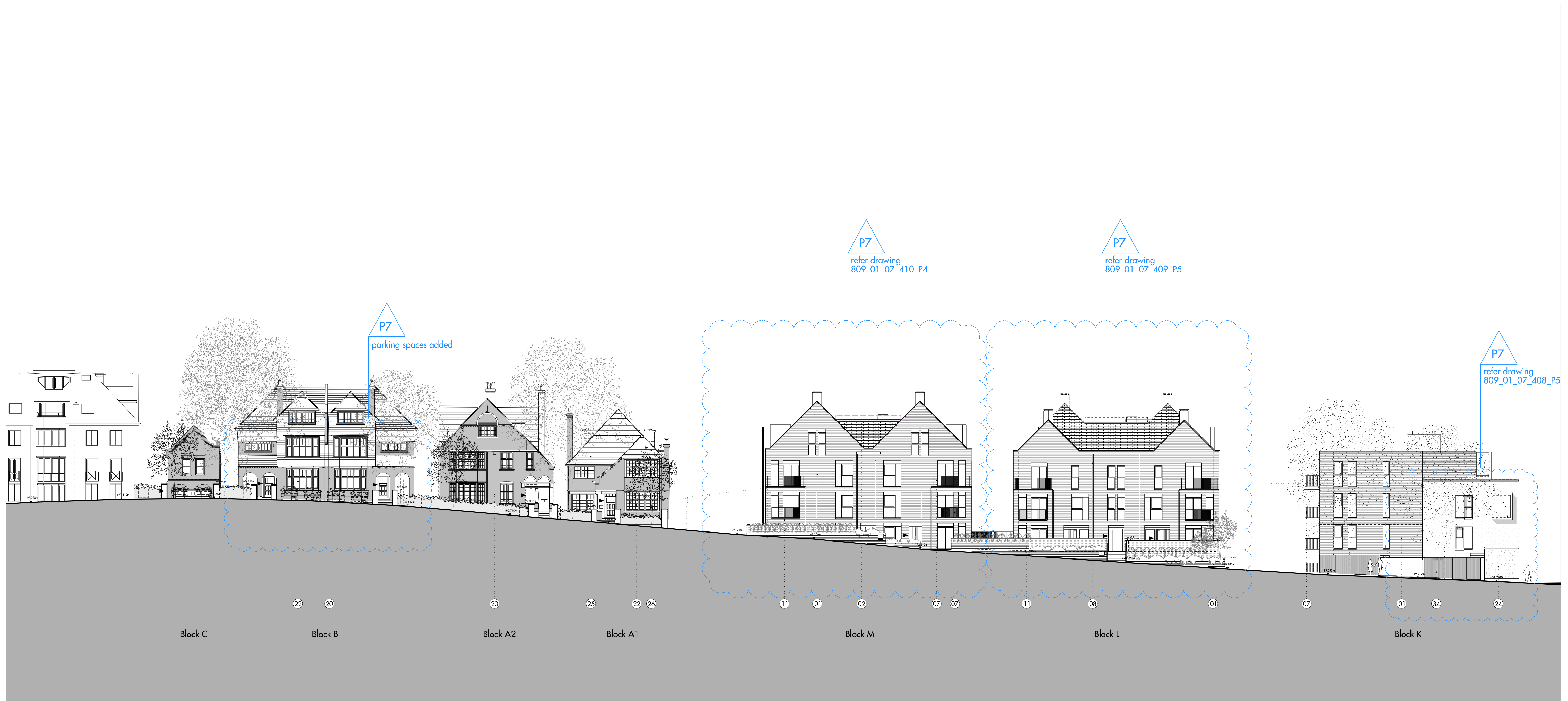
Kidderpore Avenue Elevation