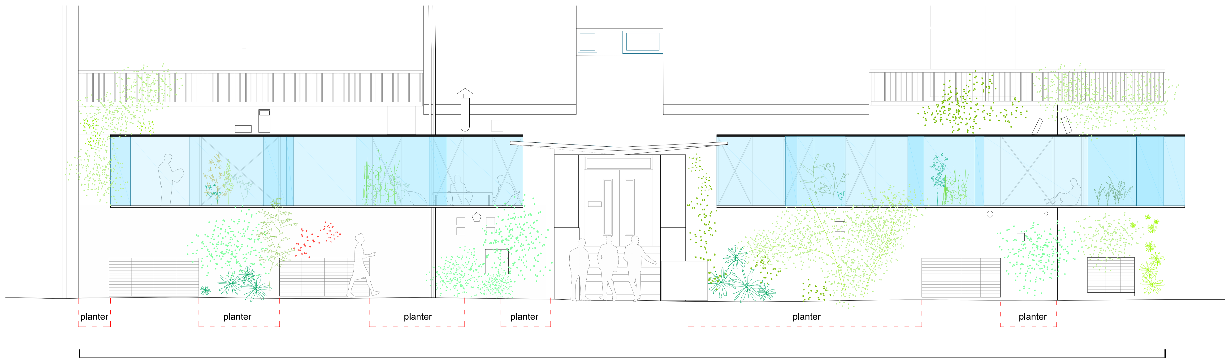
PROPOSED PLANTERS ELEVATIONS sc 1:50