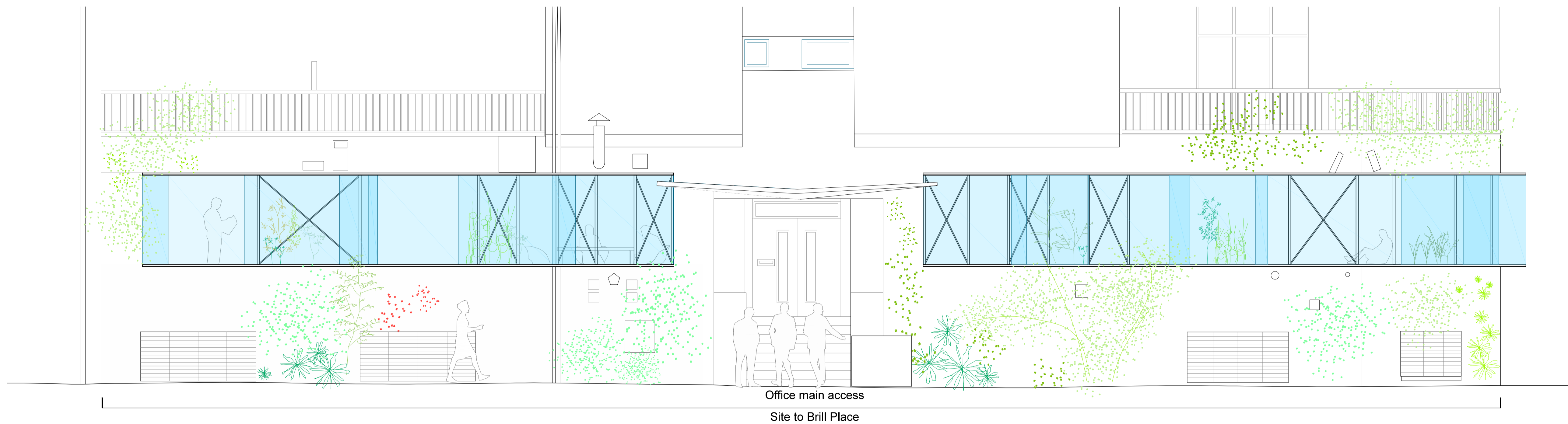
PROPOSED SOUTH ELEVATION sc 1:50