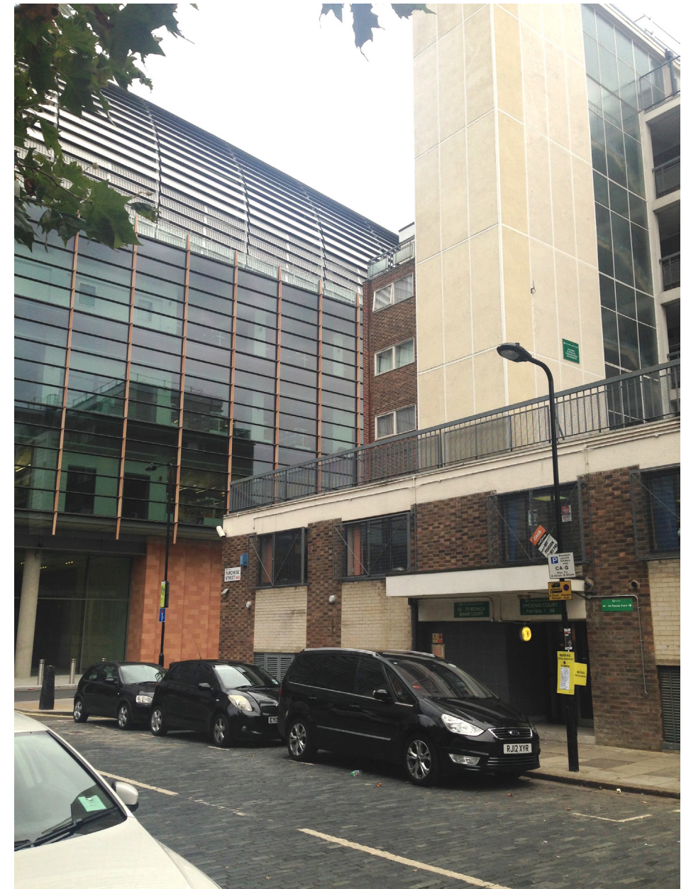
East facade view with Francis Crick Institute at the back