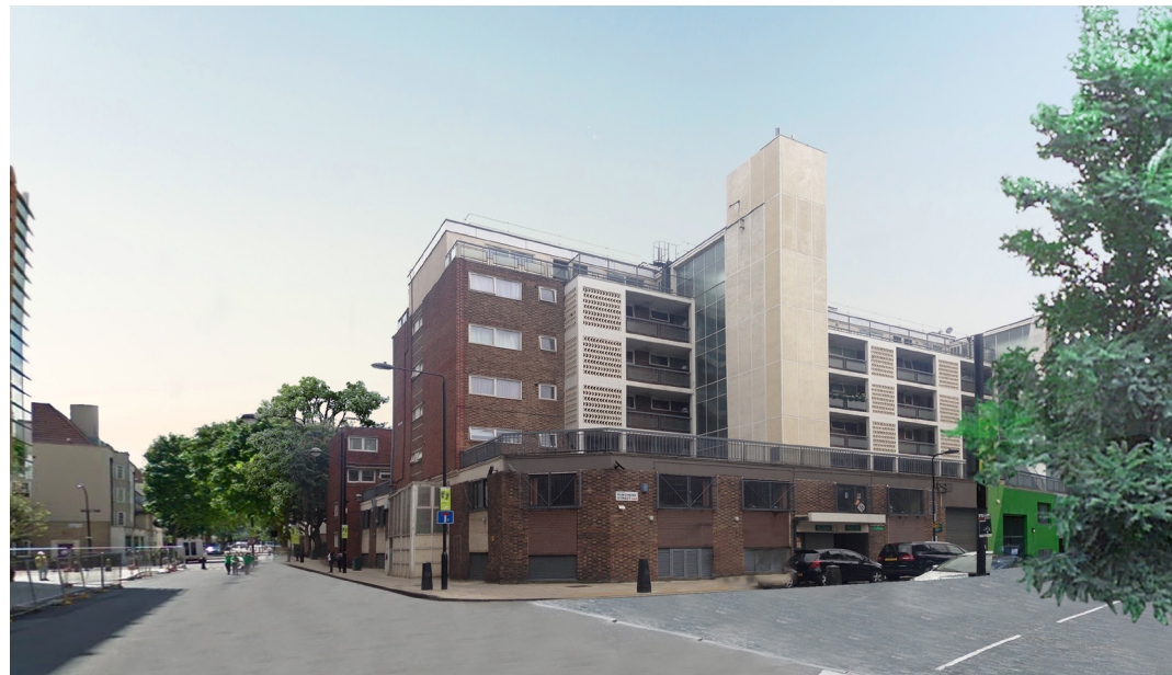
South and East facades view