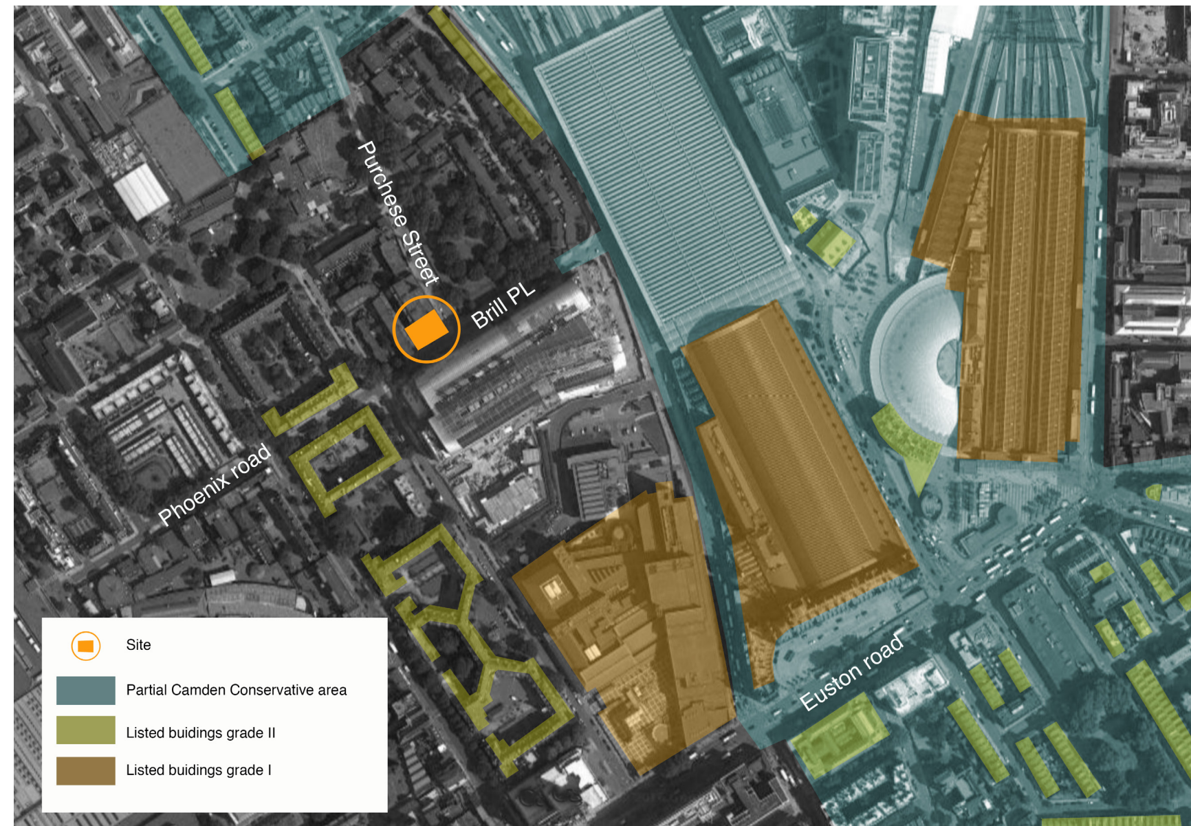
Map illustrating Conservation Area and nearby listed buildings

There are neighbouring residential properties to the north and east of Phoenix Court.