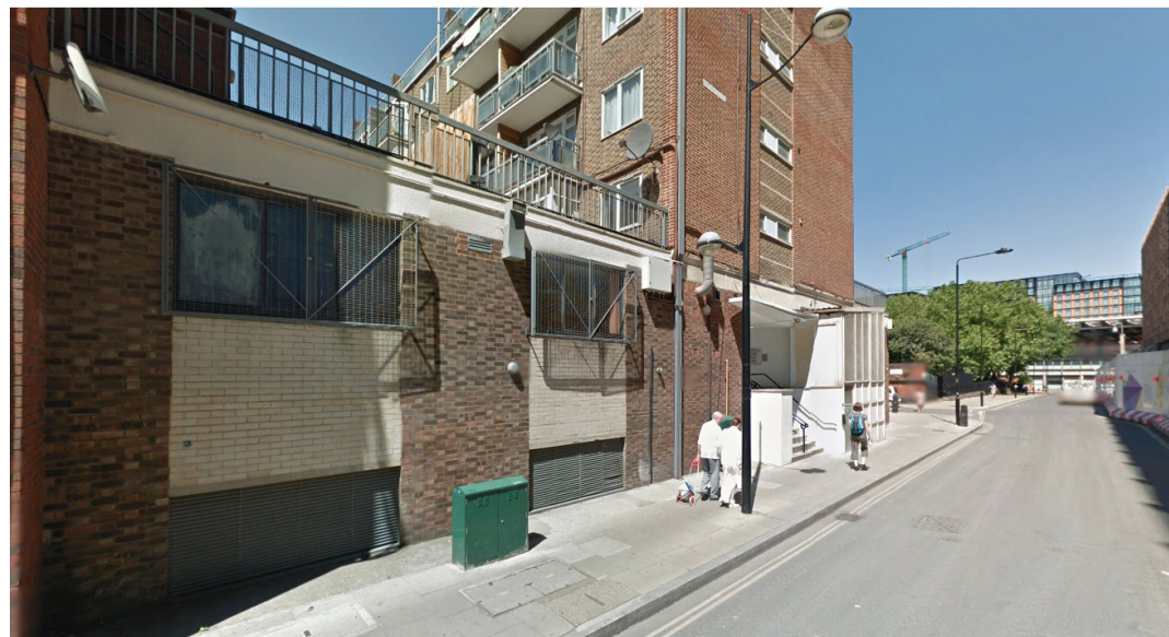
South facade view