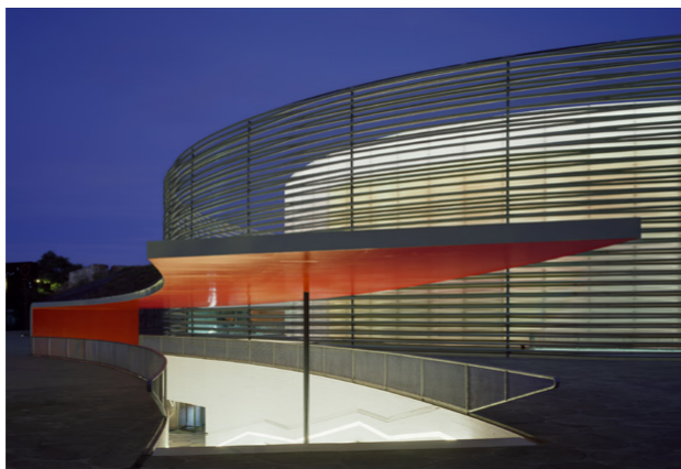
Congress Center and auditorium 1999-2006 Badajoz, Spain