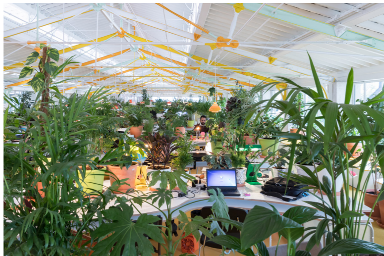
Second Home 2015-2016 Lisbon, Portugal