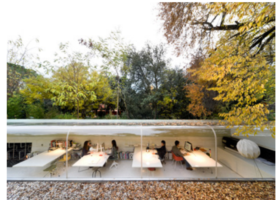
Studio in the woods 2006-2008 Madrid, Spain