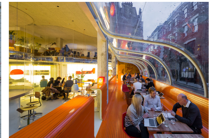
Second Home 2013-2014 London, United Kingdom