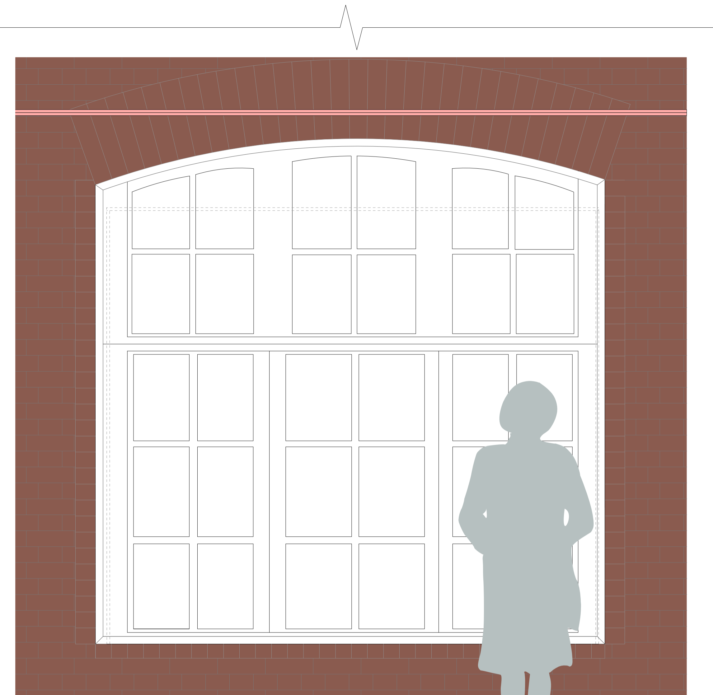
TYPICAL WINDOW ELEVATION DETAIL (Scale 1: 10)