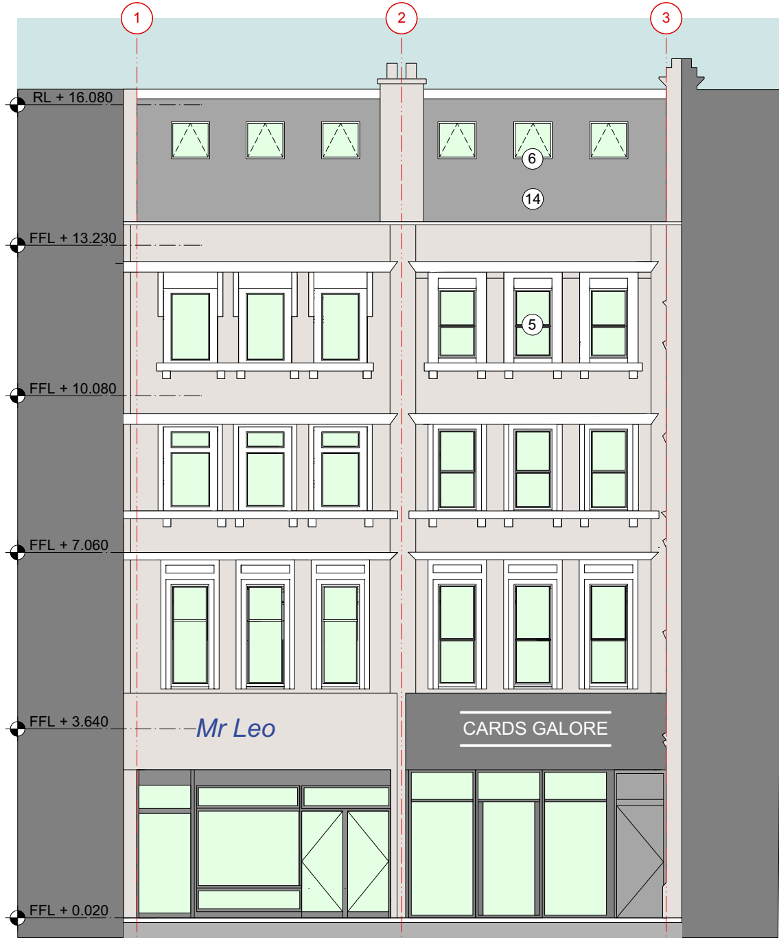
2 FRONT ELEVATION 5100 5100 N°60 TOTTENHAM COURT ROAD N°61 TOTTENHAM COURT ROAD