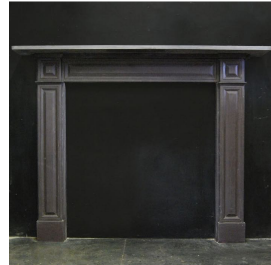
4 Photo of Actual Fireplace

Do not scale off this drawing. All trade contractors to be responsible for taking and checking their own site dimensions. Any errors or omissions to be reported to InsideOut immediately, prior to work being carried out. All site dimensions shown are based upon the measured survey of the property carried out by independent surveyors. The accuracy of this information is not the responsibility of InsideOut. InsideOut also accept no responsibility for the accuracy of any structural and servicing information shown on this drawing. This information is shown for guidance purposes only, and where applicable is based on information provided by the consulting structural engineers, consulting M&E engineers, client representatives, and/or specialist subcontractors respectively. Reference should always be made to engineers and subcontractors current drawings and specifications. This drawing and design is the copyright of InsideOut and is not to be used for any purpose without their consent.