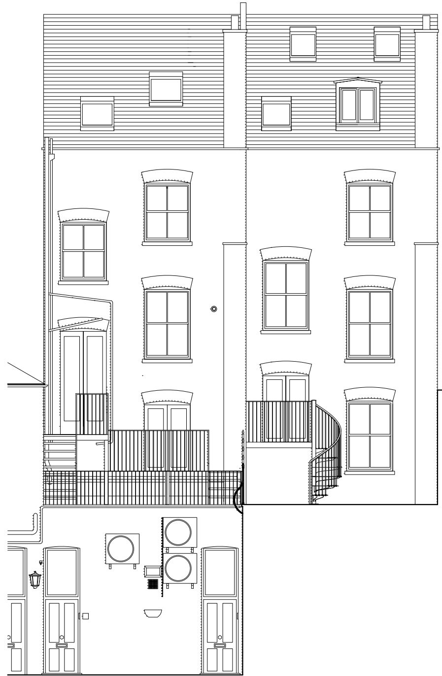
Existing Rear Elevation 1:100 @ A3