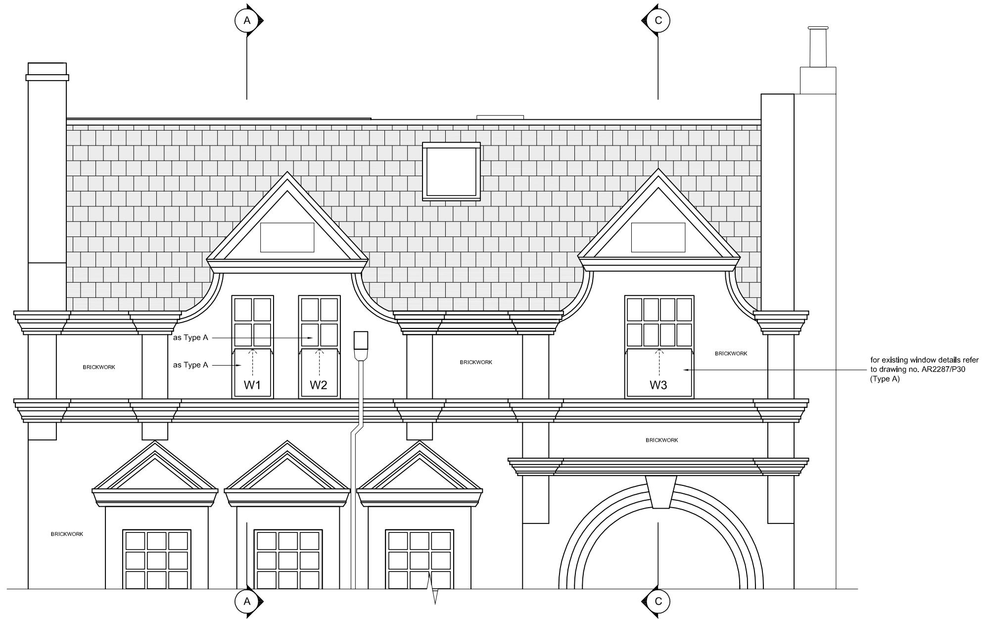
Front Elevation - North (existing)