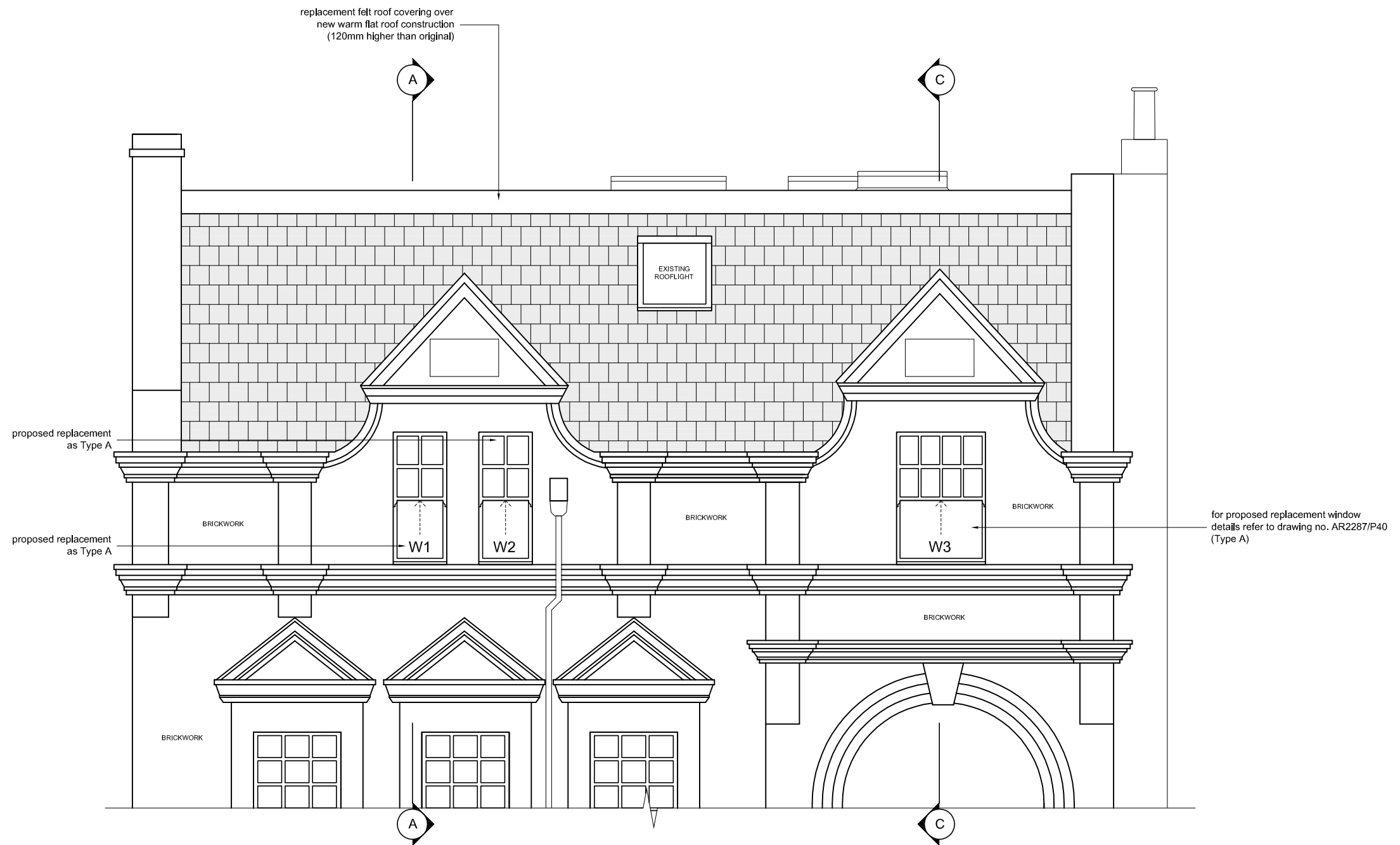
Front Elevation - North (proposed)