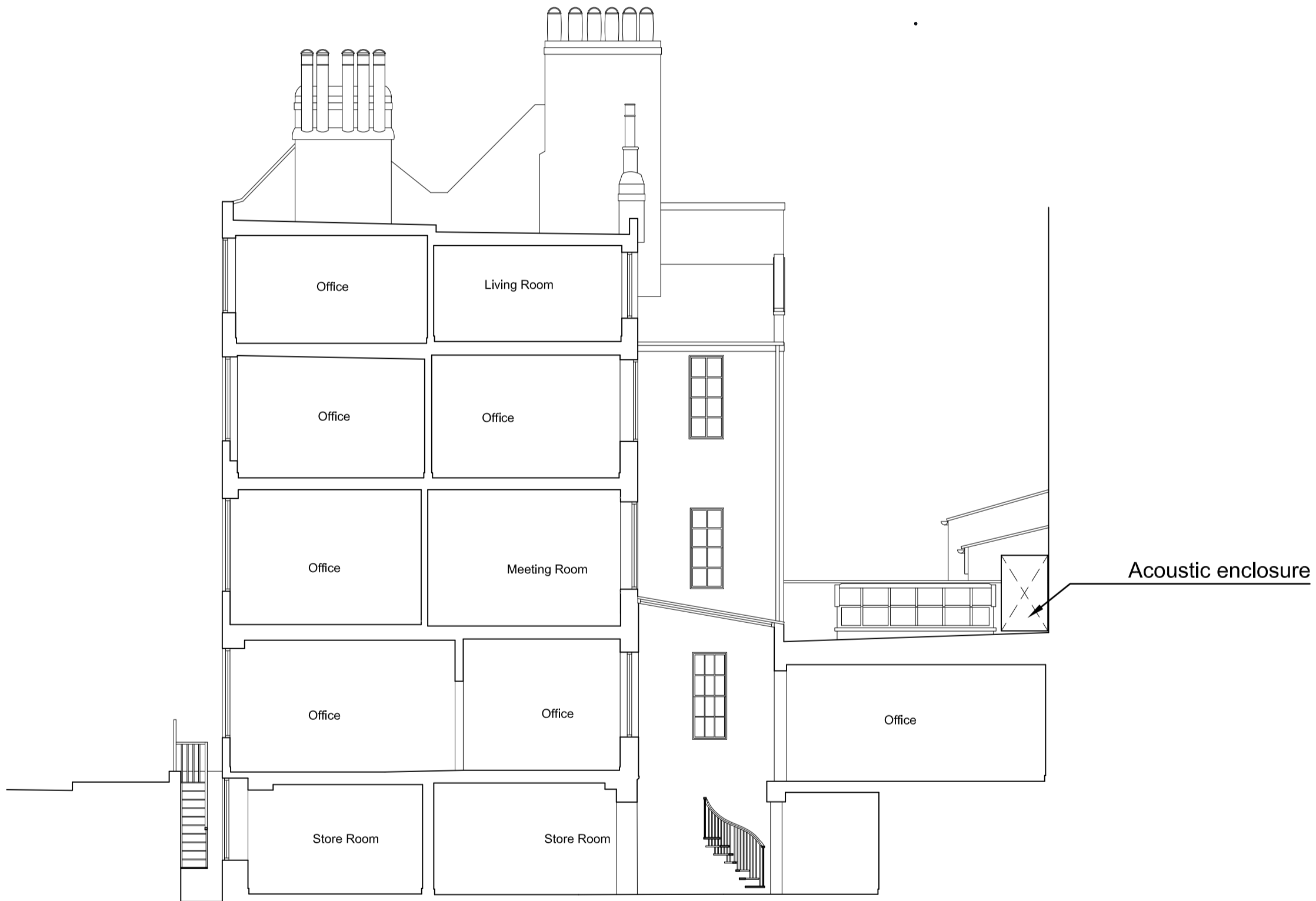
02 Elevation D Scale 1:100