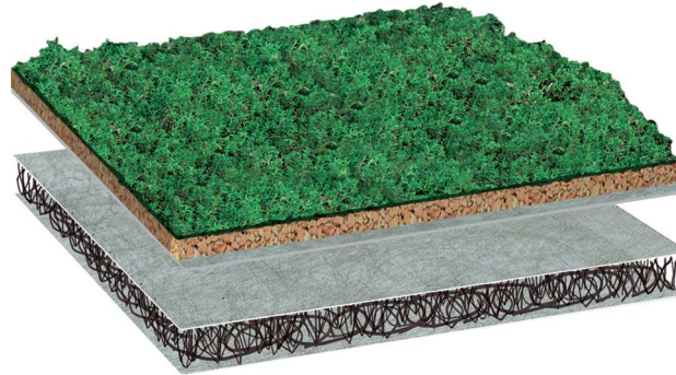
Bauder XF301 Sedum Blanket Fire Rating - BS 476 Part 3:2004 Ext.F.AA Ext.S.AA

Please contact Bauder Technical Services for confirmation of suitability to waterproofing system and deck type E: technical@bauder.co.uk T: 0845 271 8800