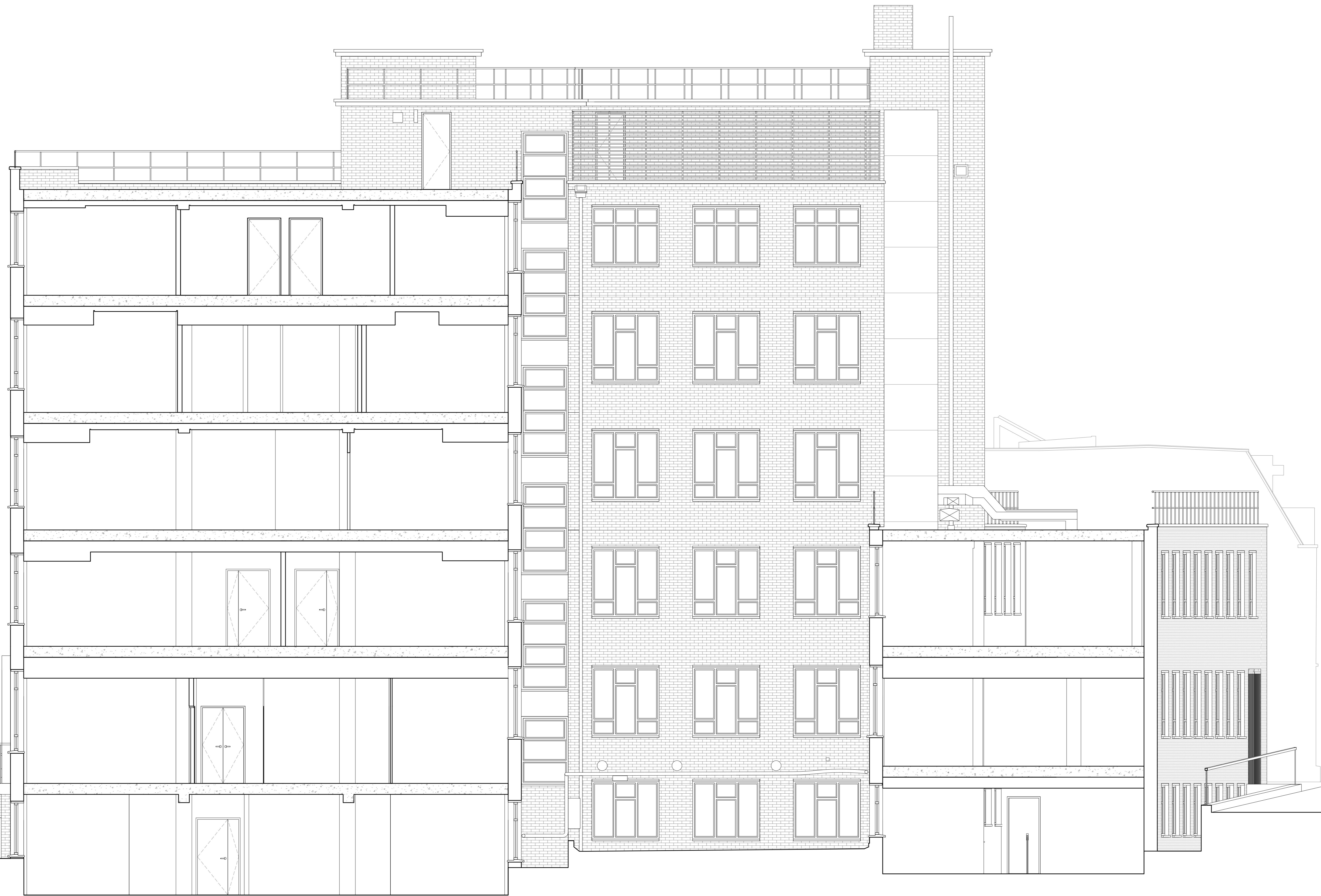
EE - Lightwell Elevation South as Existing 1 : 50