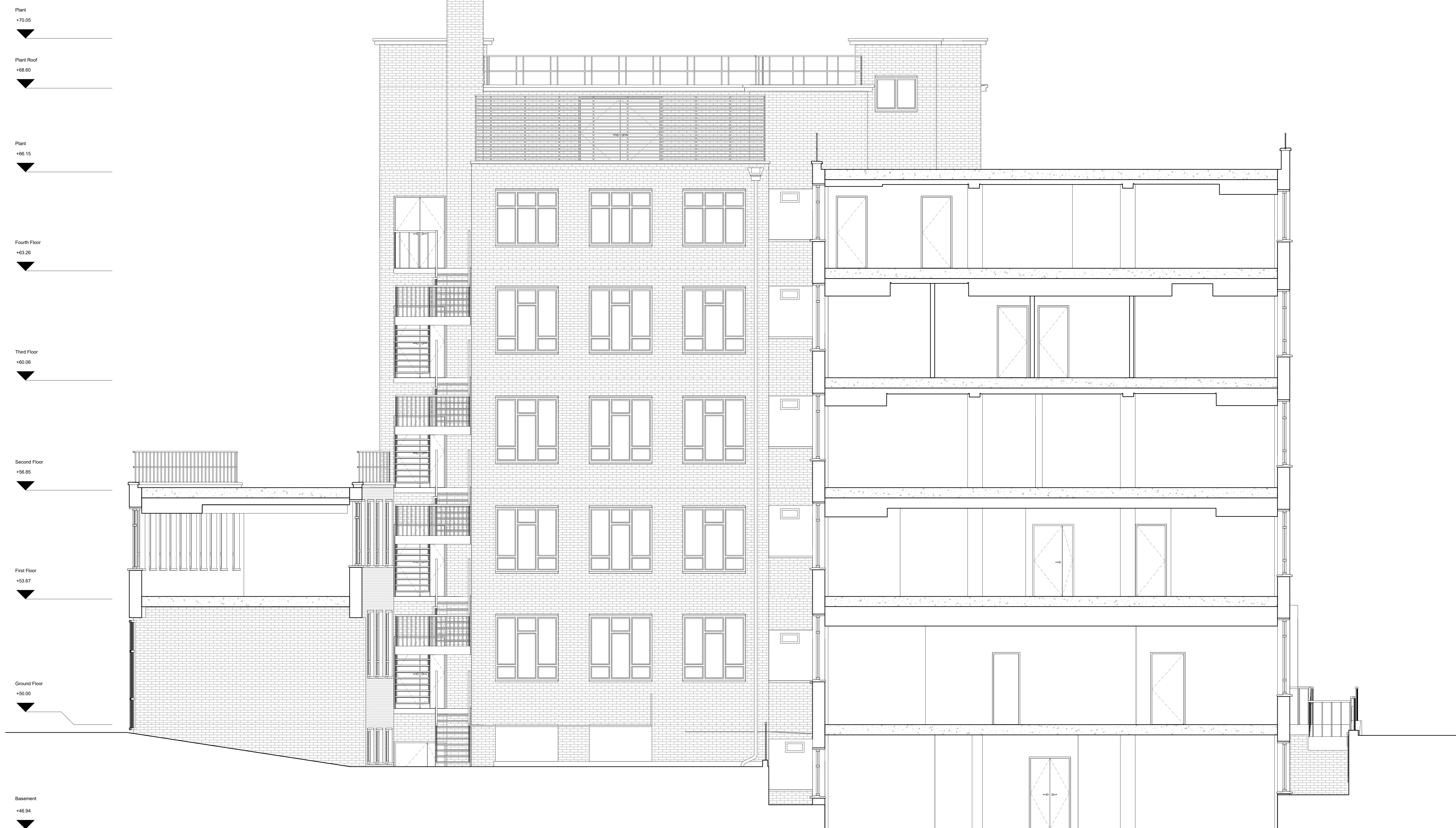
DD - Courtyard Elevation North as Existing 1 : 50