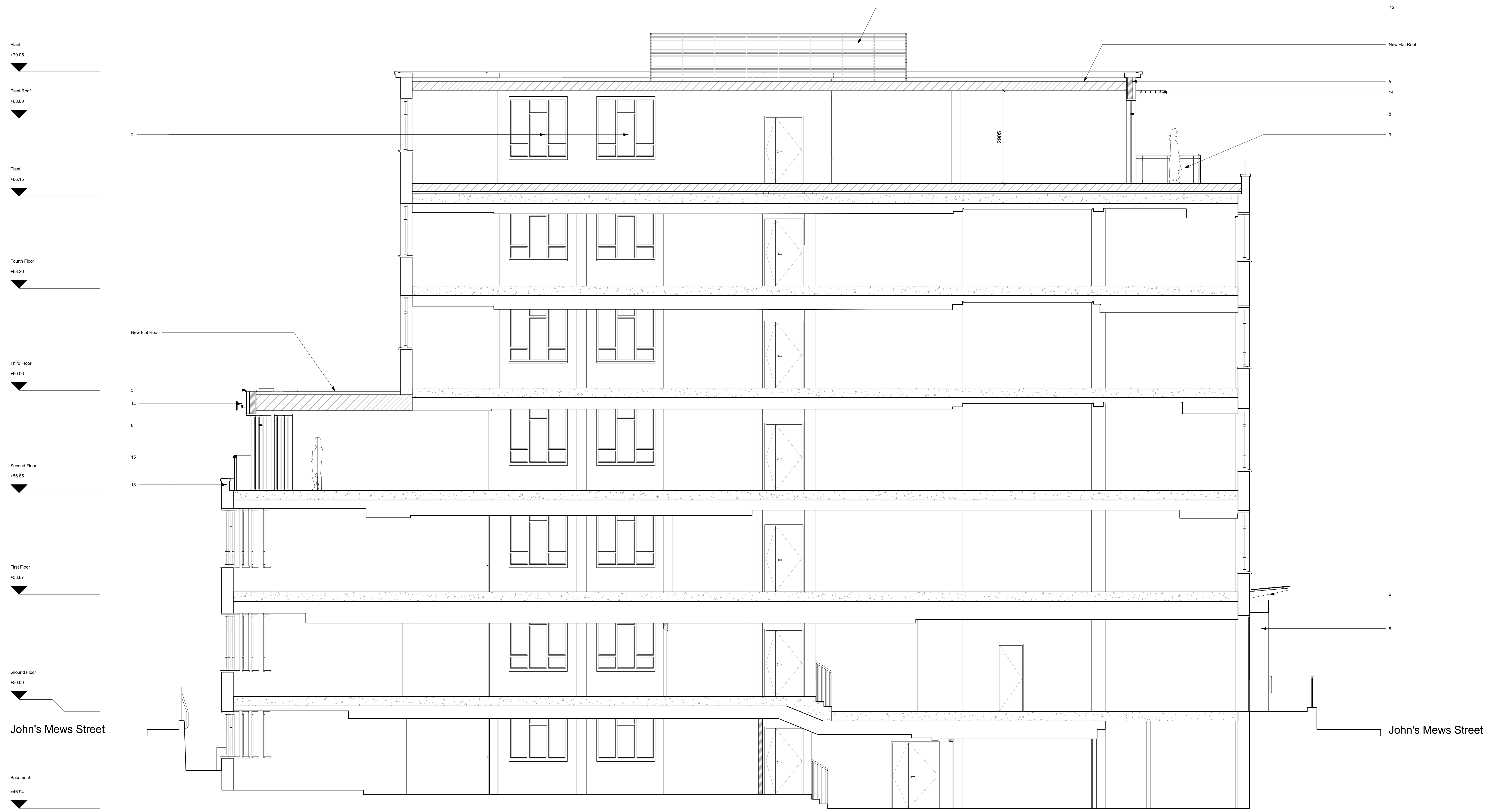
Section AA as Proposed 1 : 50