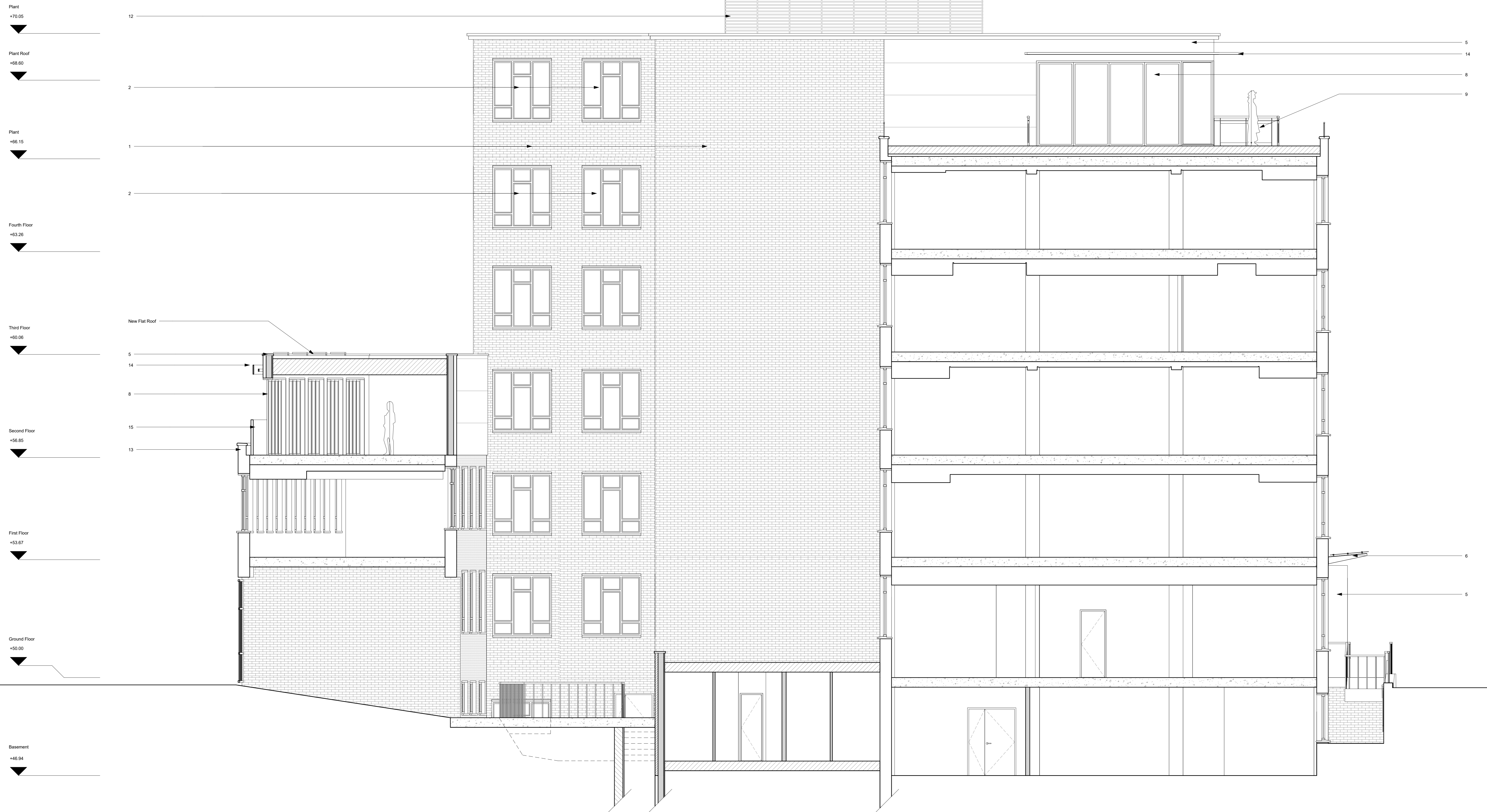
DD - Courtyard Elevation North as Proposed 1 : 50