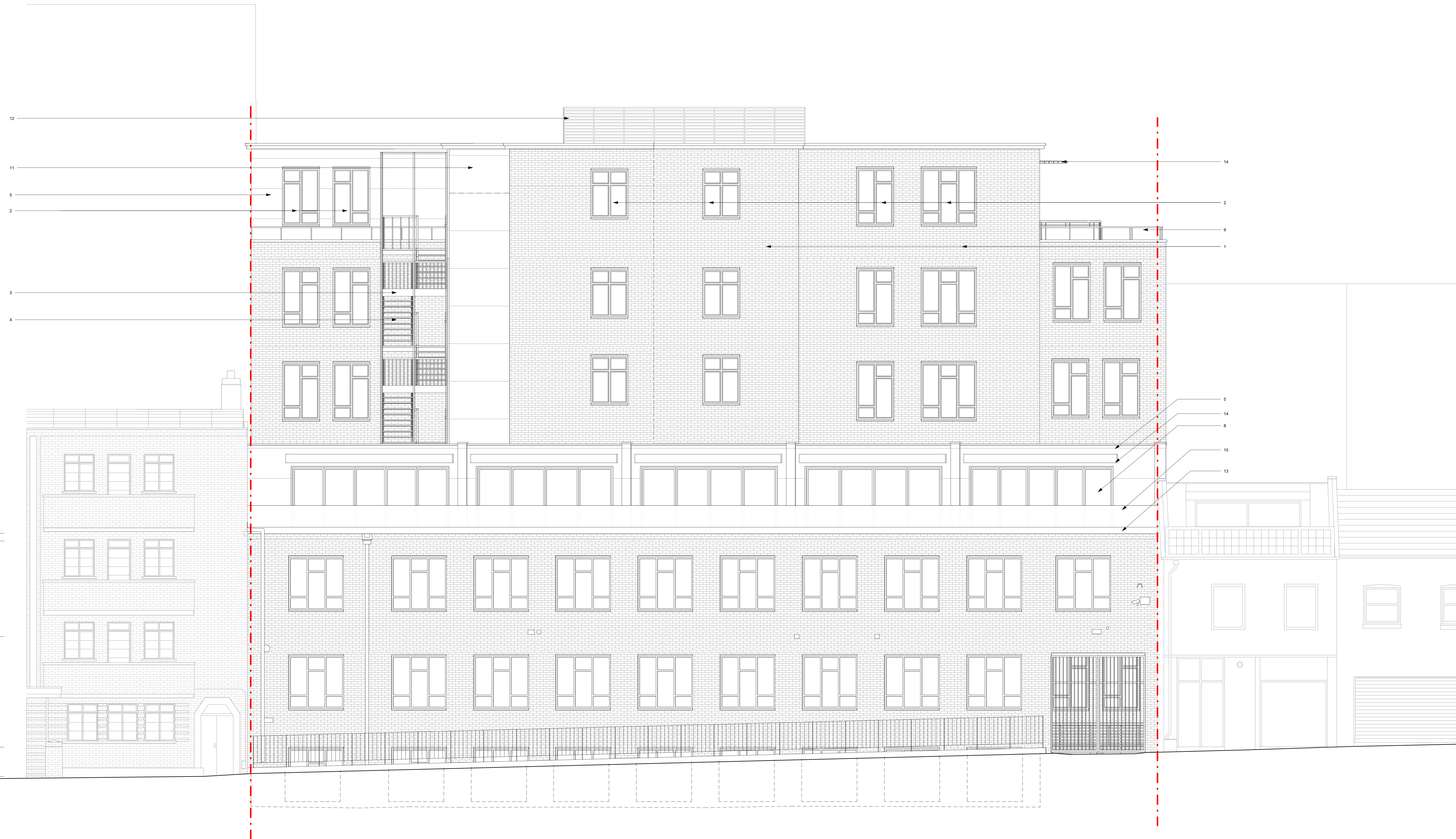
CC - John's Mews Elevation as Proposed 1 : 50