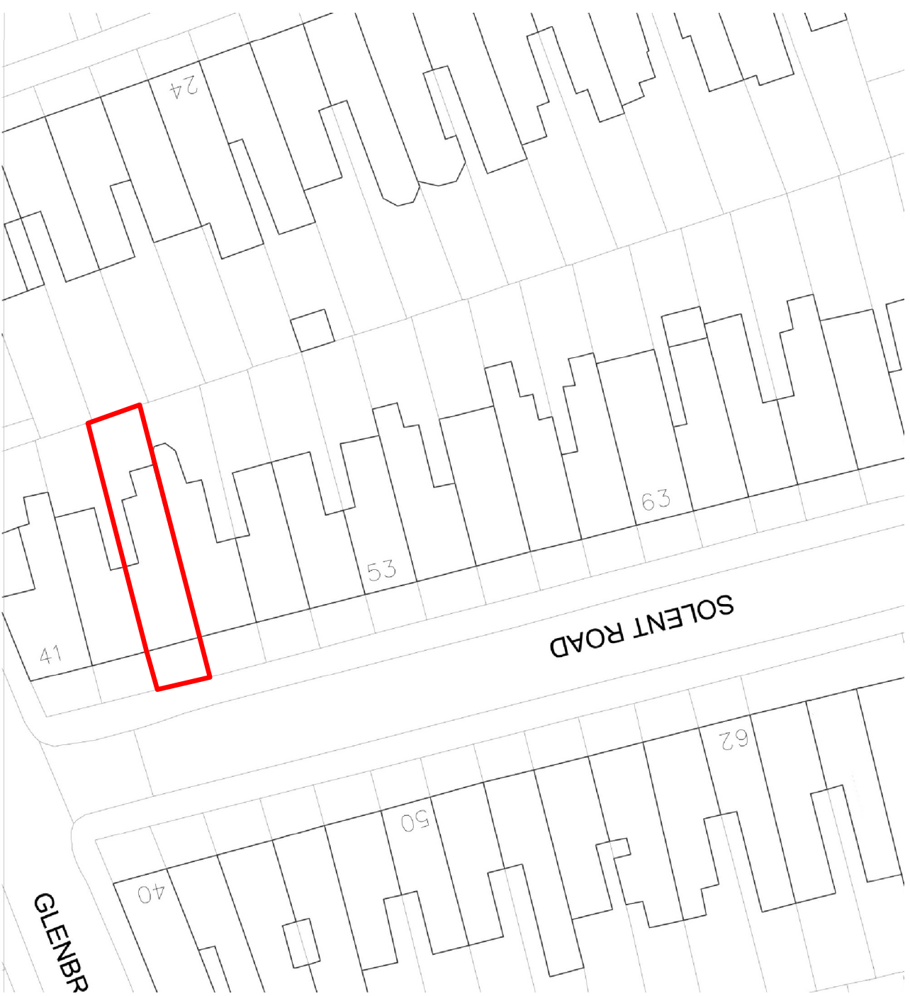
Block Plan SCALE 1:500@A3