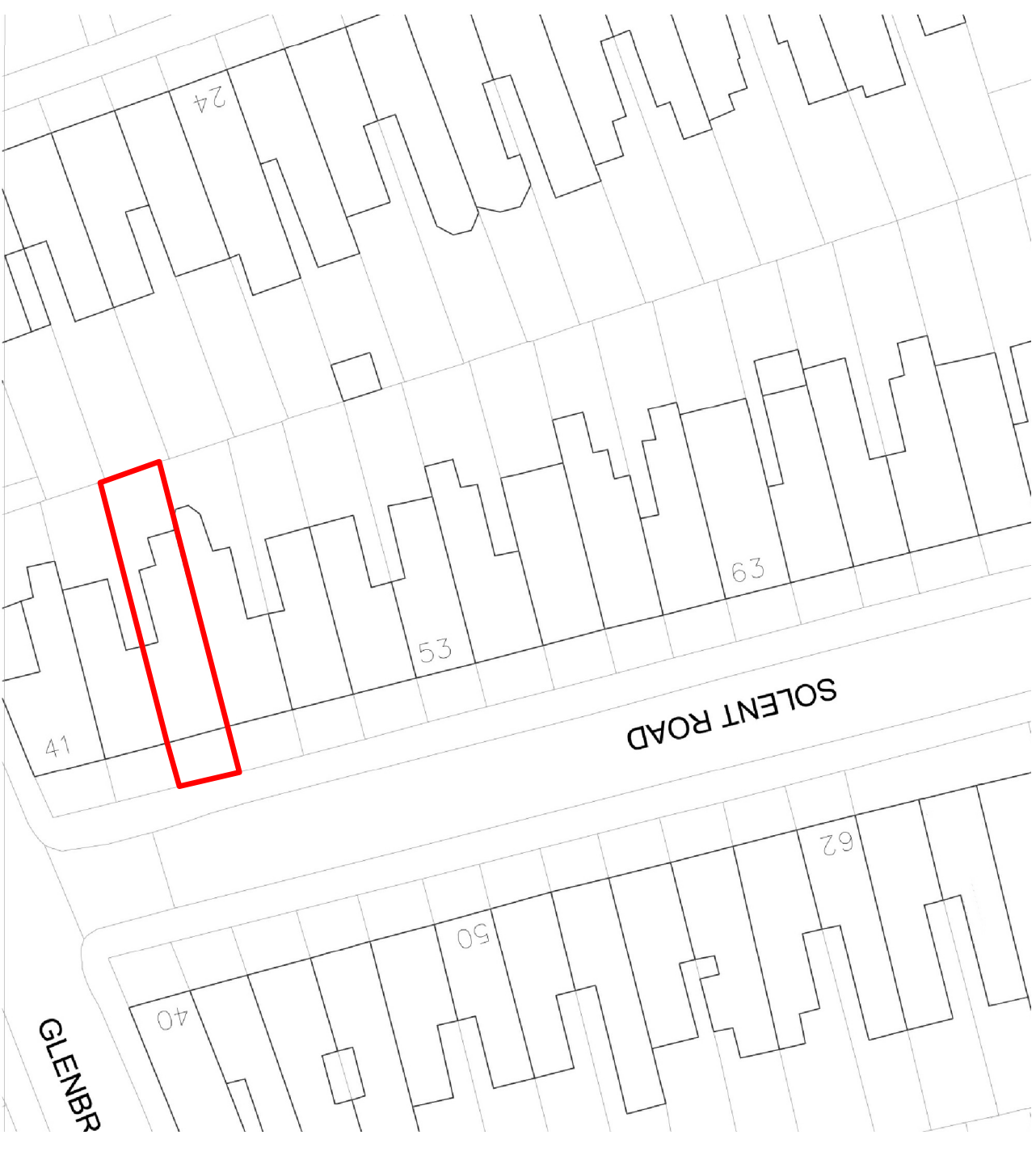
Block Plan SCALE 1:500@A3