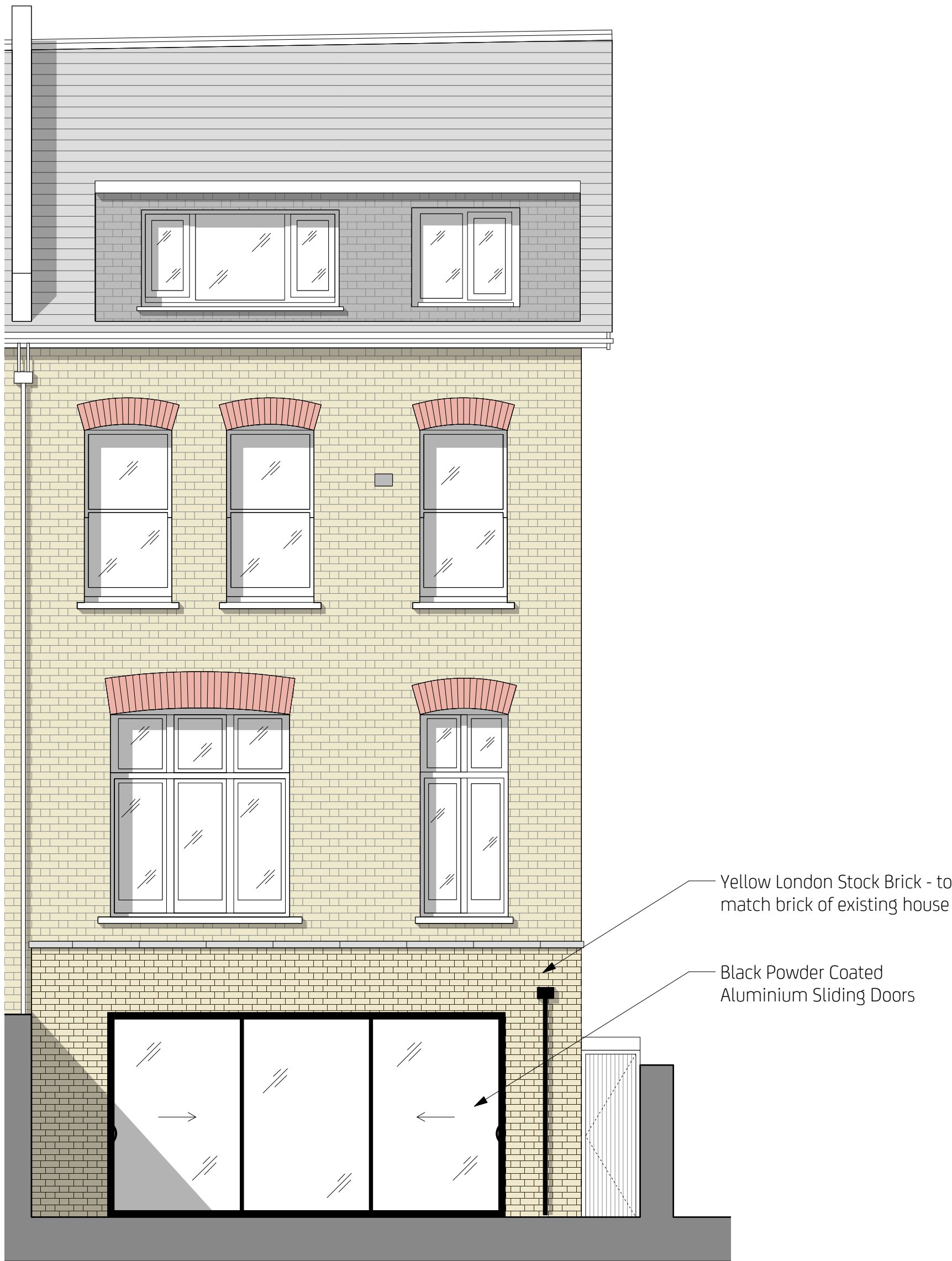
01 As-Built Rear Elevation