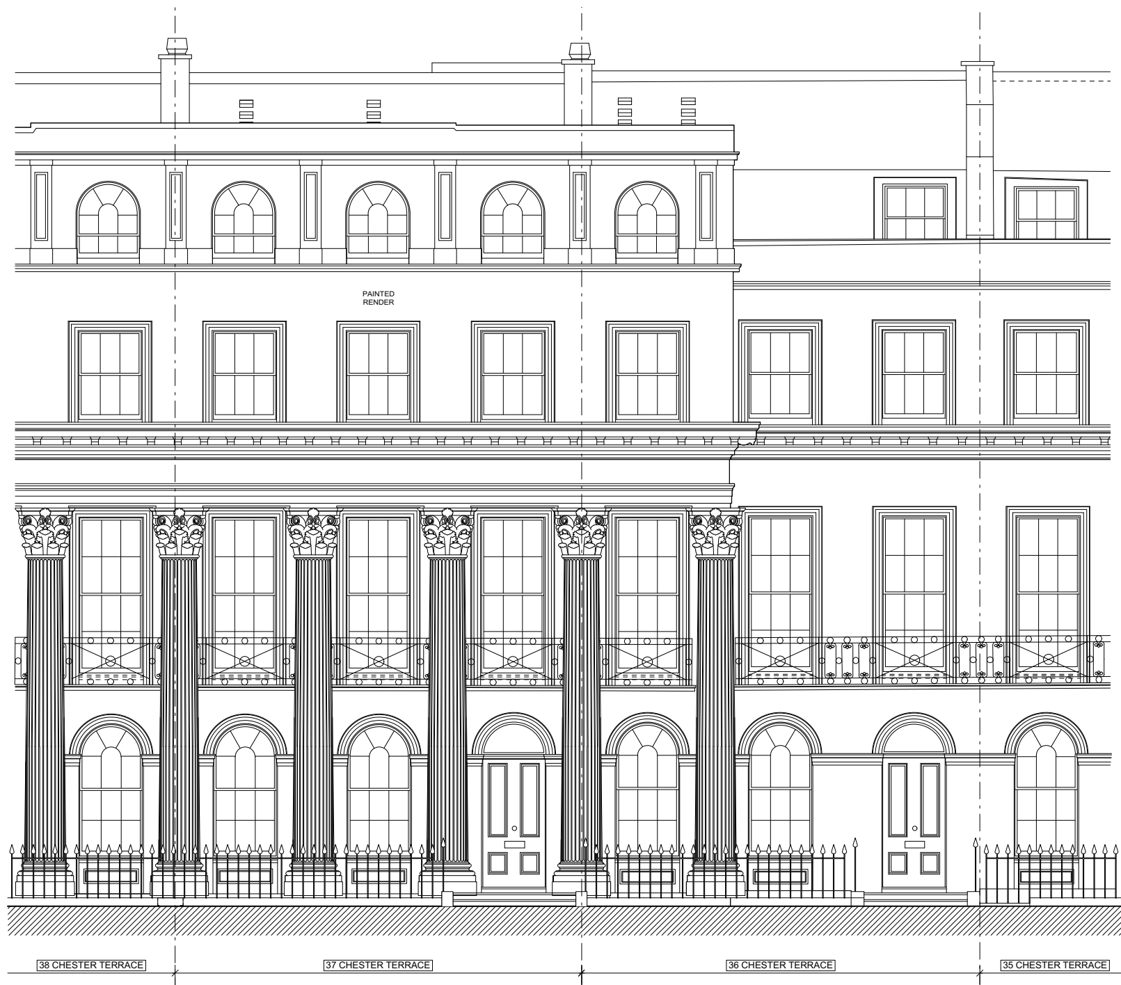
1 EXISTING FRONT ELEVATION SCALE 1:50 PL-17