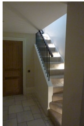
ELG01 STAIR HALL