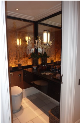
ELG04 WC 2

105 JERMYN STREET LONDON SW1Y 6EE T 020 7451 0955 mail@stanhopegate.co.uk www.stanhopegatearchitecture.com