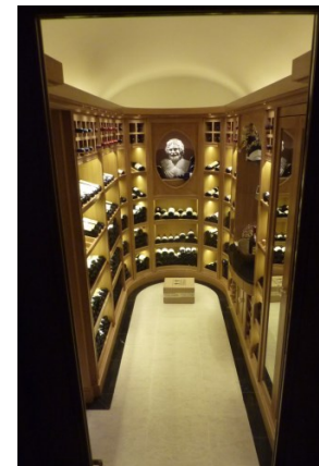
ELG14 - ELG15 WINE CELLAR