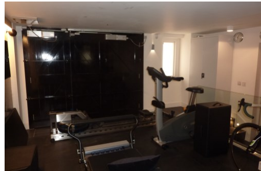
ELG03 GARAGE / GYM