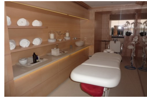
ELG10 MASSAGE ROOM