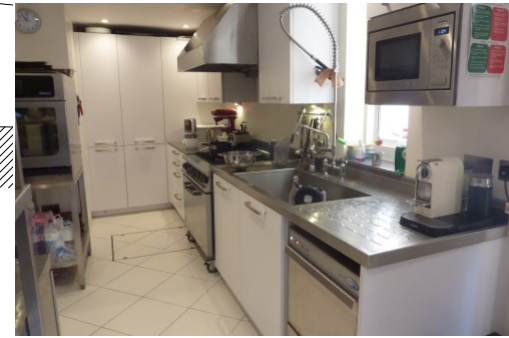
ELG07 CATERING KITCHEN