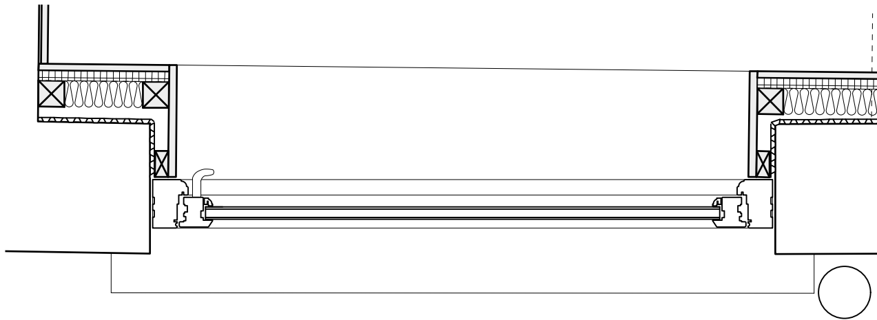
3 Section B-B 1:10@A3