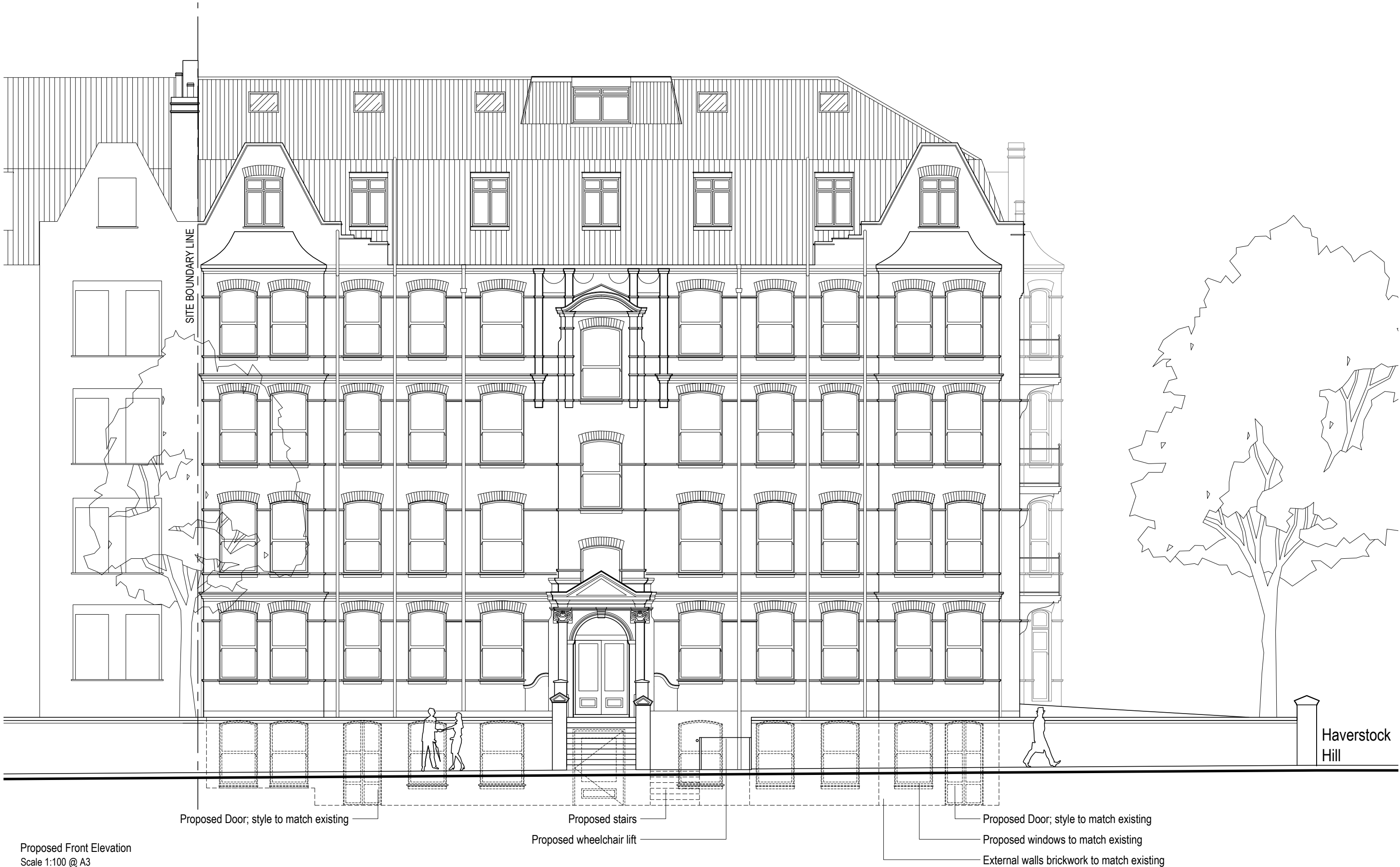
Proposed Front Elevation Scale 1:100 @ A3