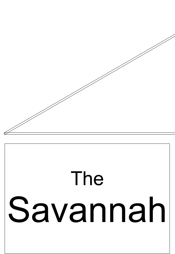
859/02/50/02 ELEVATION 2 Signage 3: Hanging Sign on Regnart Building