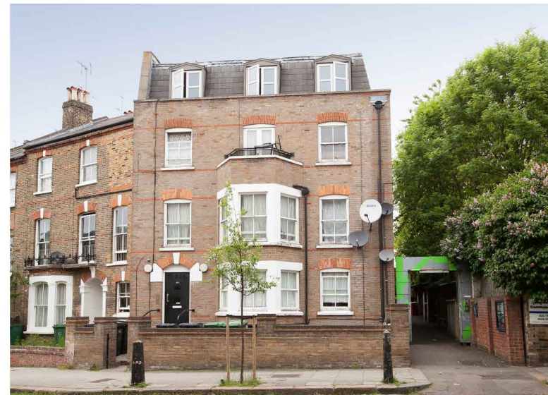
09 15 Busby Place; 4 Storey, Mansard Roof