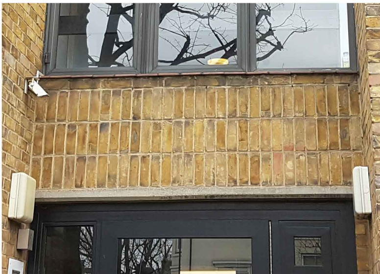
4. 254-256 Camden Road, Ashton Court; bands of soldier course brick between recessed door and window openings