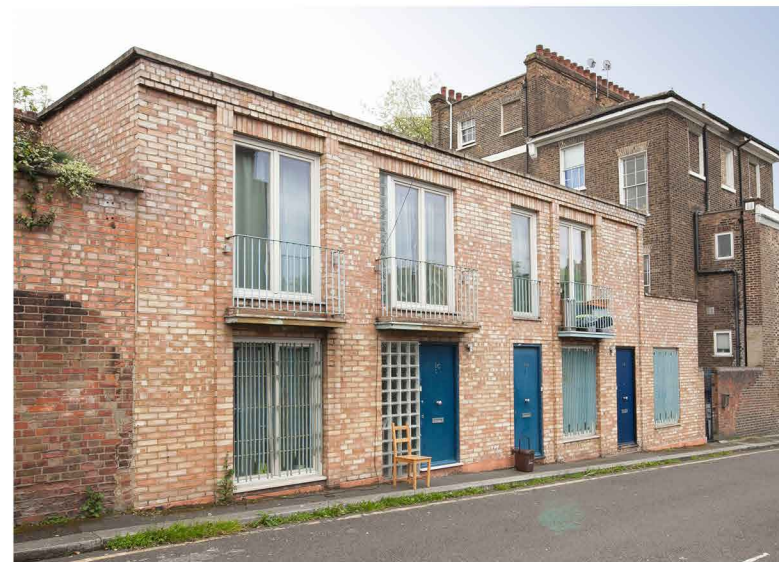
03 1A Hampshire Street; 2 Storey, Flat Roof