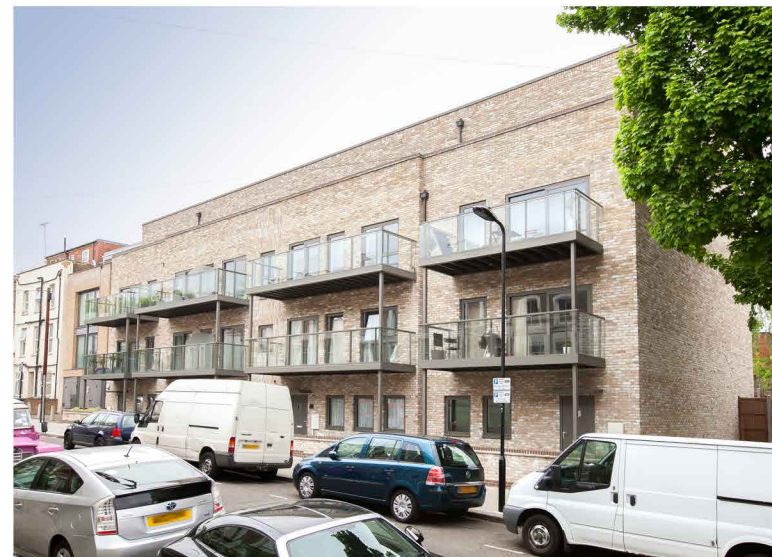
5. 47 Allcroft Road; 4 storey, set-back on top storey [PLANNING REFERENCE : 2014/1317/P] - Erection of a four storey building providing 18 residential units.