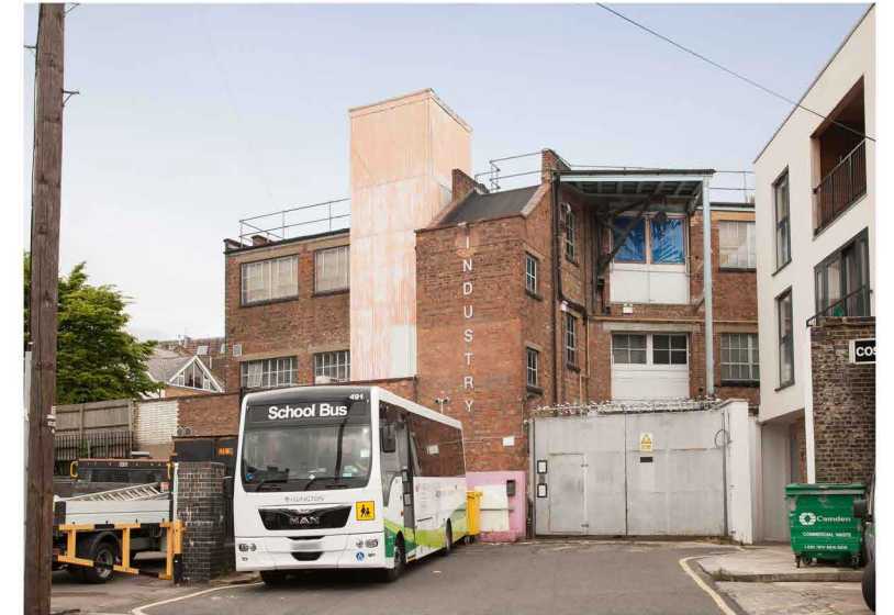
01 23-25 Hampshire Street The Industry Building; 3 + 4 Storey Flat Roof