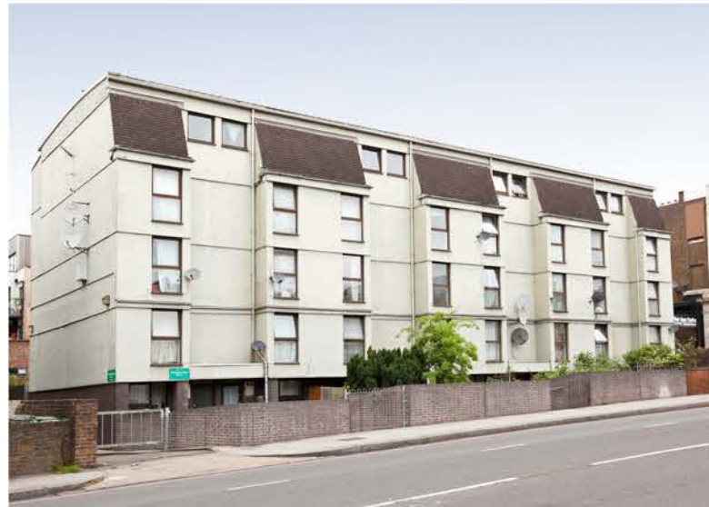
15 221 Camden Road; 5 Storey, Mansard Roof