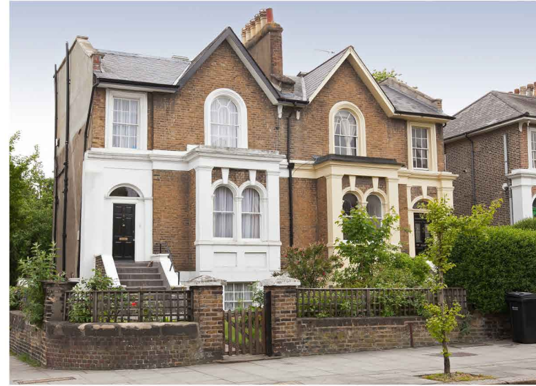
06 9 and 11 Torriano Avenue; 3 Storey, Pitched Roof