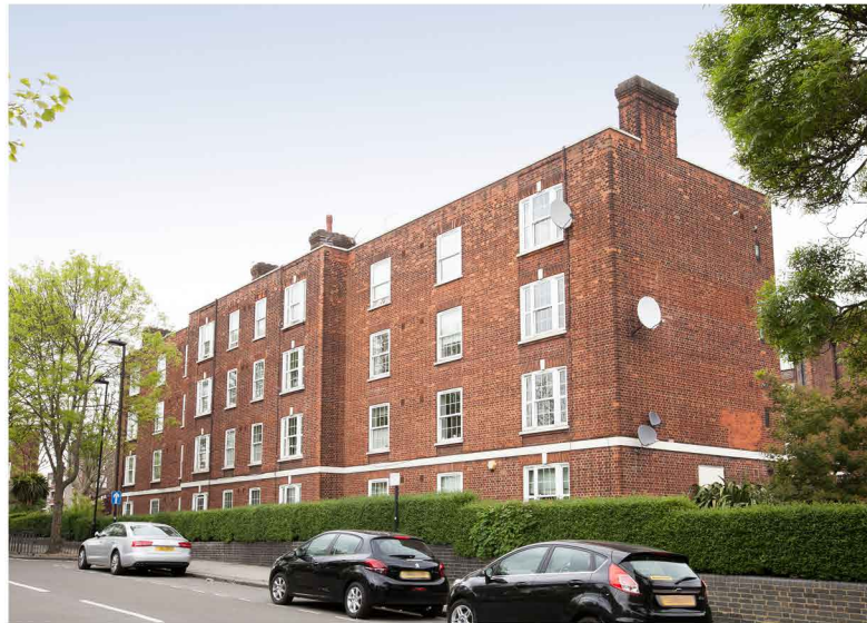
08 Carters Close, Torriano Avenue; 4 Storey, Flat Roof