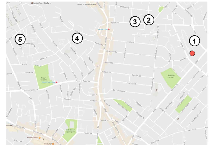
Location Map - No.1 Hampshire Street shown in red