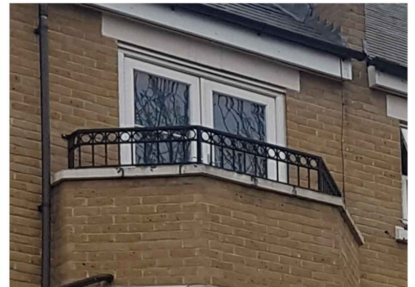
6. 1, 3, 5, and 7 Torriano Avenue; wrought iron railings with circular design beneath handrail