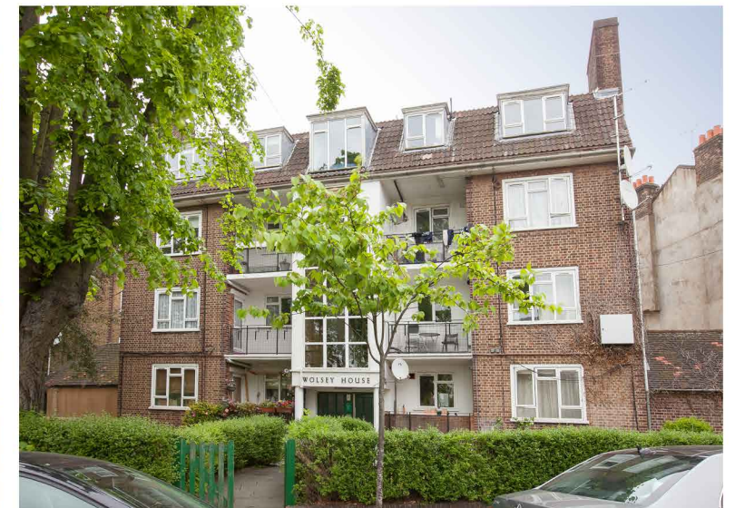
10 Wolsey House, Oseney Crescent; 4 Storey, Mansard Roof