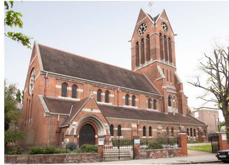
12 St Luke's Church Osney Crescent, built 1869. [GRADE II LISTED] (List Entry Number: 1113230)