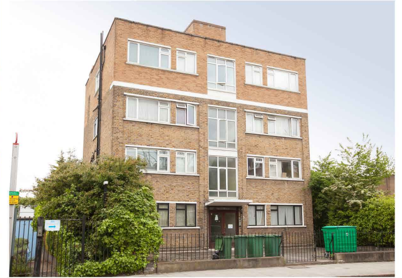
07 Florence Court, Torriano Avenue; 4 Storey, Flat Roof