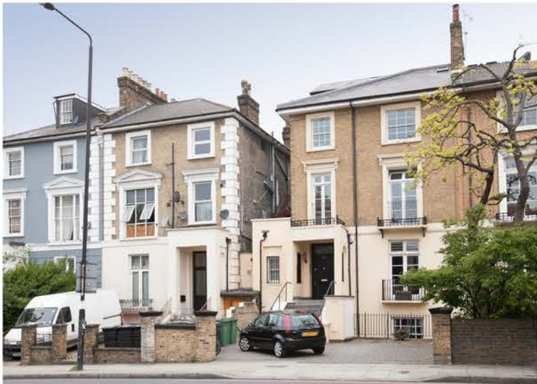
14 211 and 213 Camden Road; 4 Storey, Pitched Roof