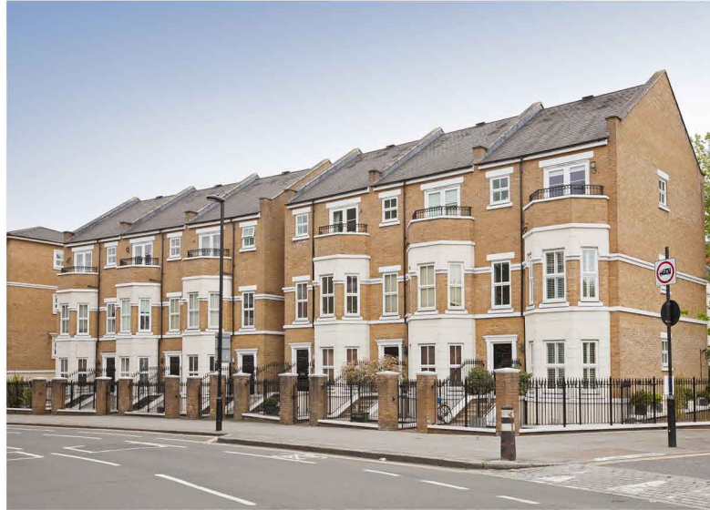
05 1, 3, 5, and 7 Torriano Avenue; 4 Storey, Pitched Roof

The building is not Statutorily Listed and nor would the proposals have any impact upon the settings of surrounding listed buildings, the two closest being the Grade II Listed Church of St Luke with St Paul on Oseney Crescent (List Entry Number: 1113230); and the Grade II Listed No. 62 Camden Mews (List Entry Number: 1392599).