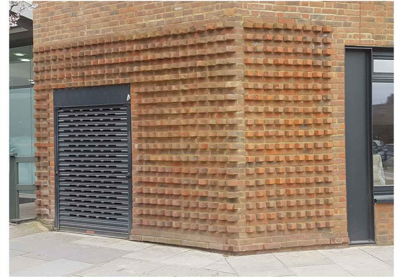
3. 59 Holmes Road; Hit + Miss brick pattern on corner