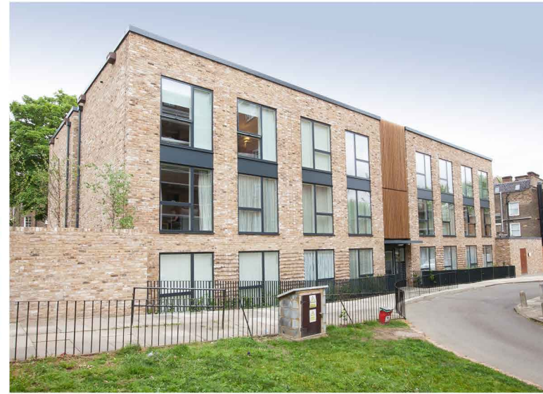
2. Willingham Terrace; 3 storey, flat roof [PLANNING REFERENCE : 2013/7338/P] - Erection of three storey building to provide 18 residential units following demolition of existing garages.