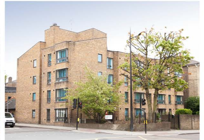
13 Ashton Court, 254-256 Camden Road; 4 Storey, Flat Roof