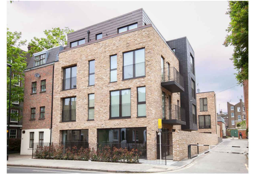
3. 59-61 Leighton Road; 4 storey, set-back on top storey [PLANNING REFERENCE : 2013/1614/P] - Erection of 2 buildings, one four storey mixed use with office at basement and ground floor level, and residential at basement, ground, first, second and third floor levels; one three storey residential building, with units at basement, ground, first and second floor levels, following demolition of existing public house.