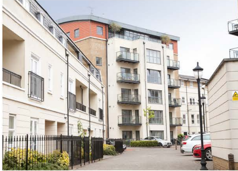
11 33 Canal Boulevard; 6 Storey, Curved Roof