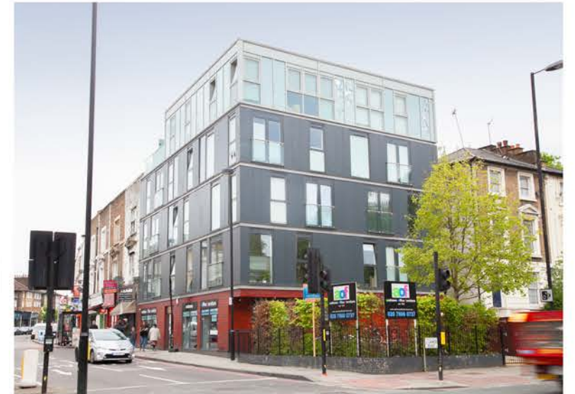
16 229 Camden Road; 5 Storey, Flat Roof