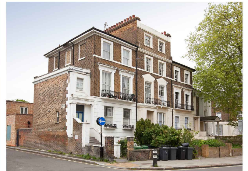
04 2, 4, and 6 Torriano Avenue; 4 + 5 Storey, Pitched Roof