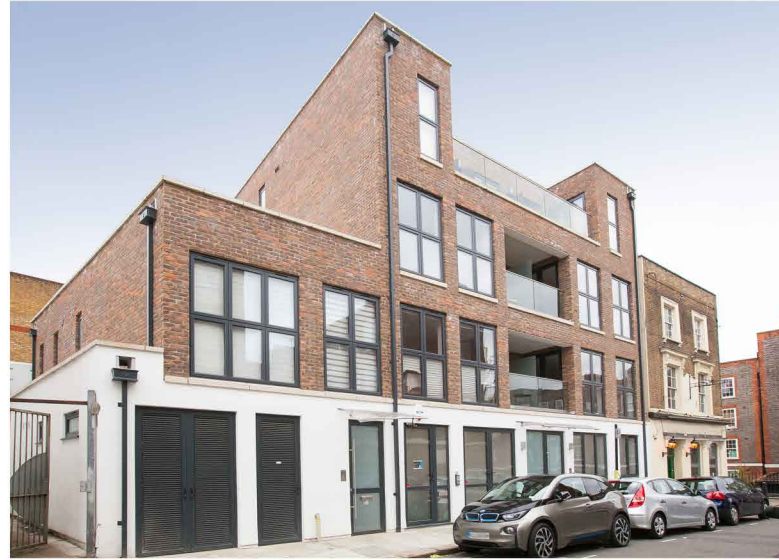
1. 1-7 Hargrave Place; 4 storey, set-back on top storey, sited next to smaller 3 and 5 storey buildings. [PLANNING REFERENCE : 2014/3714/P] - Erection of four storey building comprising light industrial unit on ground floor and 6 residential units on upper floors following demolition of existing light industrial unit.

The examples shown are all in or adjacent to blocks which are predominantly a storey or more shorter than the buildings themselves, without any detrimental effect to the block.