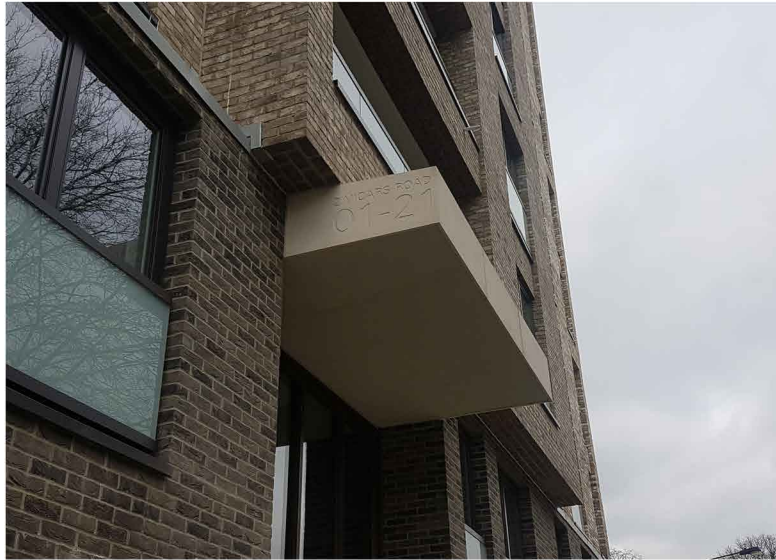
1. 2 Vicars Road; limestone entrance canopy over entrance to residences

These examples and precedents are representative of the use of materials in contemporary buildings in the area, and informed the materiality of the proposed development.