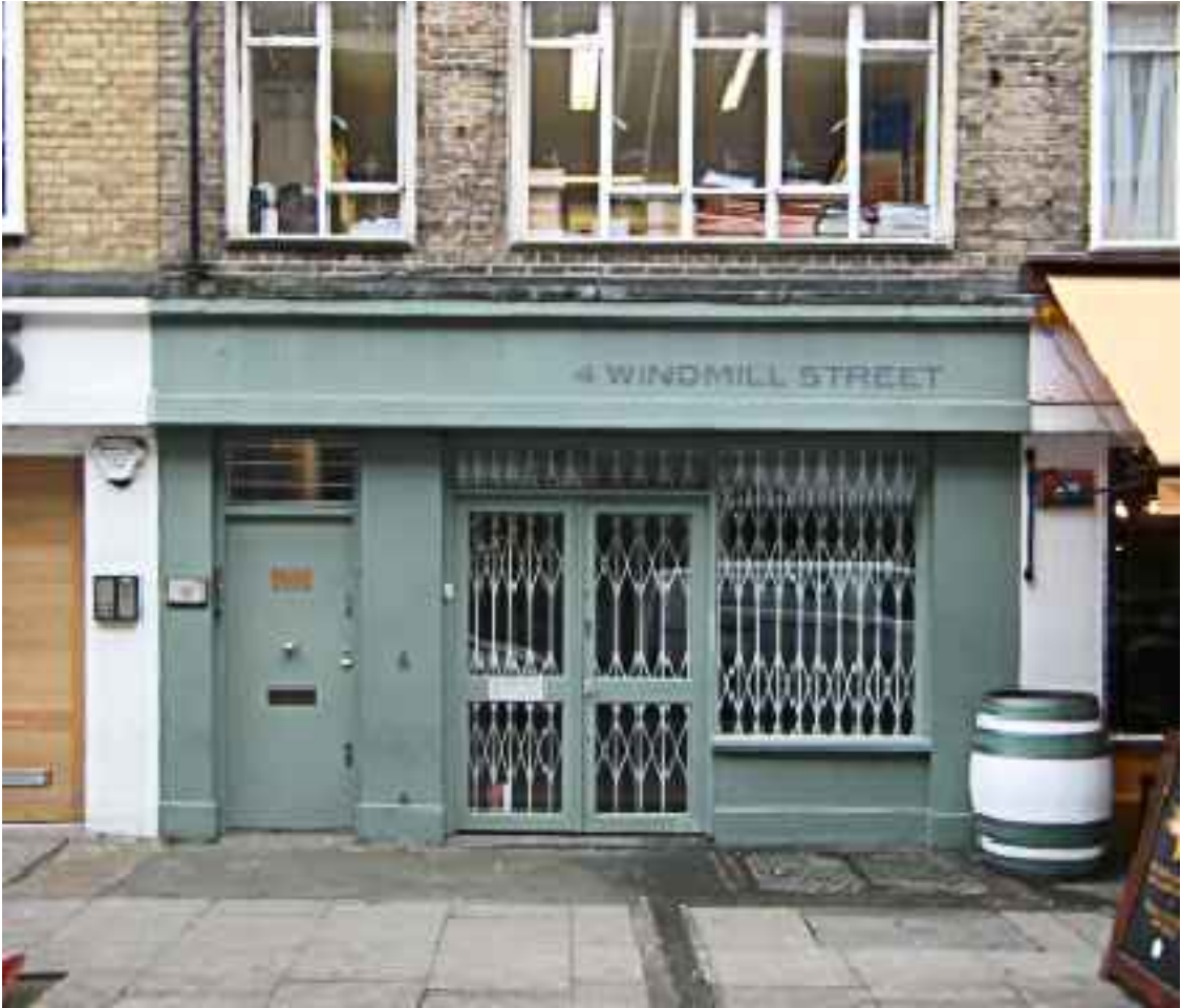
Existing Shopfront Photograph