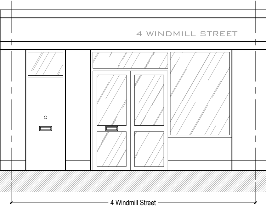
Existing Shopfront Elevation

12 Albion Street Brighton BN2 9NE 07973 151 494